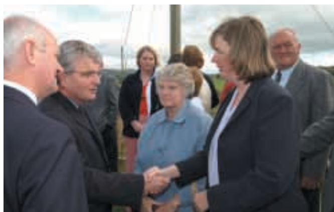
29th August 2002 – Des Browne meets relatives of the victims of the Teebane atrocity.