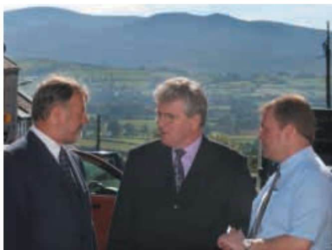
10th September 2002 – Des Browne visits South Down Action for Healing Wounds in Rathfriland.