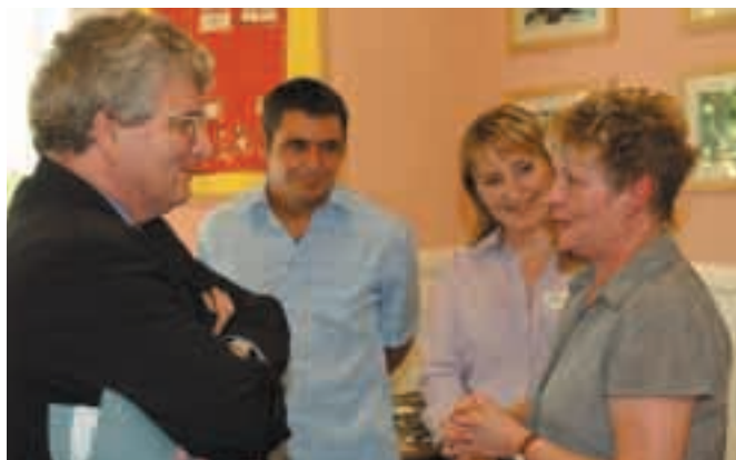
20th August 2002 – Des Browne meets staff and volunteers during a visit to WAVE in Belfast.