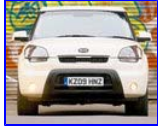
Kia's got it all wrapped up - mind, body and, of course, Soul