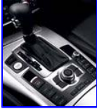
Comfortable, competent and compelling - that's the latest Audi A6