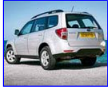
Take a pinch of SUV, a dash of estate and a slice of saloon car handling