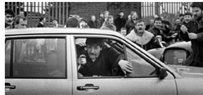
1988 - Corporals stripped, beaten and shot dead