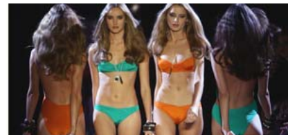
What's hot on the catwalks