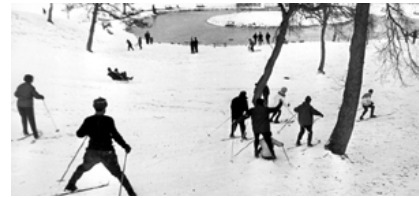
Ulster under snow