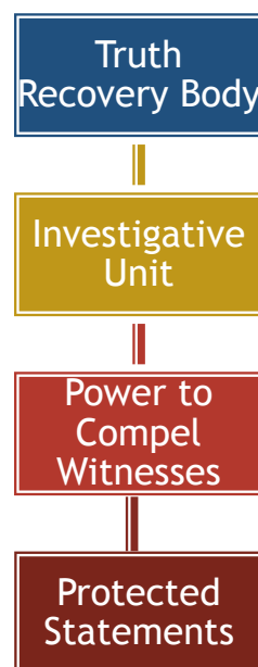
Figure 2: Truth Recovery and Use Immunity

Figure 2 illustrates the structure of this model.