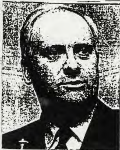
Taoiseach John Bruton, Prime Minister of Ireland

THE NEW YORK TIMES, FRIDAY, JULY 21, 1995