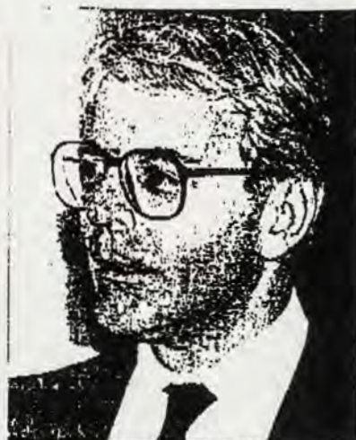
John Major, Prime Minister of the United Kingdom