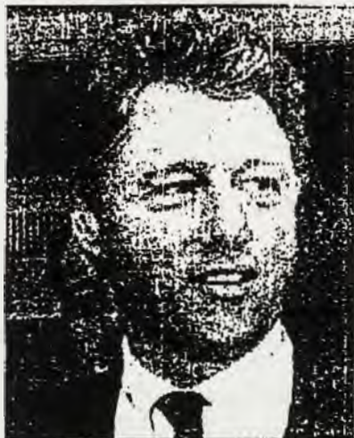
President Bill Clinton