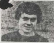
Age 20 Killed 30/12/90