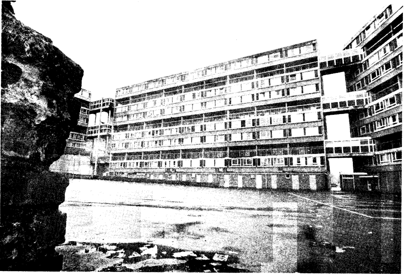
Photograph 1 shows the Rosville car park. The six foot exit into Joseph Place, through which people tried to flee, is bottom right.