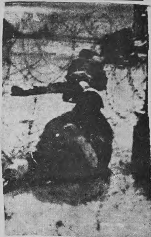
TROOPS LIE ON ROAD OPPOSITE UNITY FLATS TO ESCAPE BULLETS.

we do not relish the sight of protestant workers turning on their fellow workers. We do not rejoice when any section of the working class is beaten off the streets by the army. True, for the moment the army is protecting Catholic areas, and that on Saturday soldiers were injured protecting Unity Walk, but in the final analysis the role of the army is imperialist, it is here to protect the business and political interests of the British ruling elite, an elite which has as little interest in the fate of the people on the Shankill as it has in the people on the Falls.