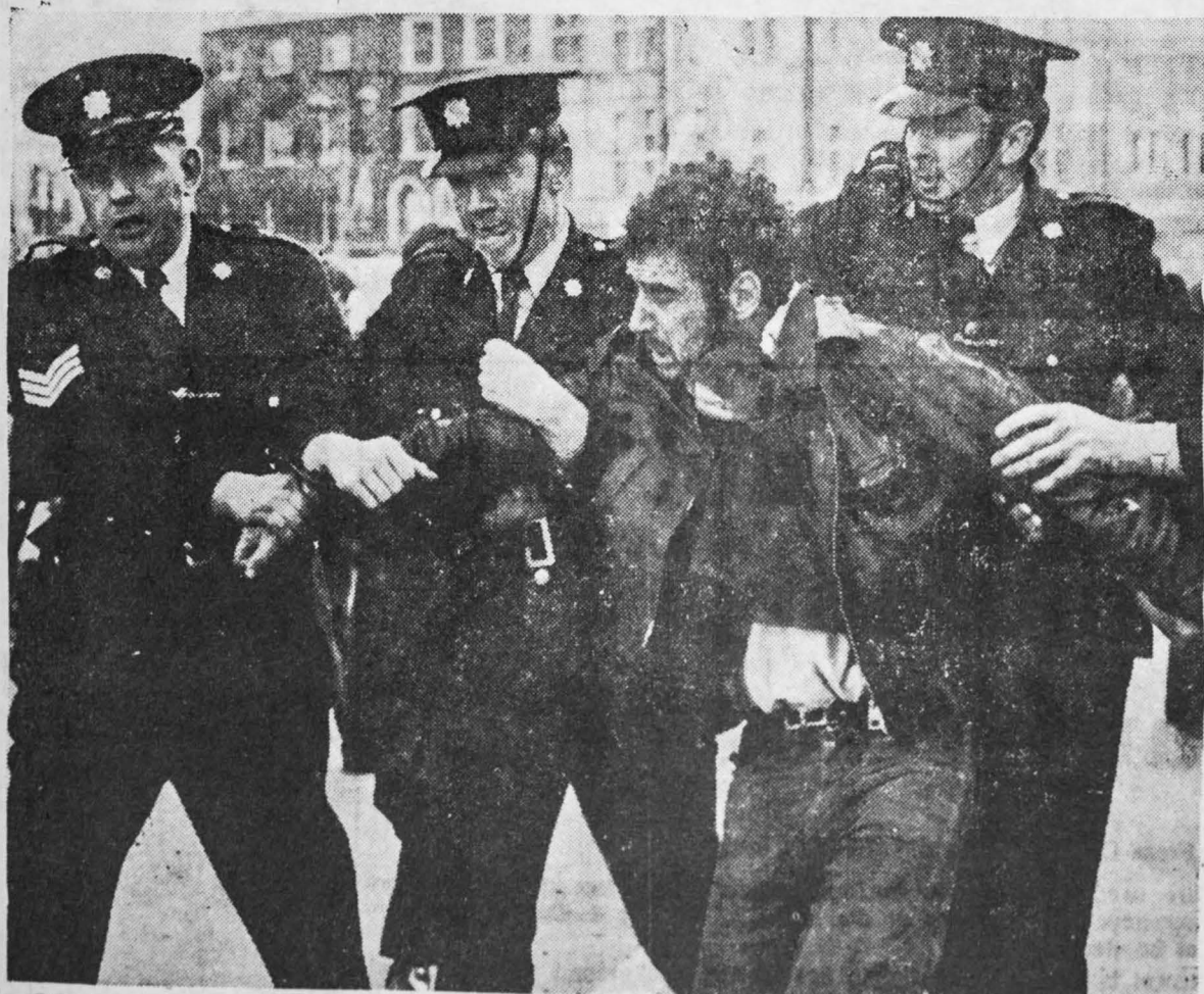
GARDAI ARREST DUBLIN HOUSING PROTESTER