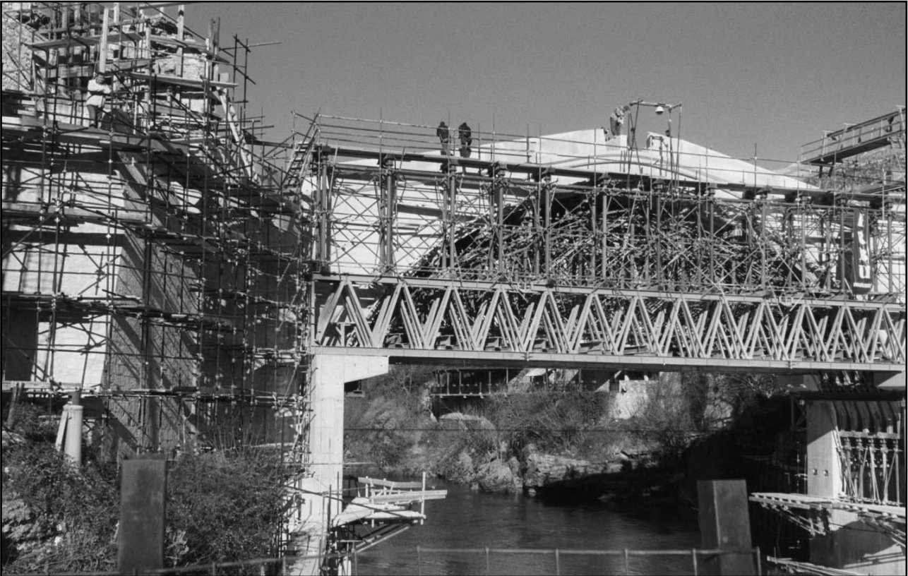
Symbol of reconciliation—but the completion of the bridge at Mostar in Bosnia belies a still sharply divided city