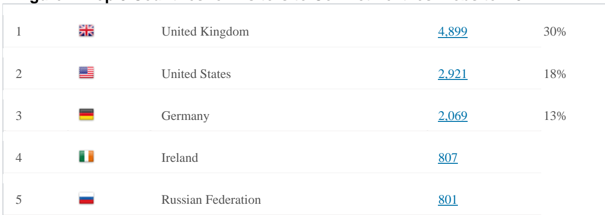
Figure 2: Top 5 Countries for visitors to Conflict Textiles Website 2021

All textiles documented in the collection and all events are important to us. However, it is interesting to note the most viewed pages in 2021. (Home page and general search pages details are available but are excluded from this listing).