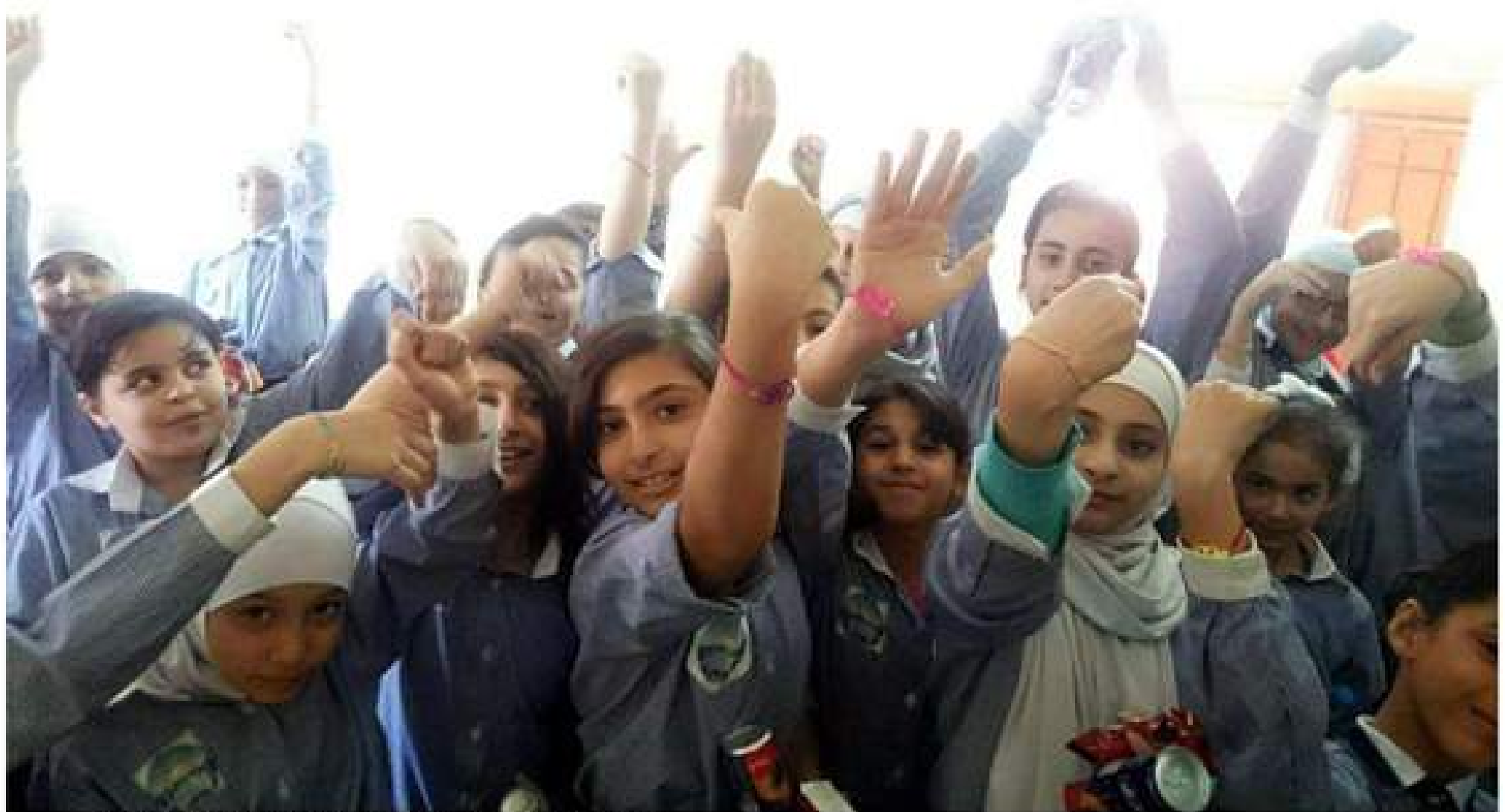
Syrian refugee girls with bracelets they have made, Amman, Jordan, Za'arari refugee camp, November 2016