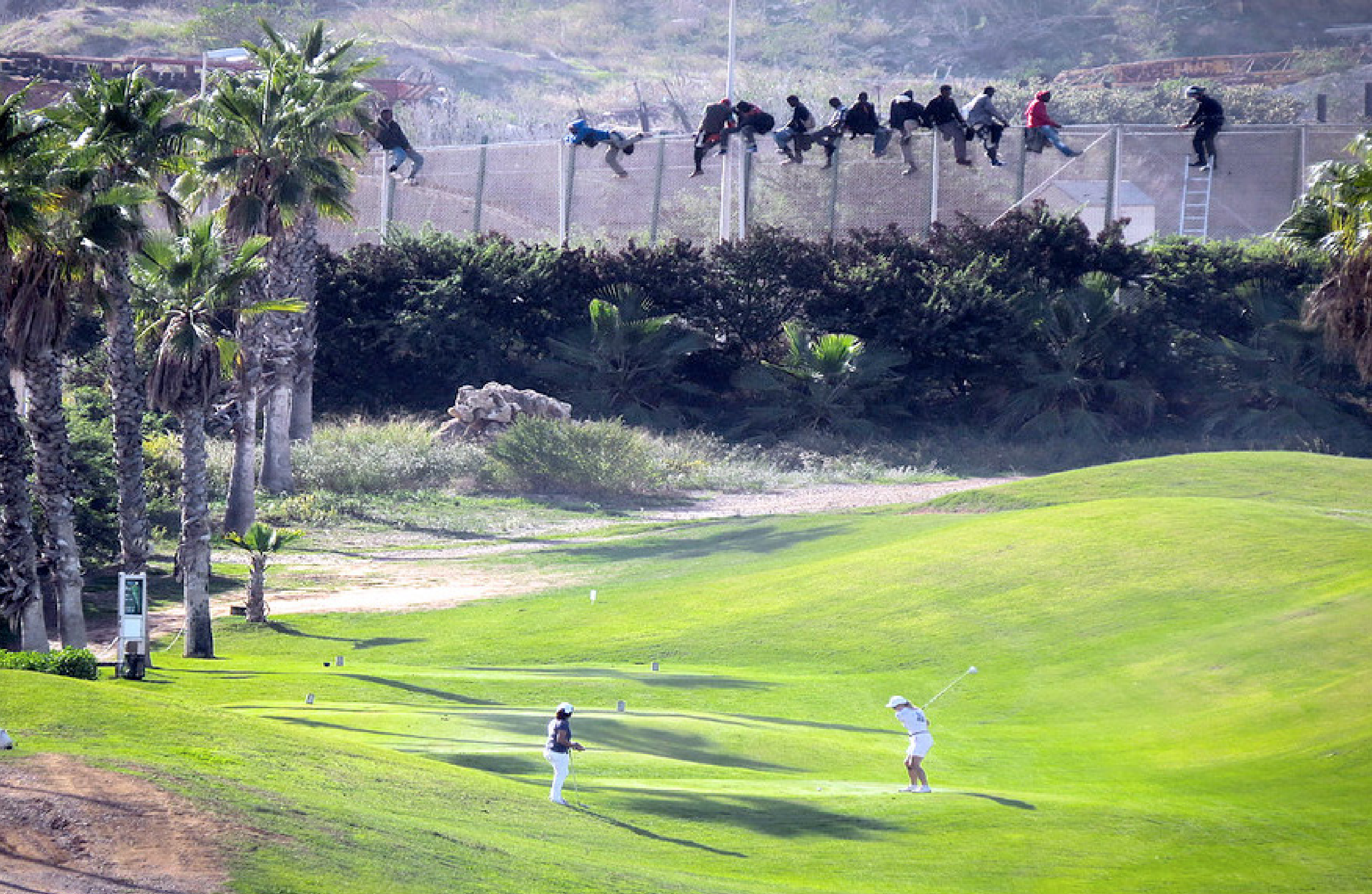
Fence at MELILLA (Spain) • 2016