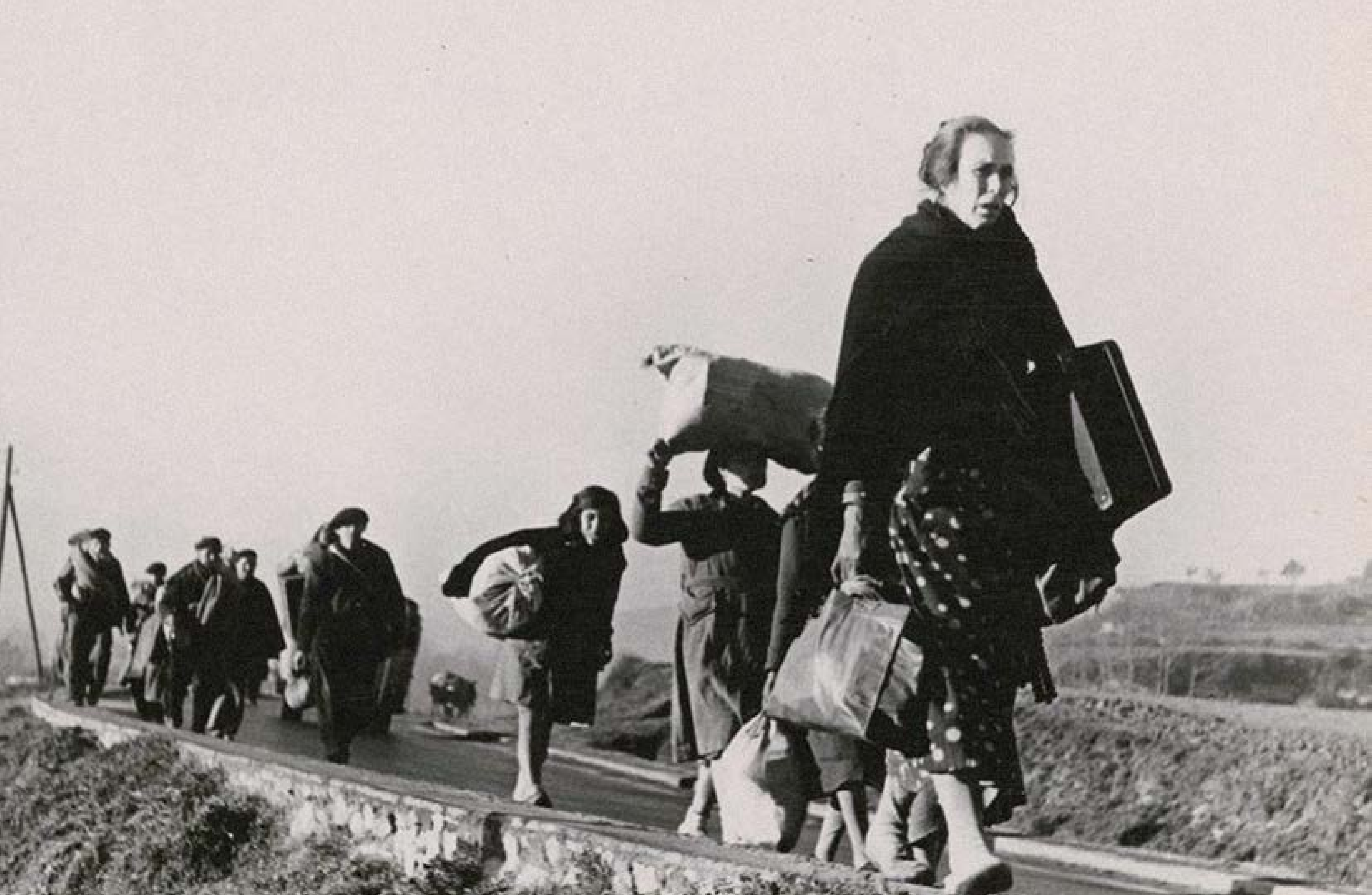
Fleeing into exile · MÁLAGA (Spain) · 1939 · Robert Capa