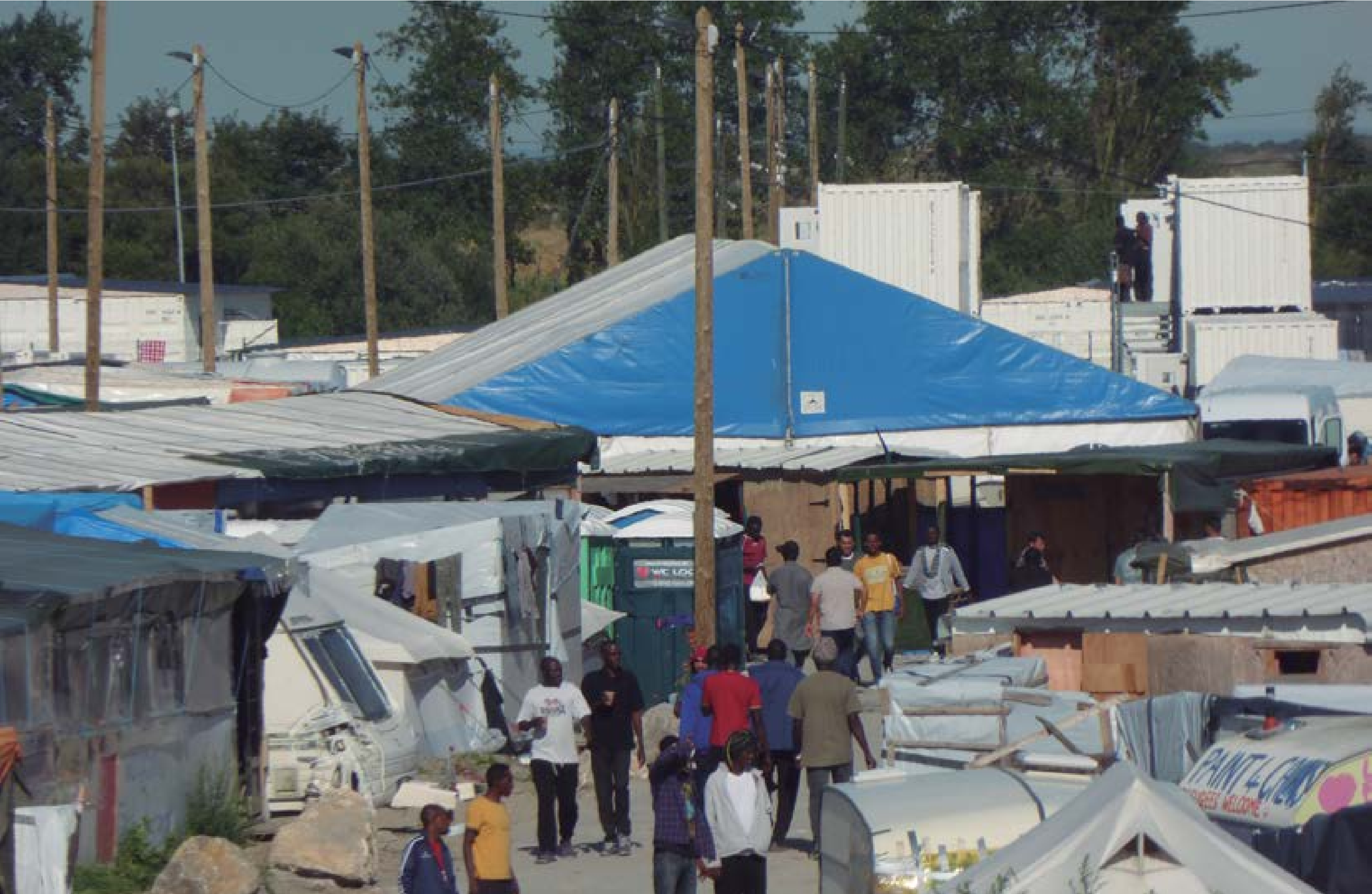
CALAIS refugee camp (France) · 2016 · Javier Sánchez Monedero