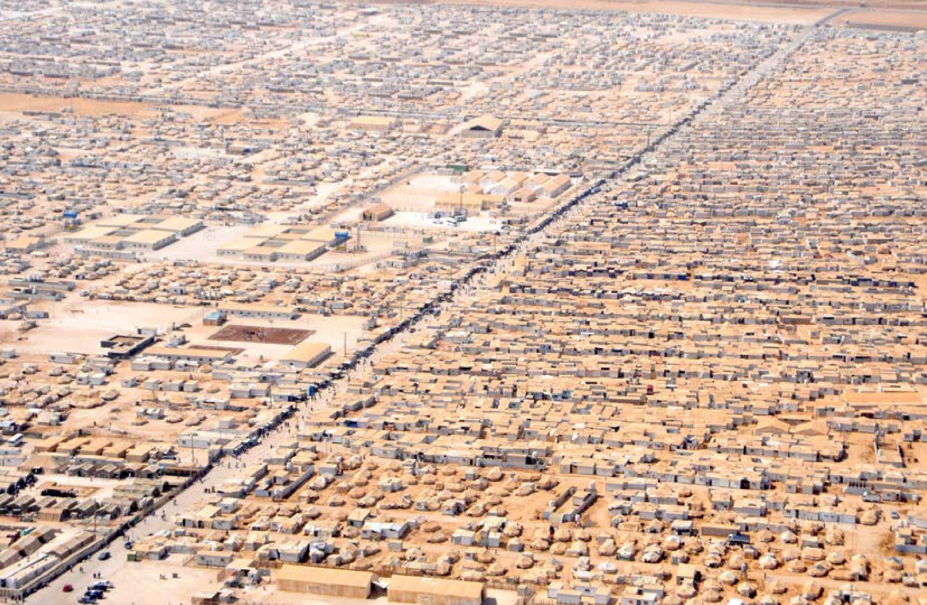
ZAATARI Refugee Camp (Jordan) • 2013