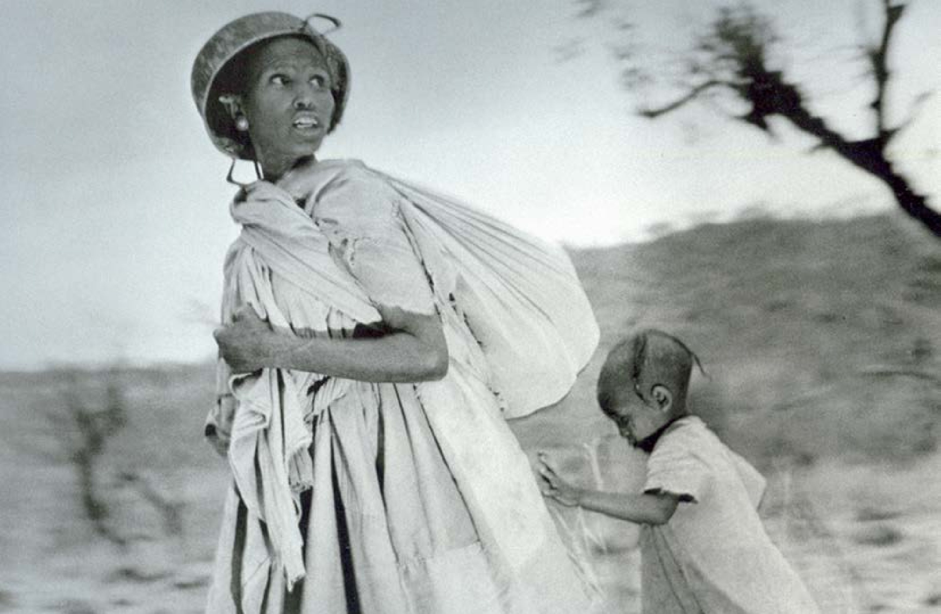
Escaping from war · TIGRE (Ethiopia) · 1985 · Sebastião Salgado

Image taken from "The Salt of the Earth", the documentary film directed by Wim Venders & Juliano Ribeiro Salgado (2014)