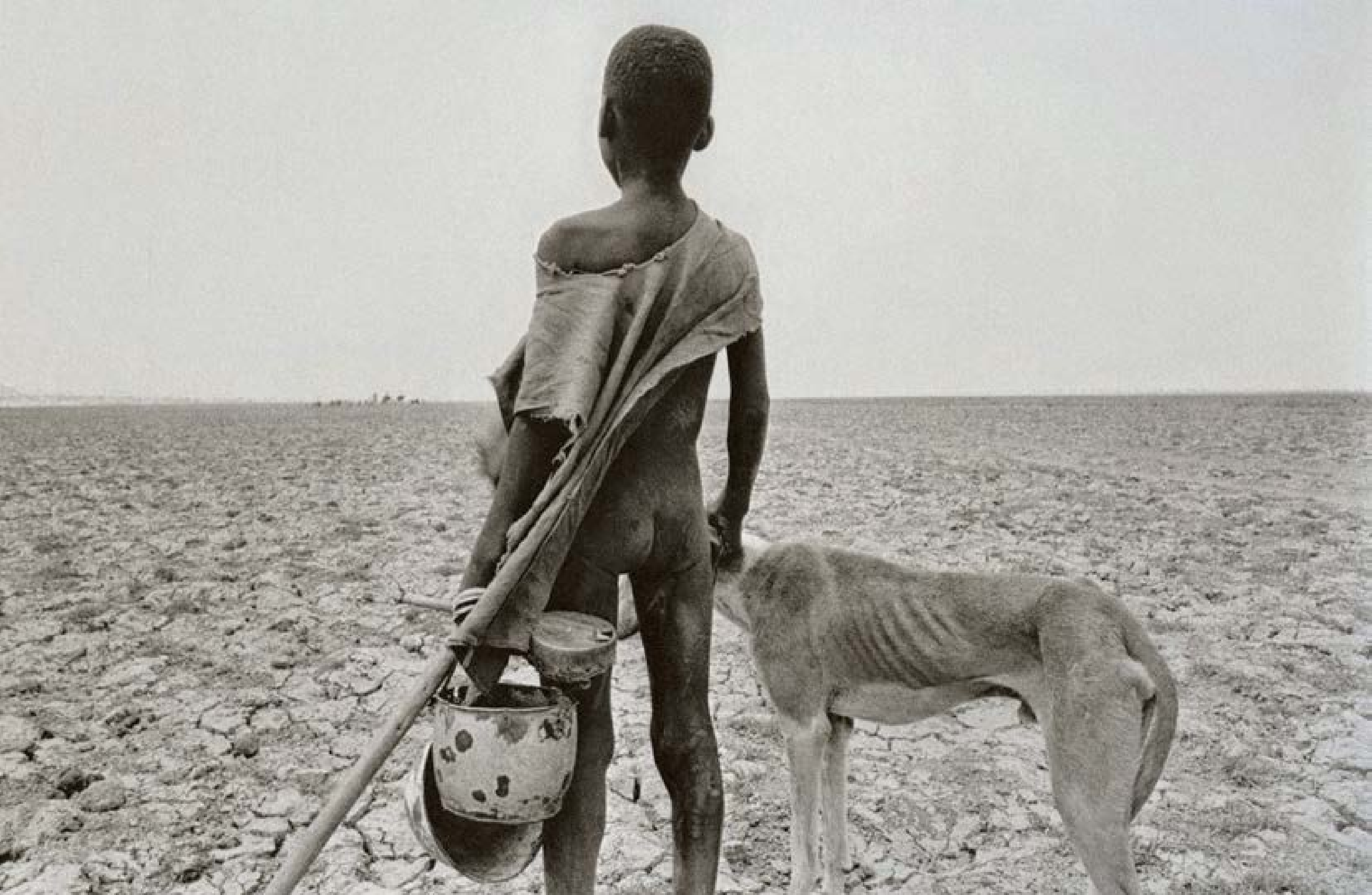
On the way to MALI refugee camp · 1984 · Sebastião Salgado

Image taken from "The Salt of the Earth", the documentary film directed by Wim Venders & Juliano Ribeiro Salgado (2014)