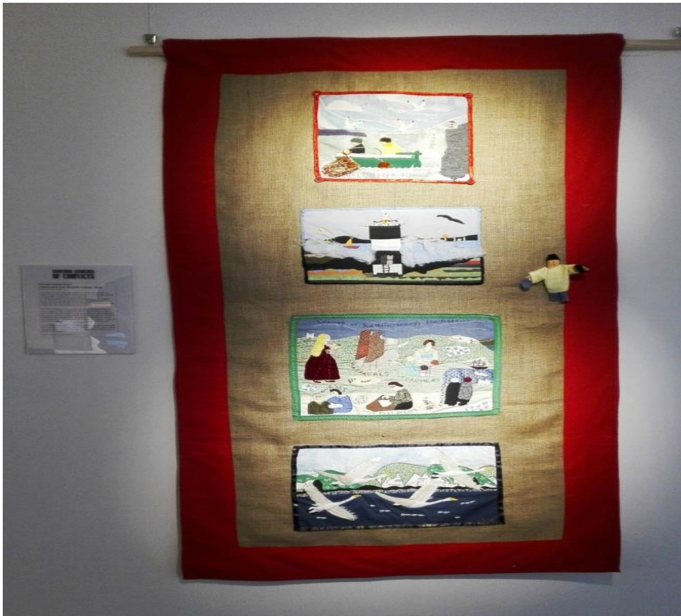
“Billy” created by Anthony approaching “Our Island Apart” by Ladies who sew (Rathlin Island)