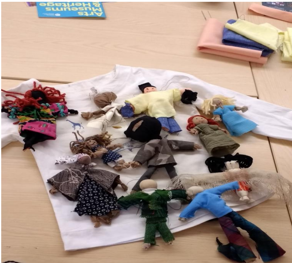
The finished dolls made by workshop participants.