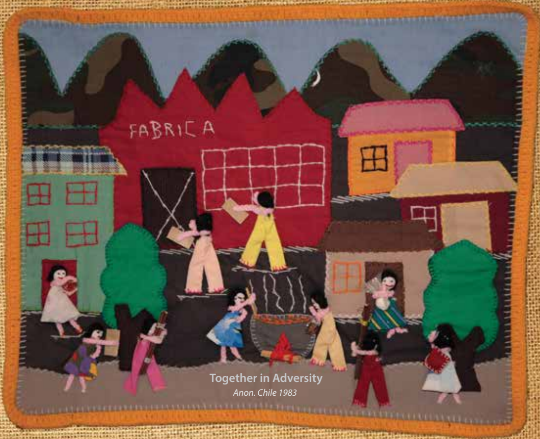
Together in Adversity Anon. Chile 1983