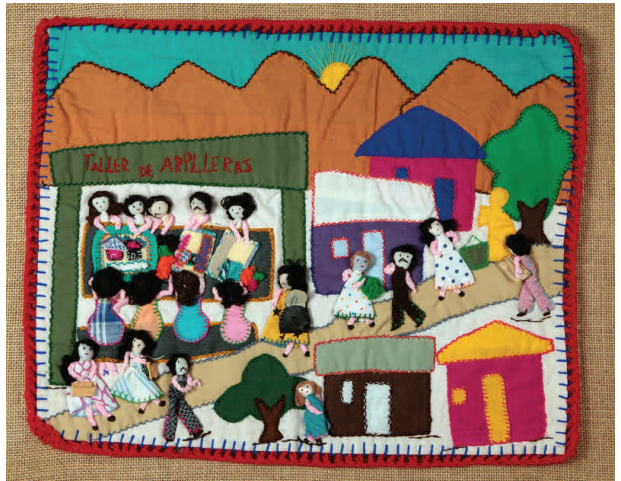
Taller de Arpilleras, Collection of Oshima Hakko Museum, Japan

This meeting will foster international collaboration across disciplines to further the work of narrative textiles for human rights, healing of trauma, and empowering women. The sessions will blend practice with theory, and give opportunities for each participant to share her work and wisdom. This conference will focus on developing insights and connections, yielding new collaborations, clarity of purpose, and a worldwide network of women who will continue their healing and empowering work within their communities.