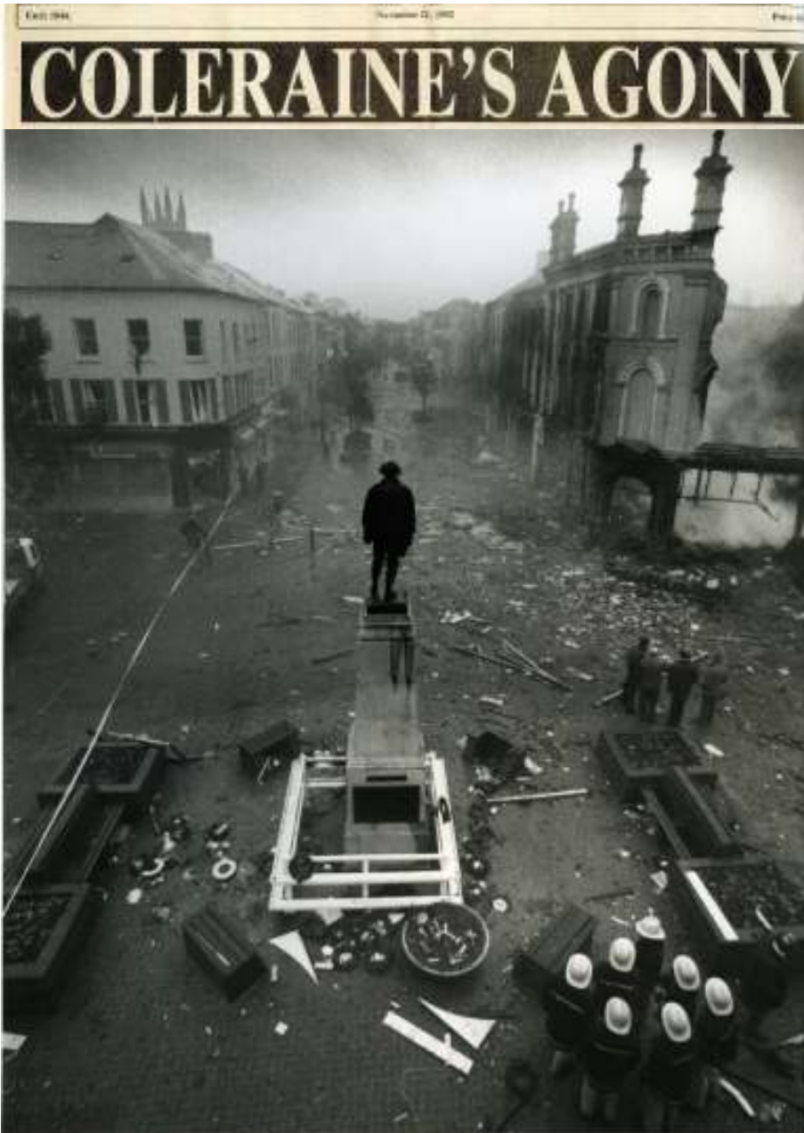
Aftermath of Coleraine bomb, 1992