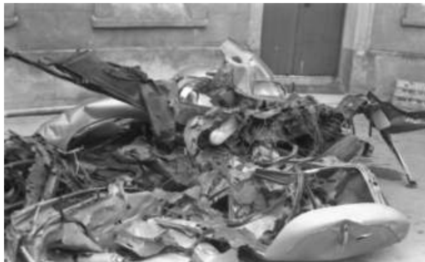
Ballymoney Car bomb, 1976.

http://www.planningni.gov.uk/downloads/conservation-carnlough.pdf (p13)