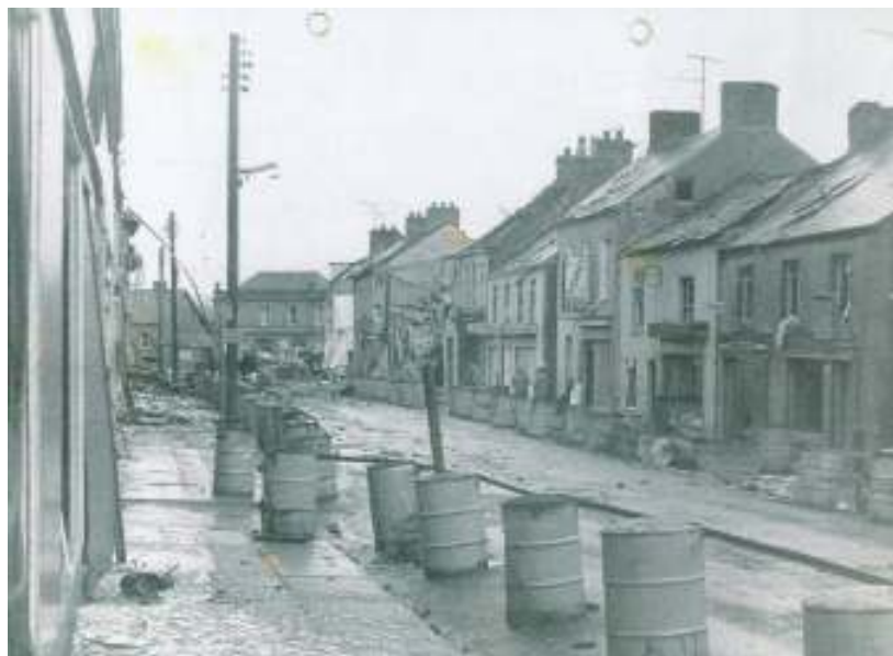
Aftermath of Kilrea bomb, 1976. Courtesy of a local family