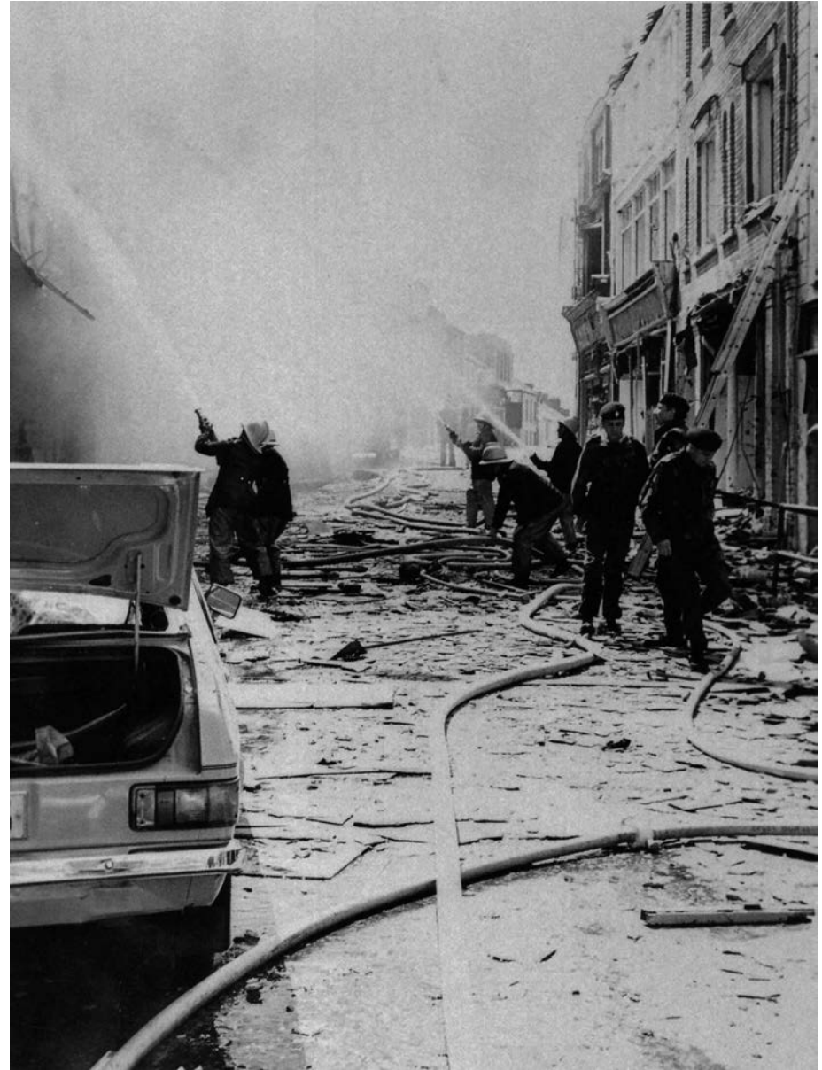
Aftermath of Ballymena bomb, 1979

http://cain.ulst.ac.uk/sutton/alpha/M.html