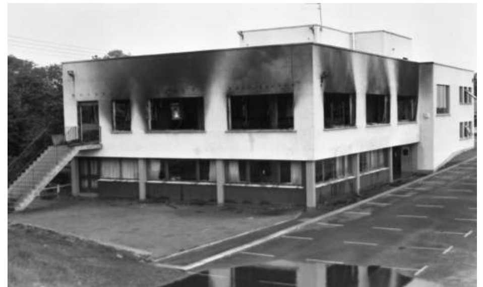
Ballycastle Golf Club bomb, 1985