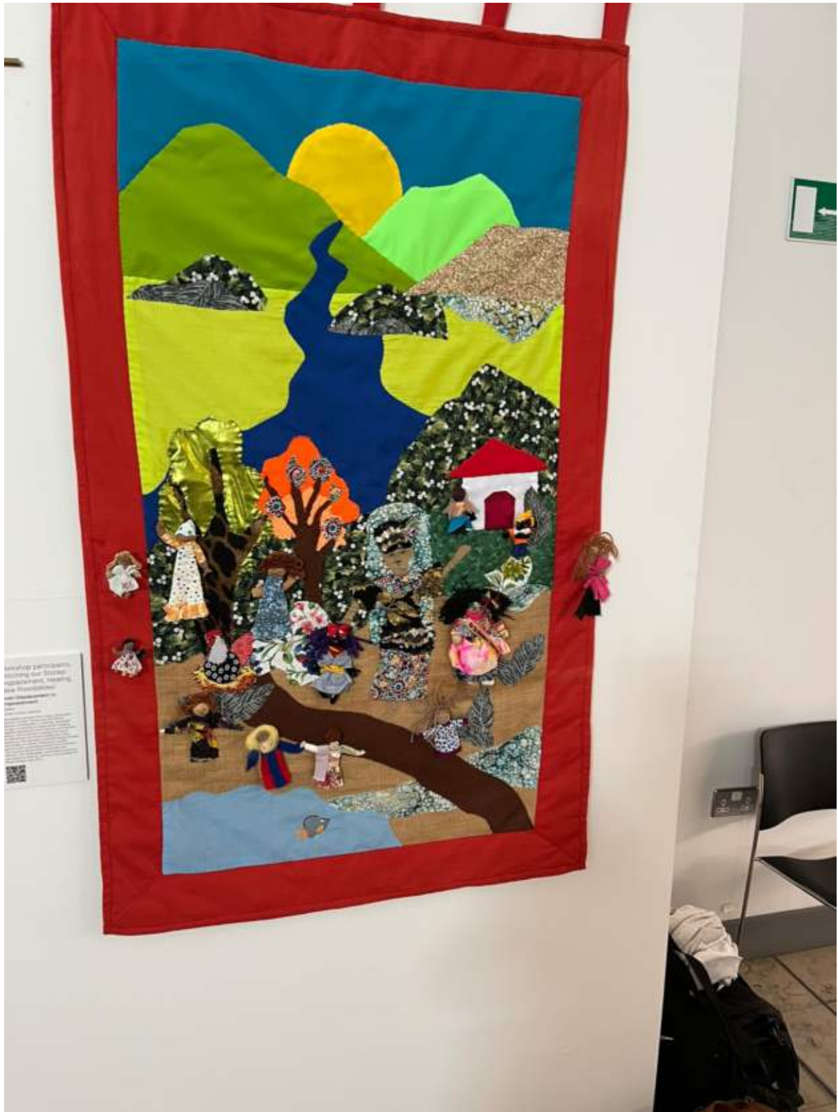
Several other students selected an arpillera from Mampuján (Colombia), explaining how the vibrancy and resilience of the dolls resonated with that piece, in particular.