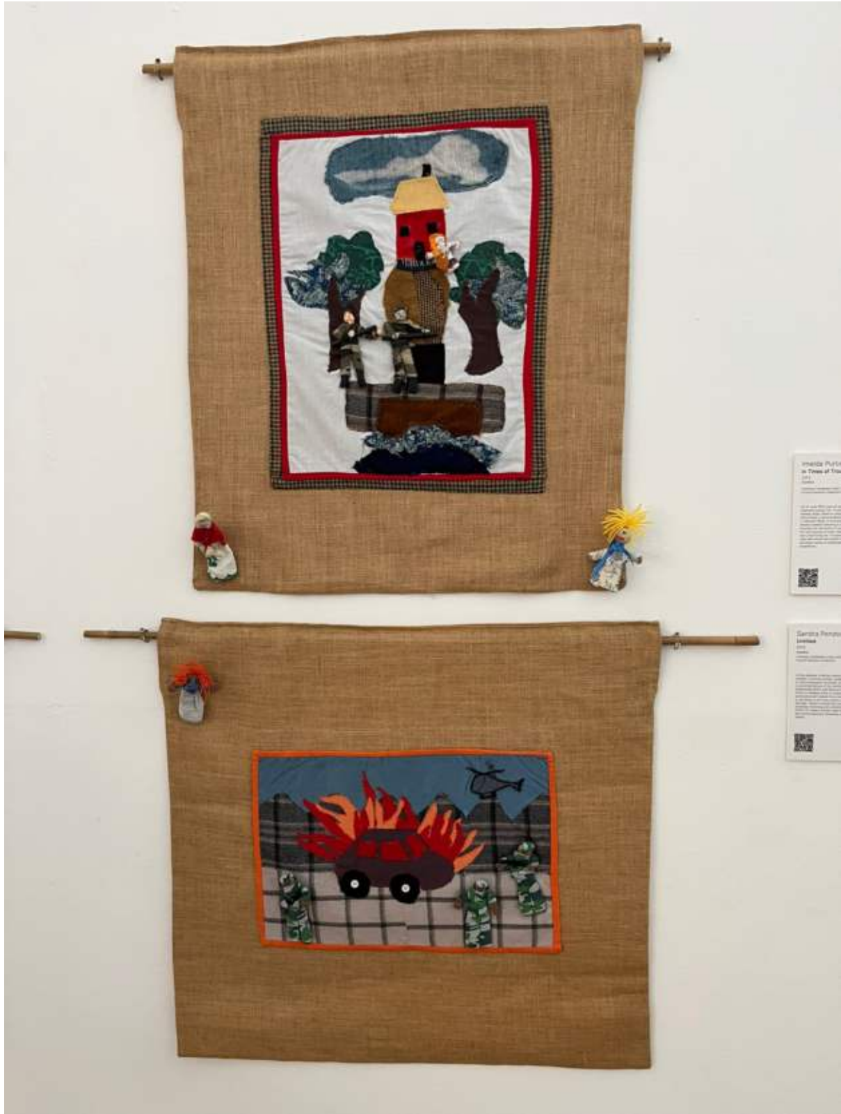
Several students chose to pin their dolls onto arpilleras depicting aftershocks of the Troubles, reflecting a strong resonance with lived experience in Northern Ireland.