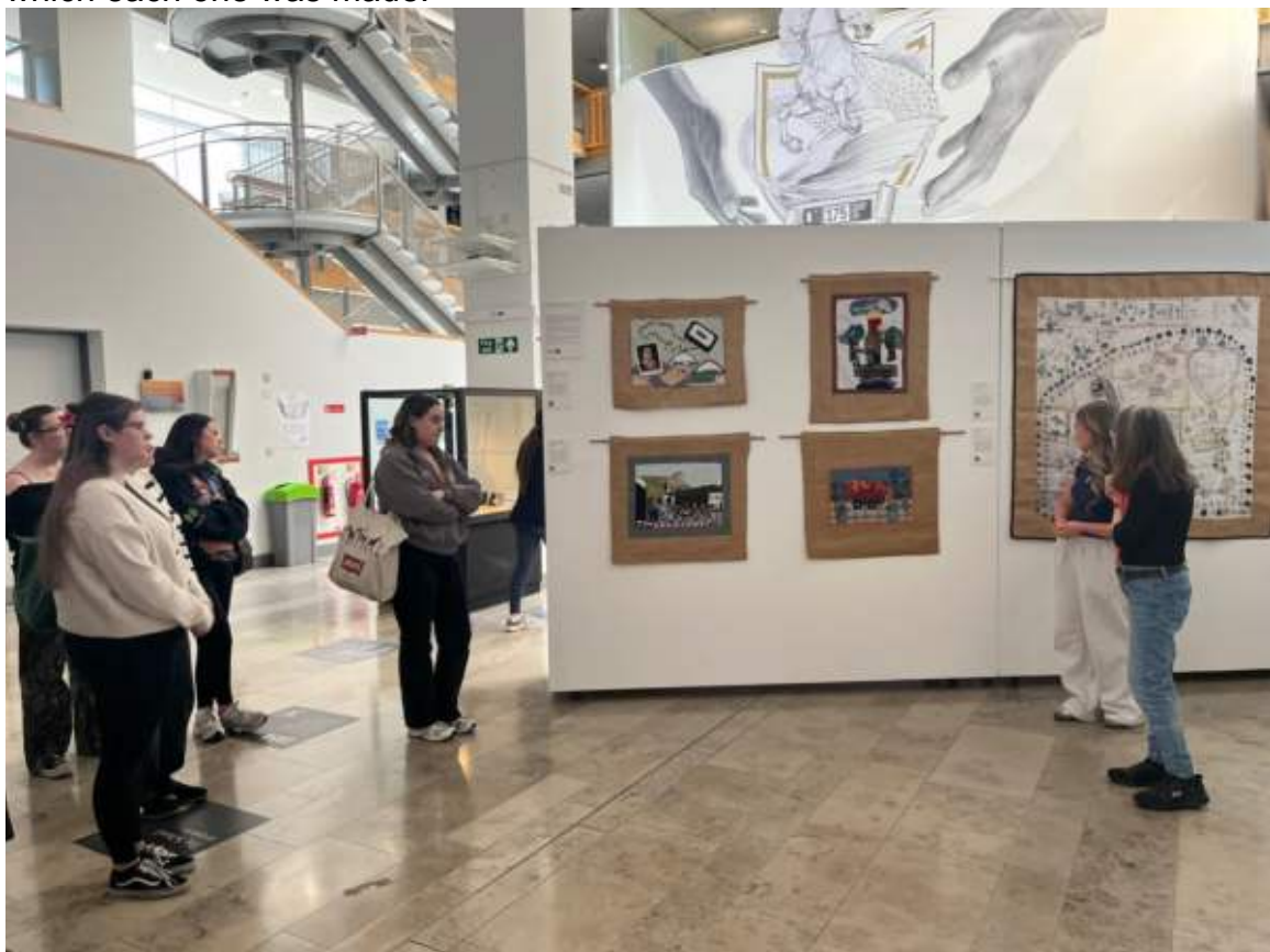
Students return to the arpilleras and consider which one resonates most with the story of their dolls.