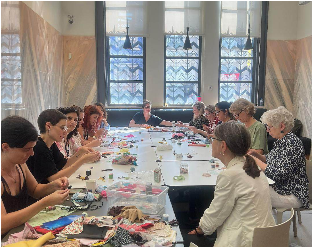
Participants make and dress their dolls, sharing tools and materials and helping each other in the process.