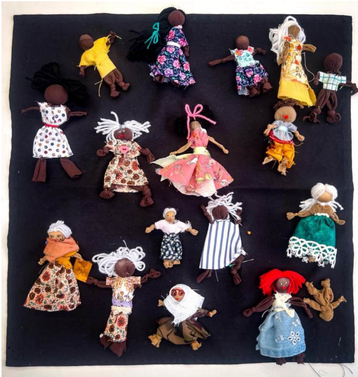
Workshop participant's final dolls, ready to be added to the backing.