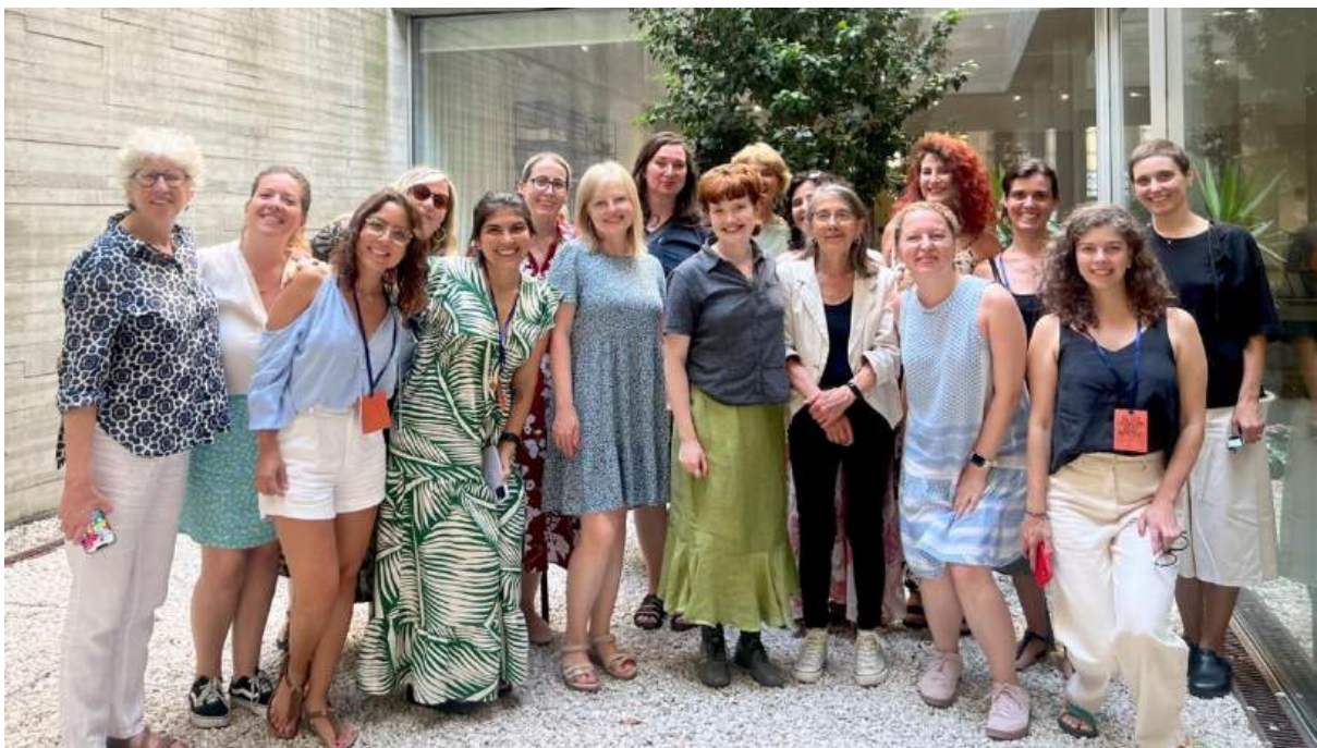
Group photograph of workshop participants and facilitators in the inner patio.