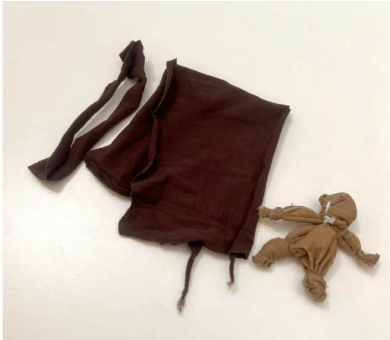
A preprepared example doll and scraps of tights ready to make another.