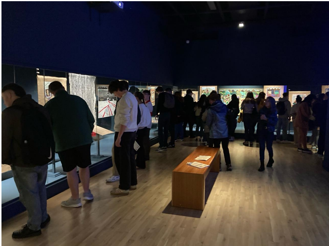
Students from Ulster University take some time to look through the exhibition individually, connecting with and reflecting on the pieces on display.