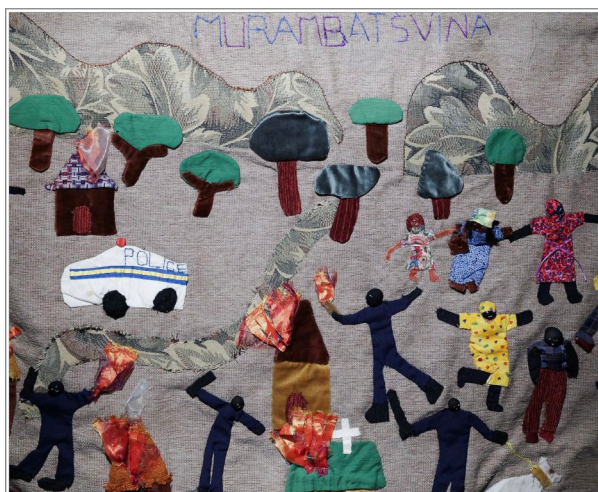
The day we will never forget

In a world that often denies the right to resist, in this symposium scholars, artists, textile-makers and activists will explore the multifaceted ways textiles can serve as a powerful medium for expressing, documenting, and archiving narratives of resistance. This symposium transcends traditional notions of protest and vocal activism, highlighting the quieter, more subtle forms of resistance that emerge through textile-making practices. We are particularly interested in examining how the imagery of a single thread or the accumulation of small, meaningful actions can weave together into a bold tapestry of dissent.