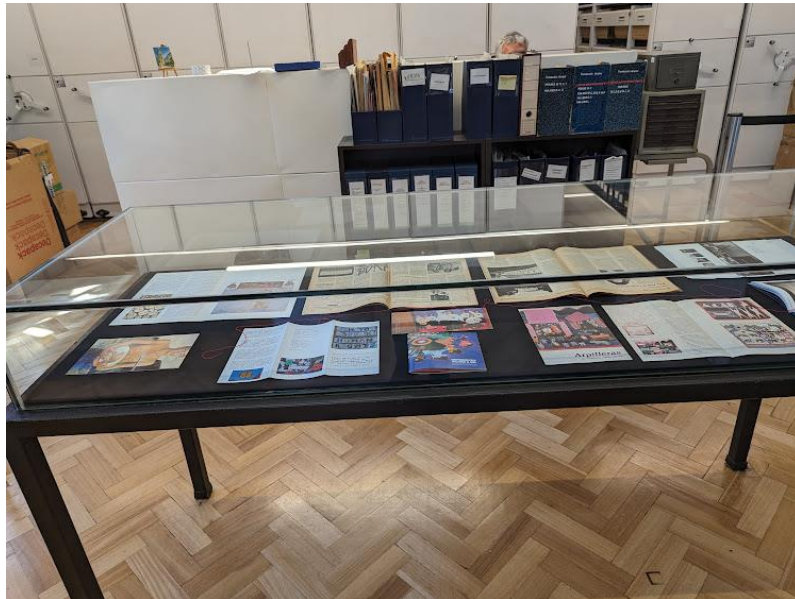
A central display case with additional archival materials related to arpilleras from the Conflict Textiles Collection.