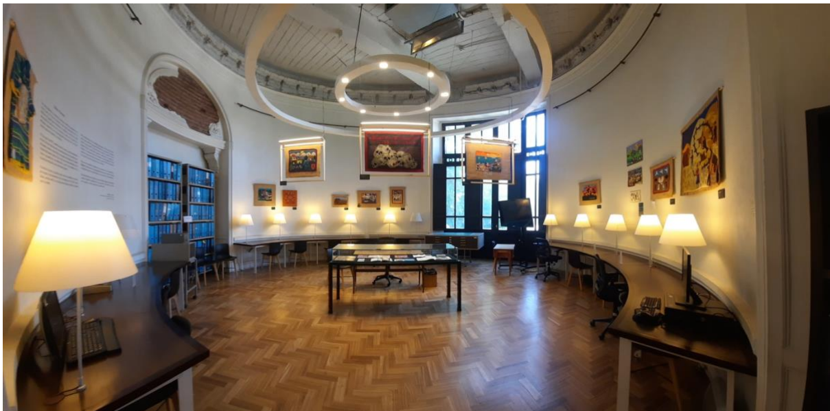
A view of the exhibition from the entryway to the CEDOC reading room.