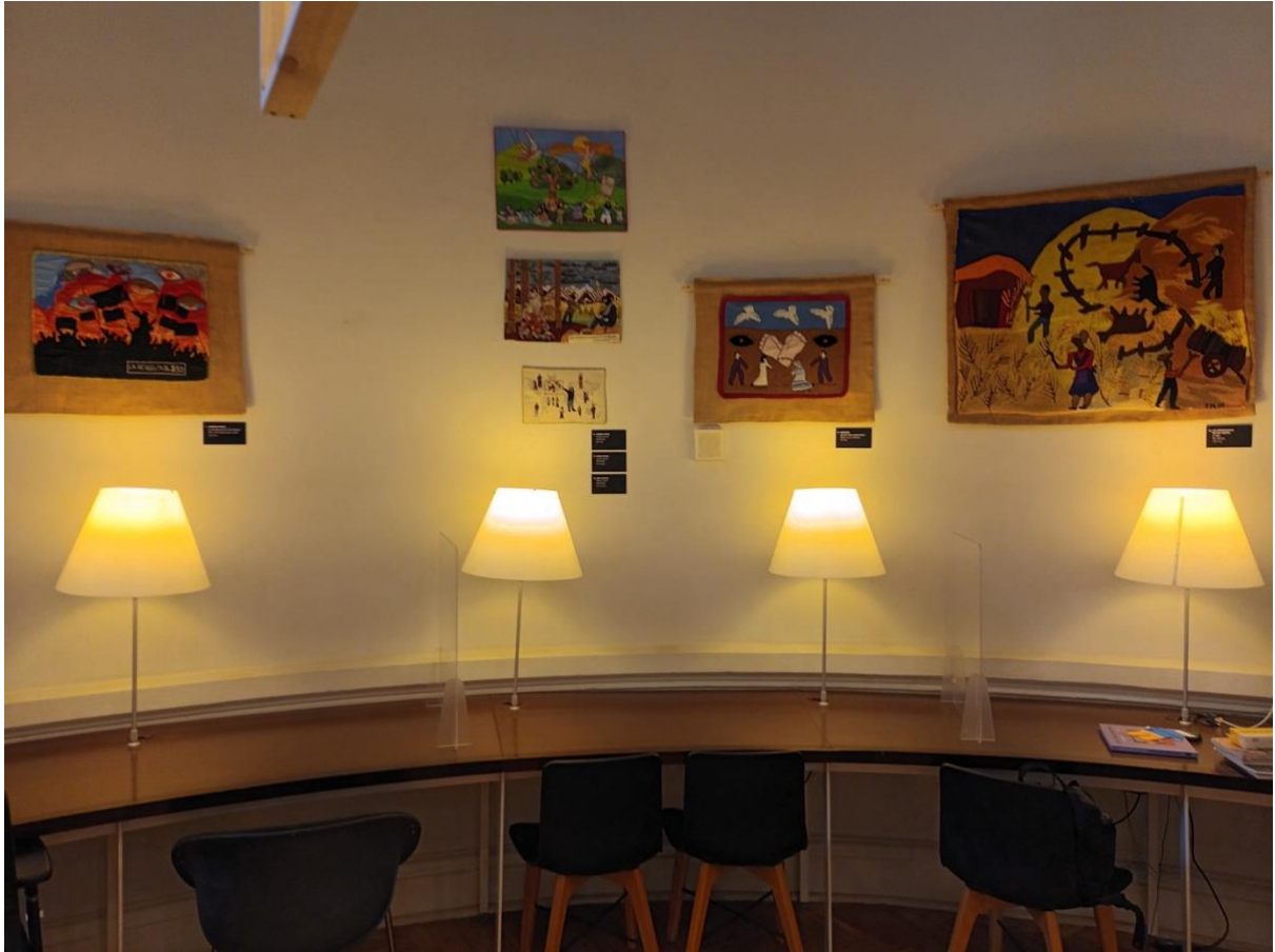
A closer view of the collection of arpilleras on the walls.