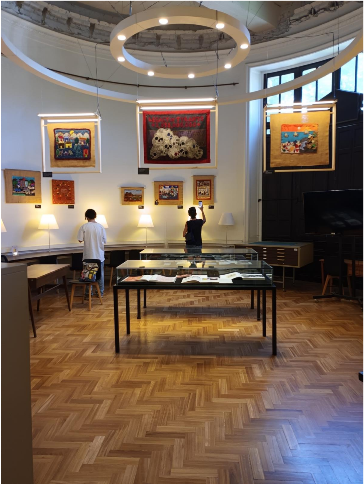
Visitors at the exhibit.