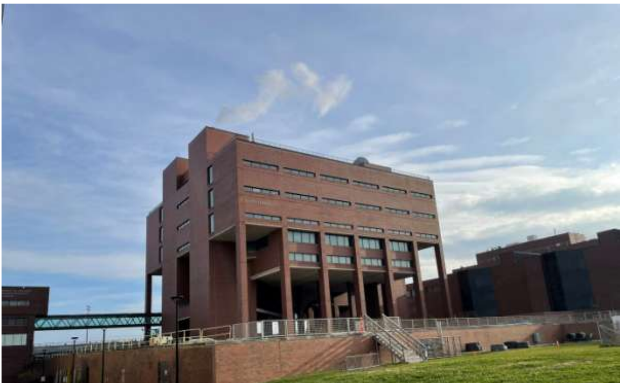
Arriving at the University of Massachusetts, Boston on 14 th November 2023, for exhibition set up.