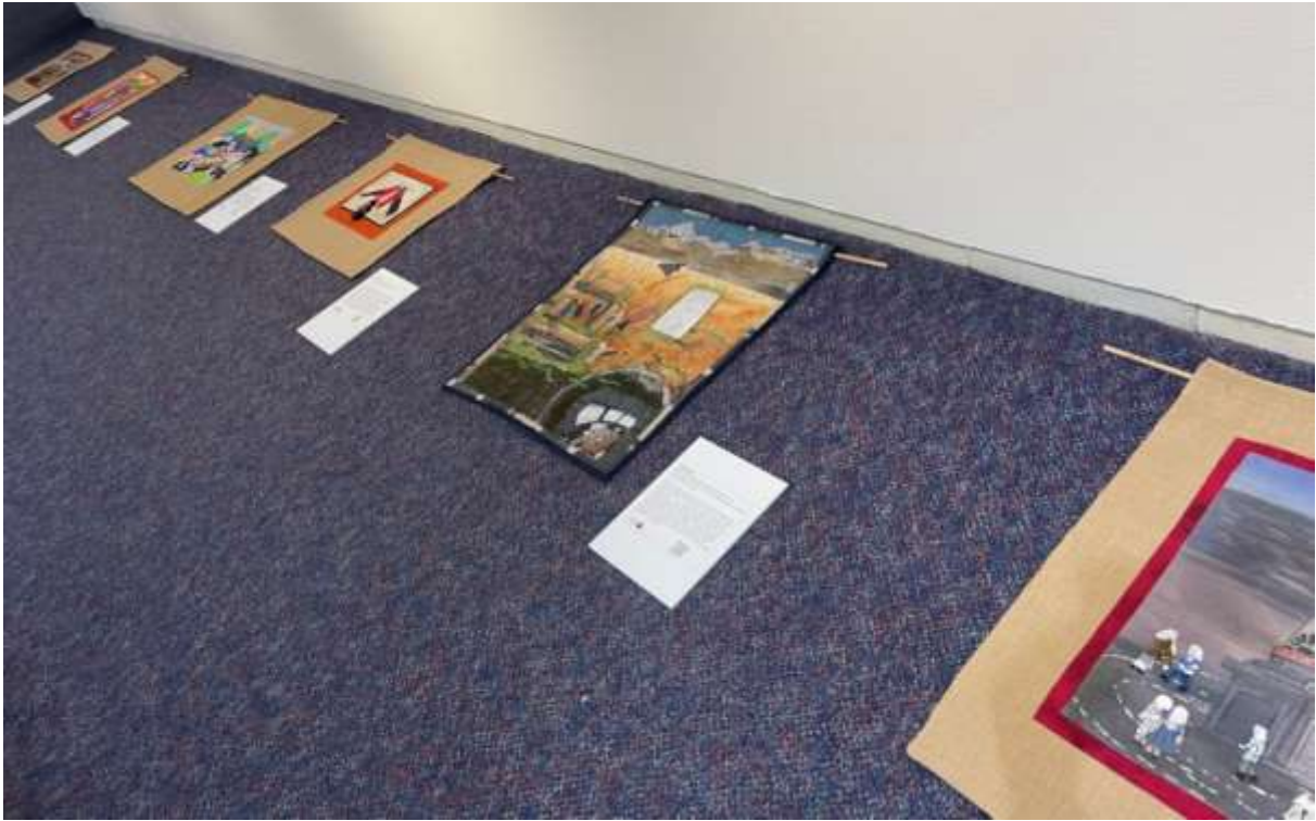
Textiles placed flat after unpacking; ready for hanging.