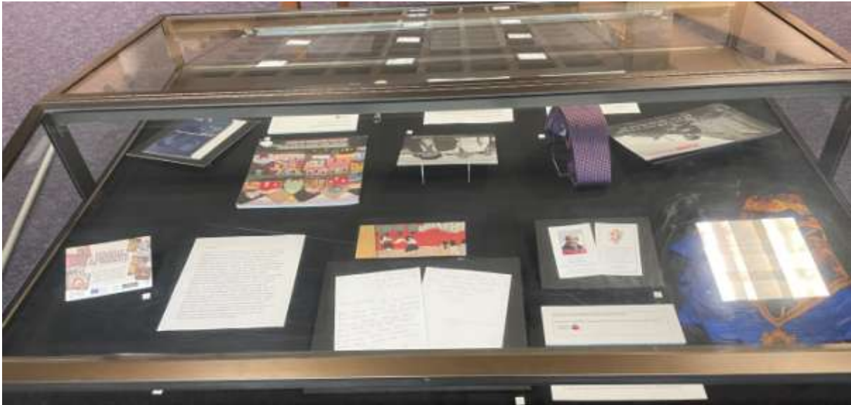
Personal memorabilia of John and Pat Hume, donated to Conflict Textiles collection by the Hume family (2021). Conflict Textiles material is also included in this display.