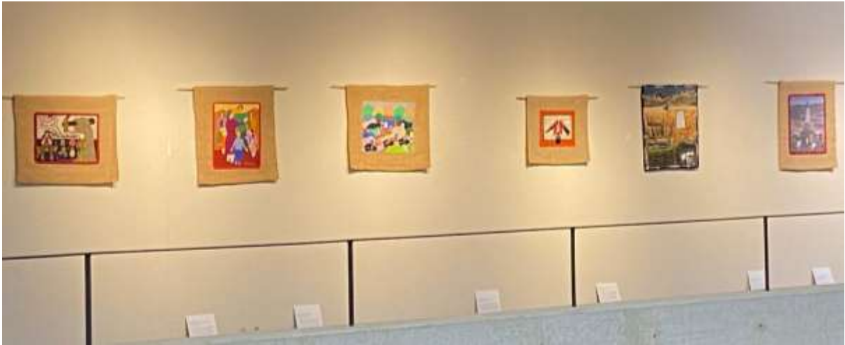
Textiles are hanging and labels are about to be attached to the wall.