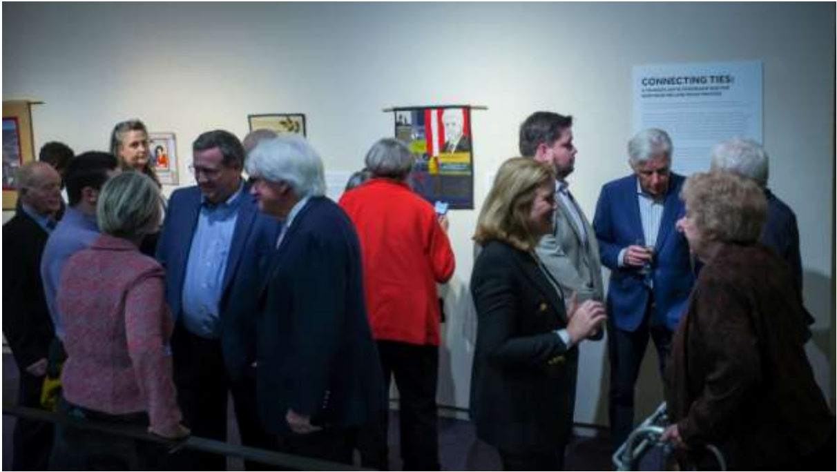
Conversations taking place, new connections developed, existing connections rekindled, against the backdrop of “Connecting Ties” exhibition.