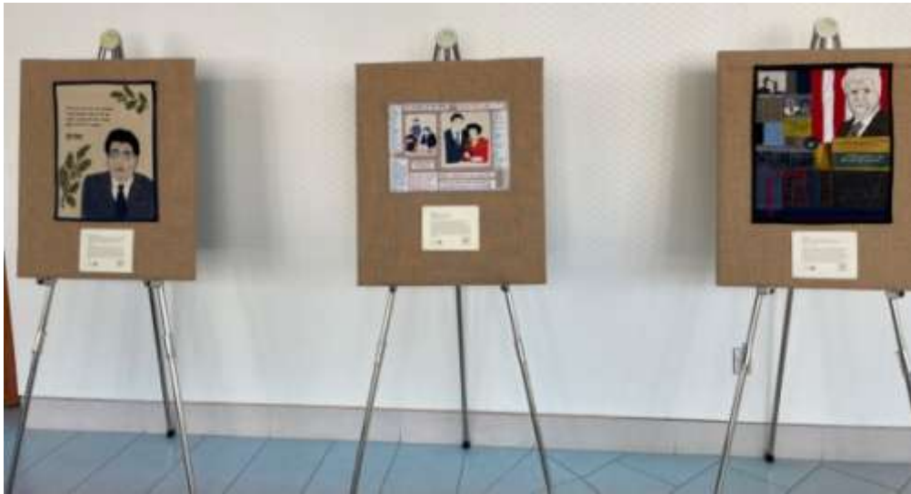
Textiles John Hume, Peacemaker and Pat Hume on display beside Tip O'Neill .