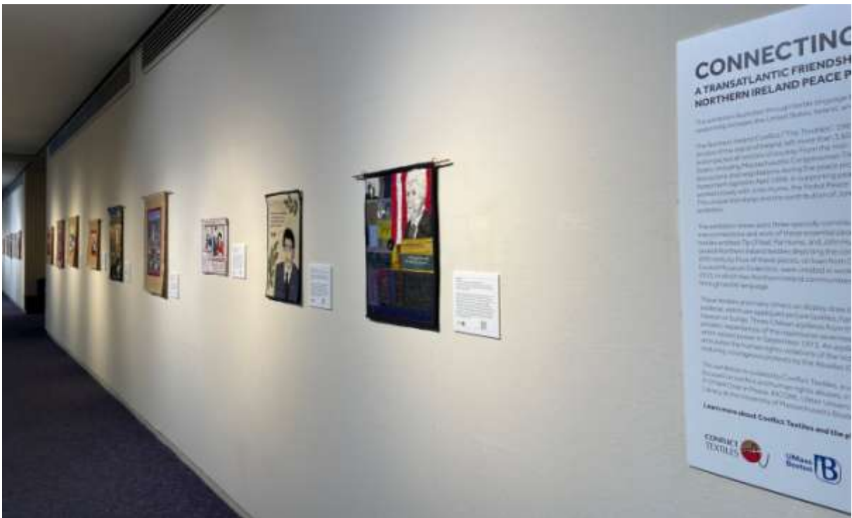
Installation of textiles is completed.