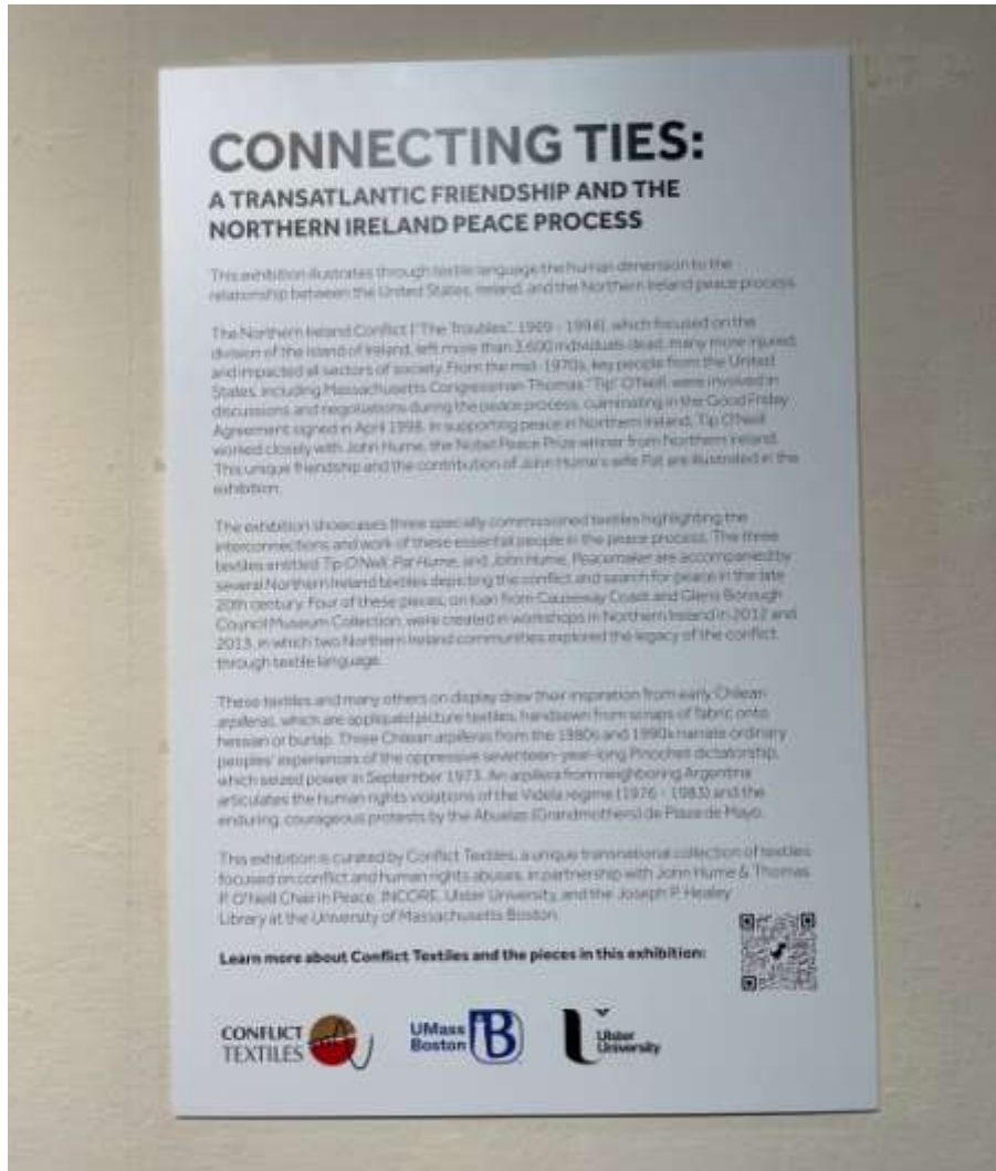
Exhibition introduction panel.