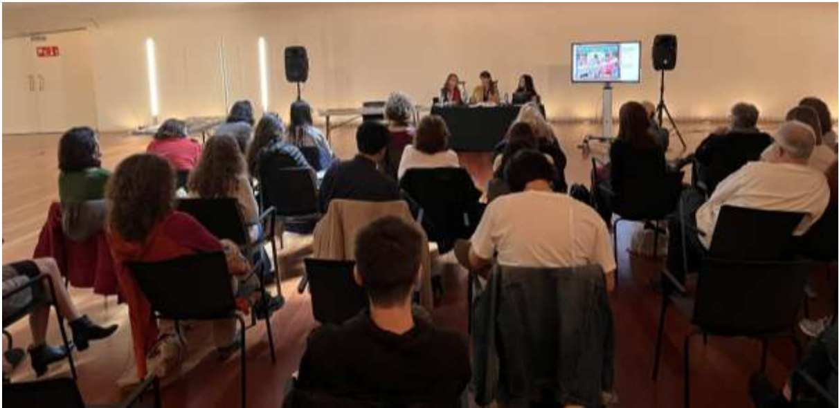
Attendees focused on conference proceedings.