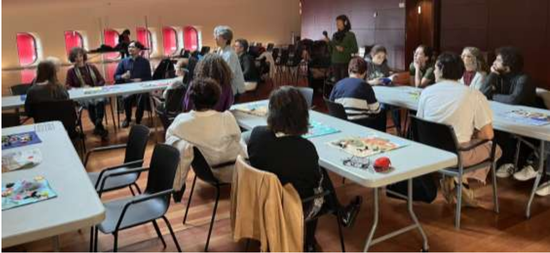
Getting ready to begin the workshop element.