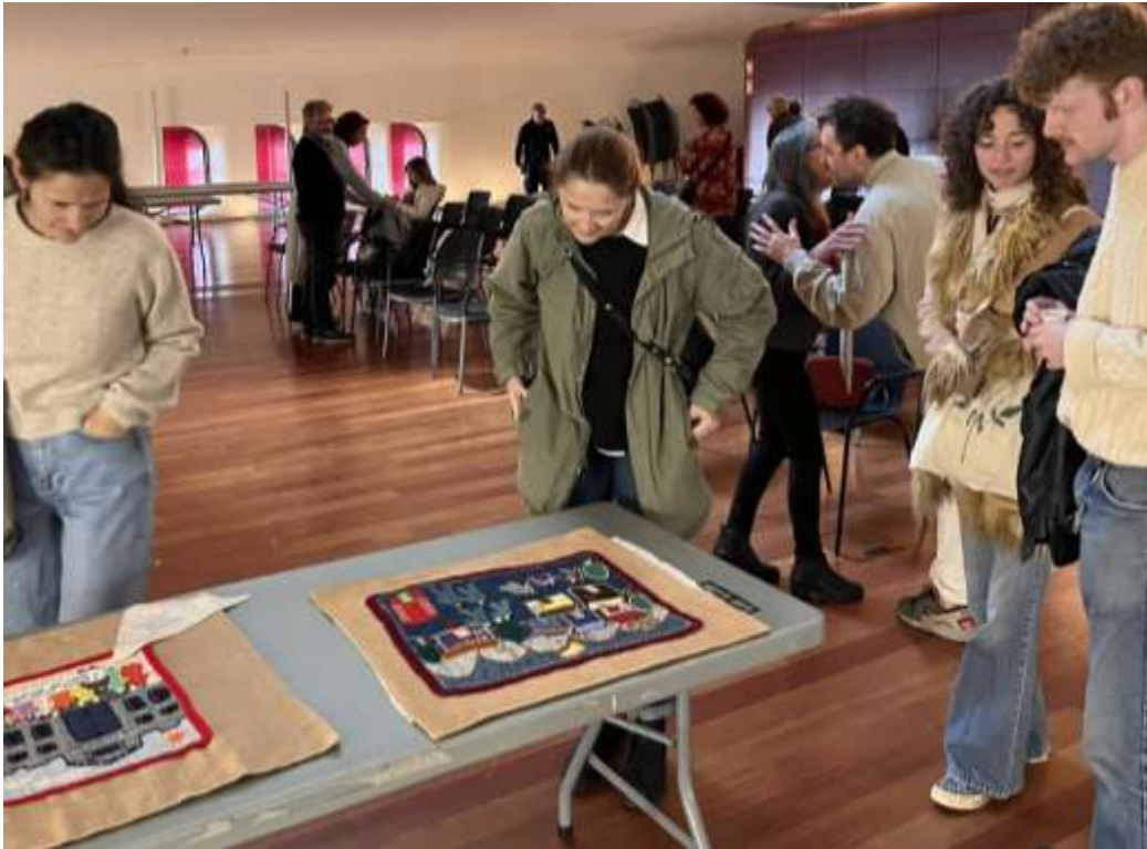
Viewing arpilleras from Conflict Textiles collection. These were displayed as part of the public event to give people an opportunity to experience arpilleras first hand.