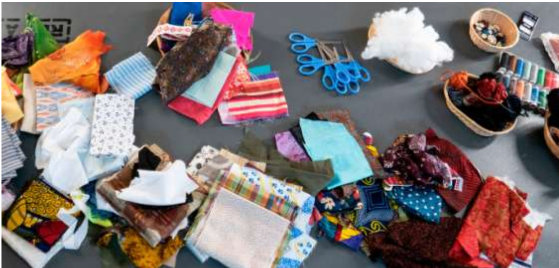
Materials laid out in preparation for the workshop.