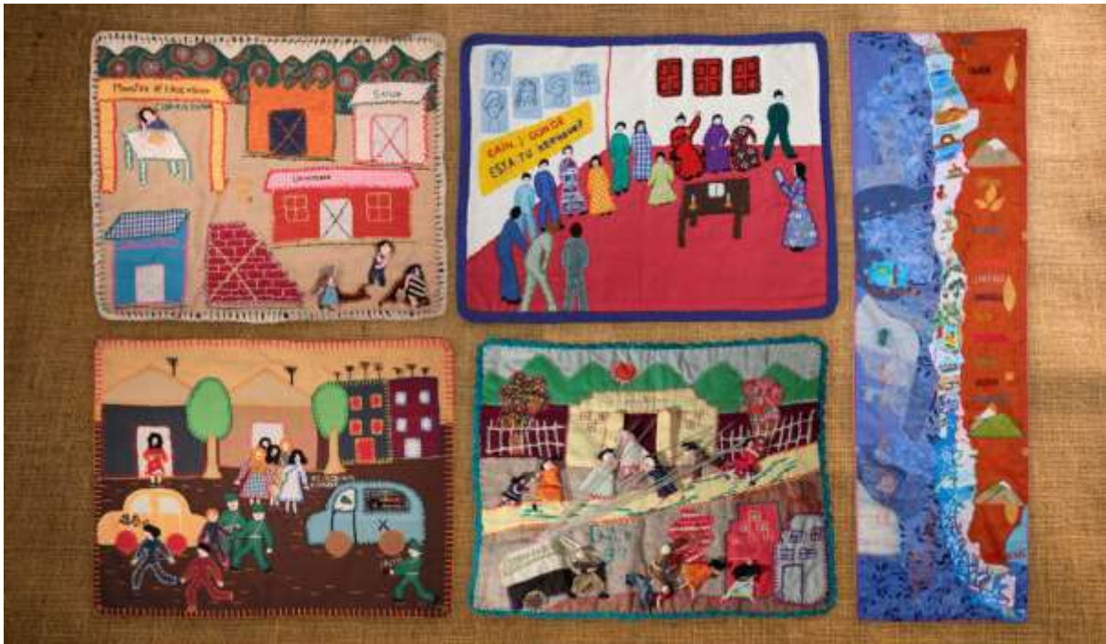
A collage of five arpilleras from the Conflict Textiles collection, acquired by the Museo Nacional Centro de Arte Reina Sofía collection. (Design and Photo: Roser Corbera)