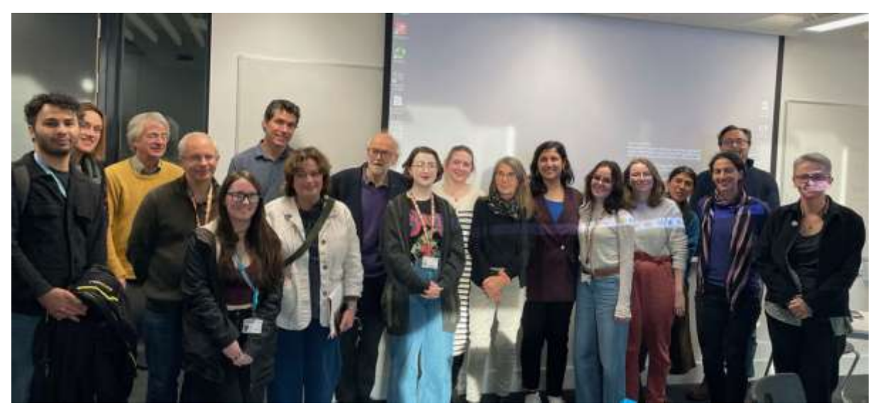
Attendees, contributors and organisers pictured at the close of the seminar.