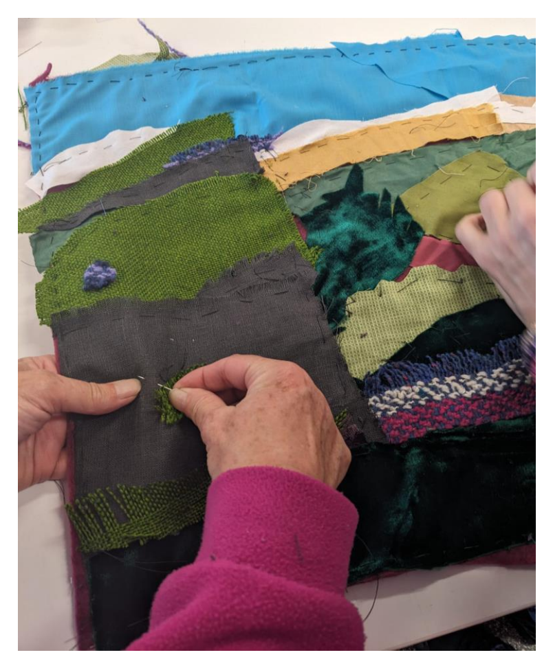
A closer look at the textures and colours of Binevenagh Mountain.