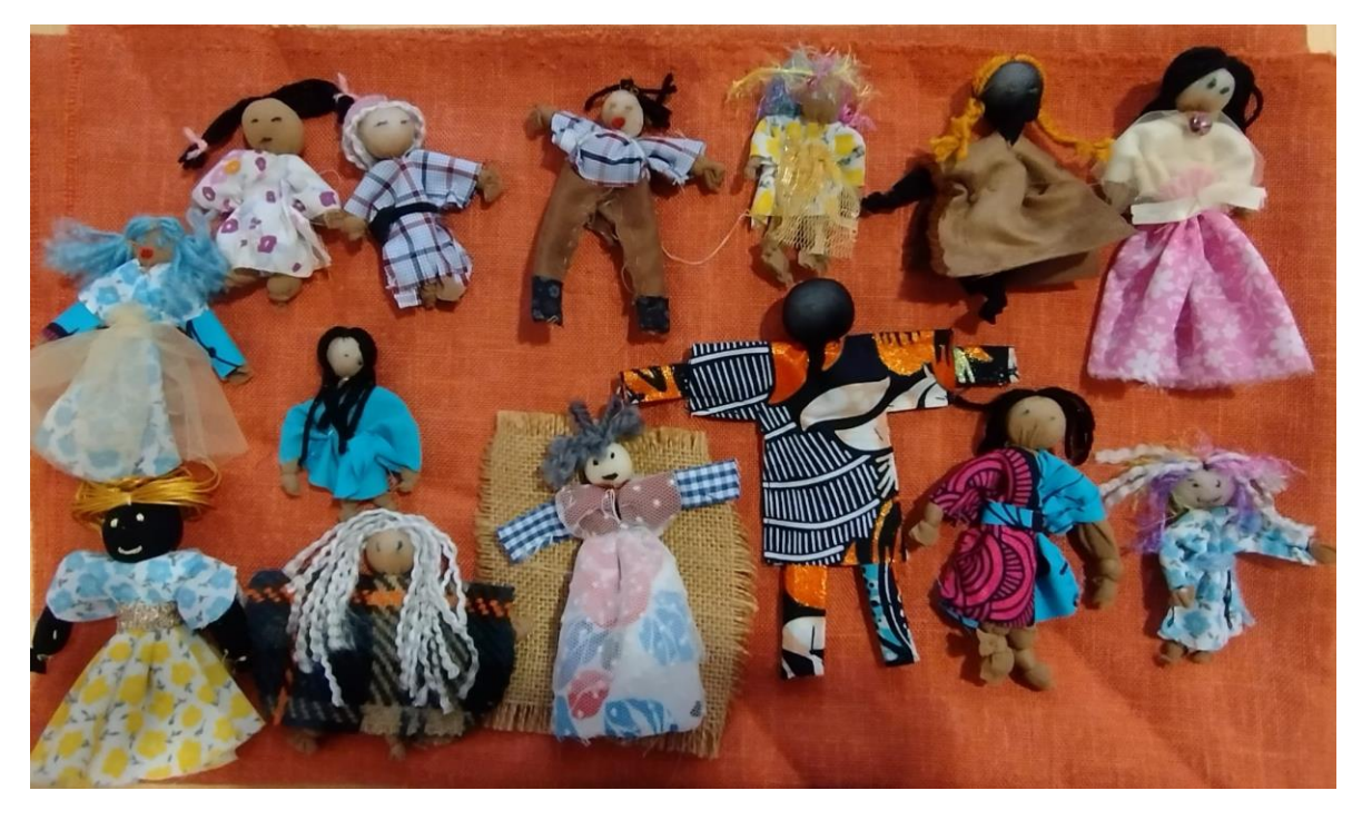
A selection of the dolls made by the participants.