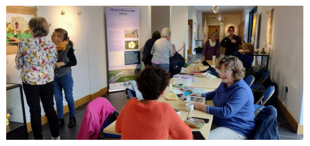
Conversations about textiles, sewing and the environment.

The finished pieces will be sewn together to create one larger textile that will be displayed in the Roe Valley Arts and Cultural Centre in early 2024.