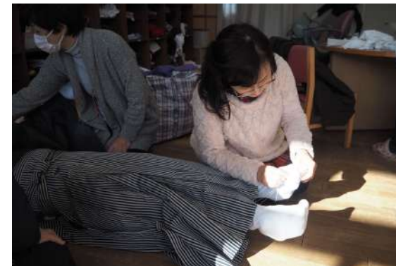
Life-Sized Doll Making in Naraha