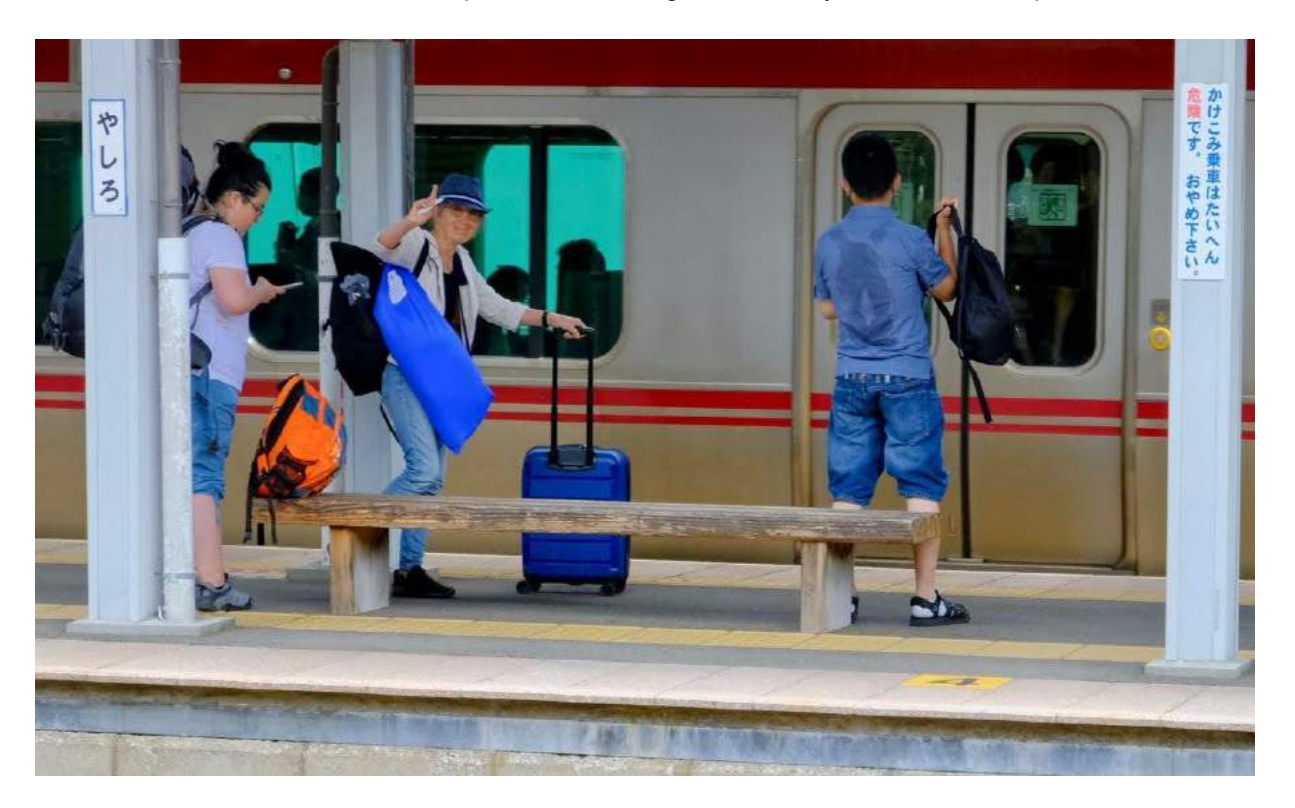
On the way back to Tokyo (Sep 12th) by local and bullet train