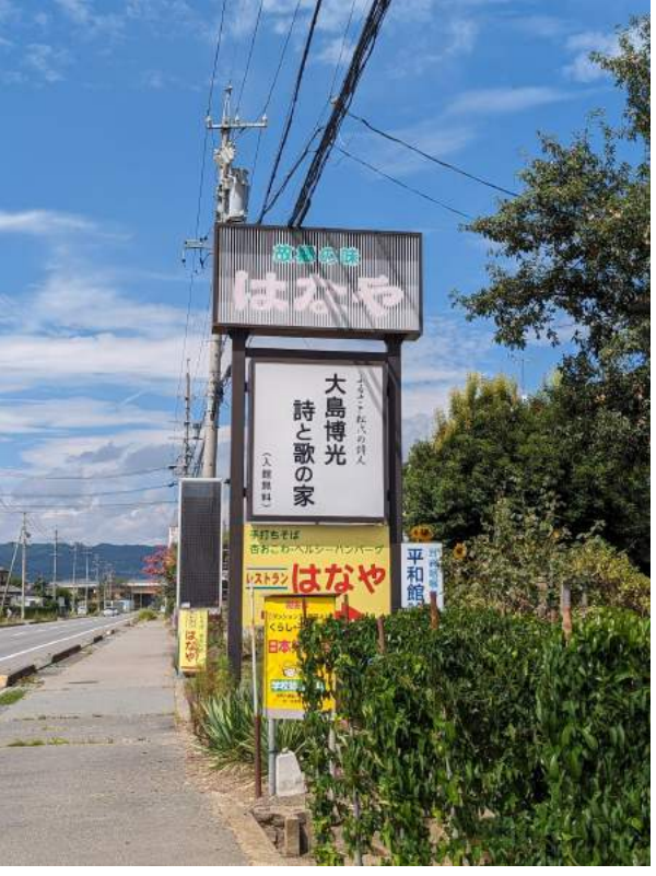
After symposium dinner and toasts by everyone Entrance sign to Oshima Hakko Museum involved