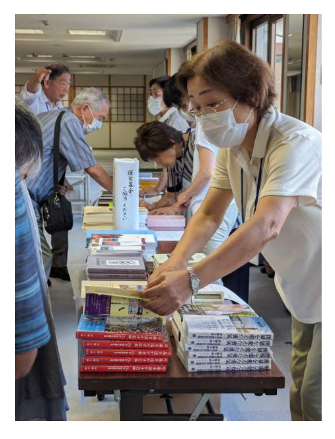
Sign up desk and books for sale outside the seminar