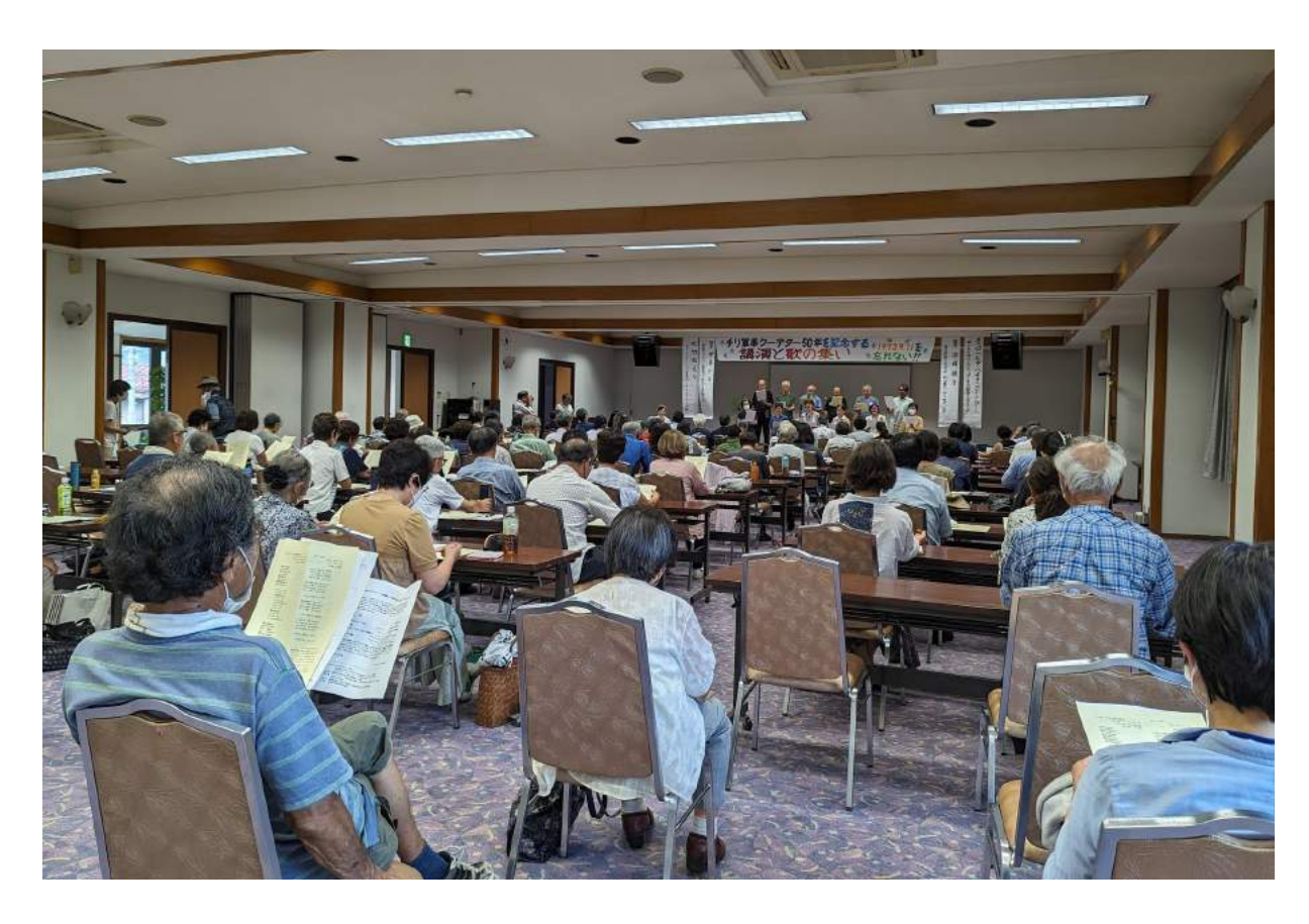
A view of the entire audience in the Sun-Hall Matsushiro, Nagano