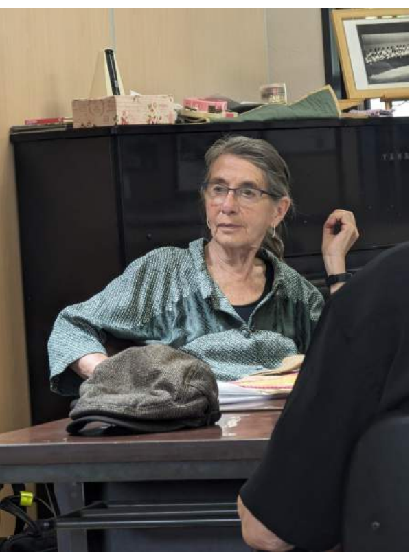
A view of people at the round table in the museum Roberta paying attention to one of the speakers