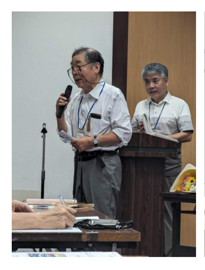
Museum) giving the opening remarks