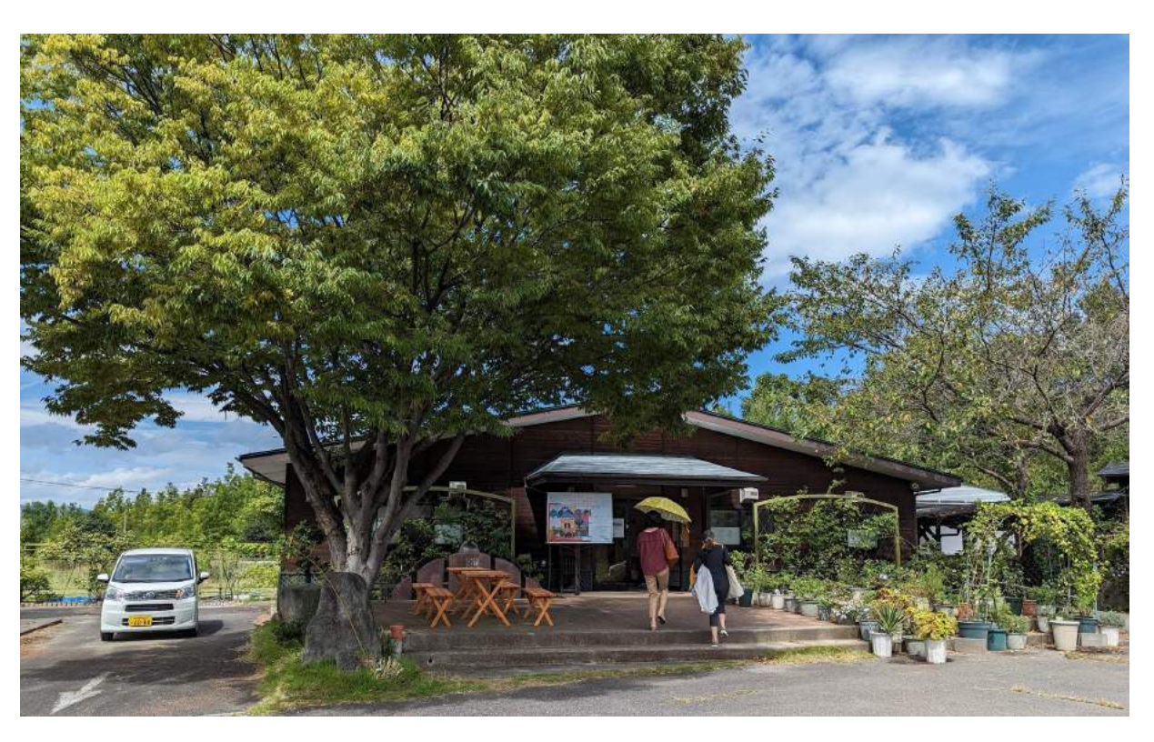
Entering the Oshima Hakko Museum