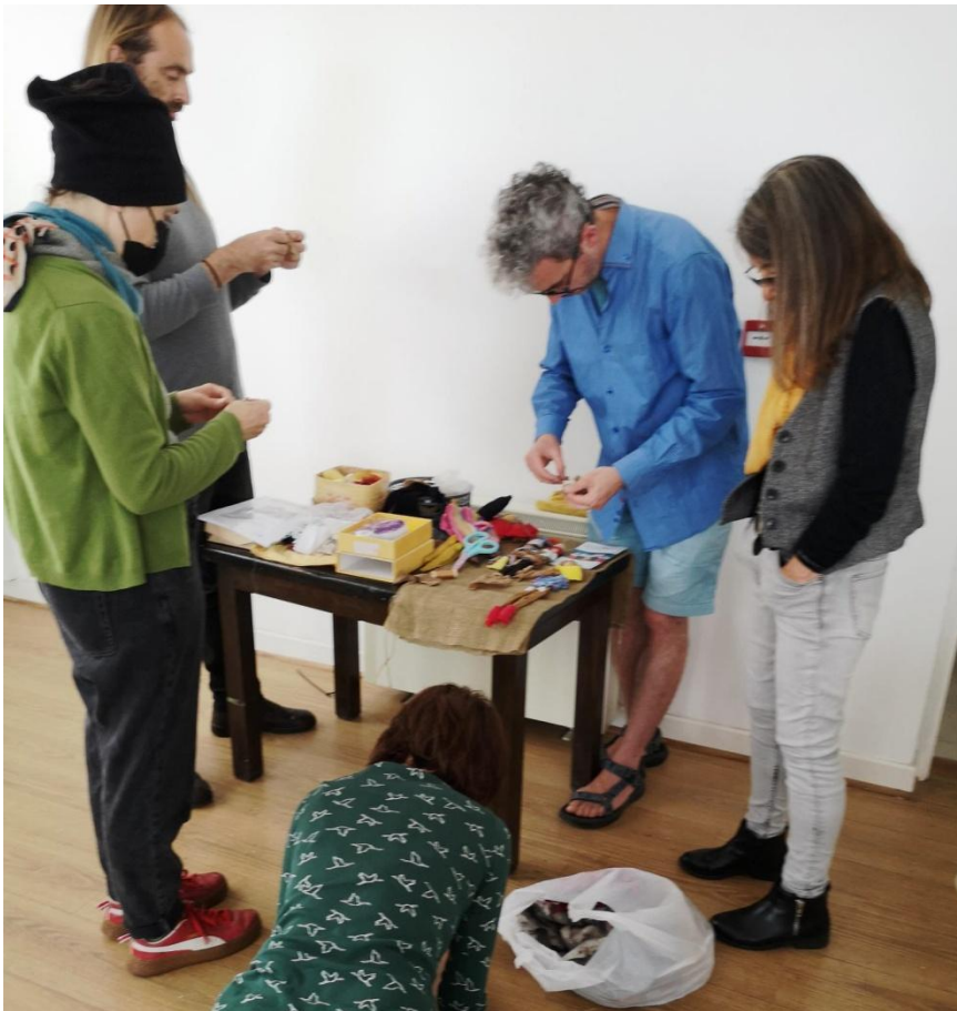
Choosing materials for the arpillera dolls.