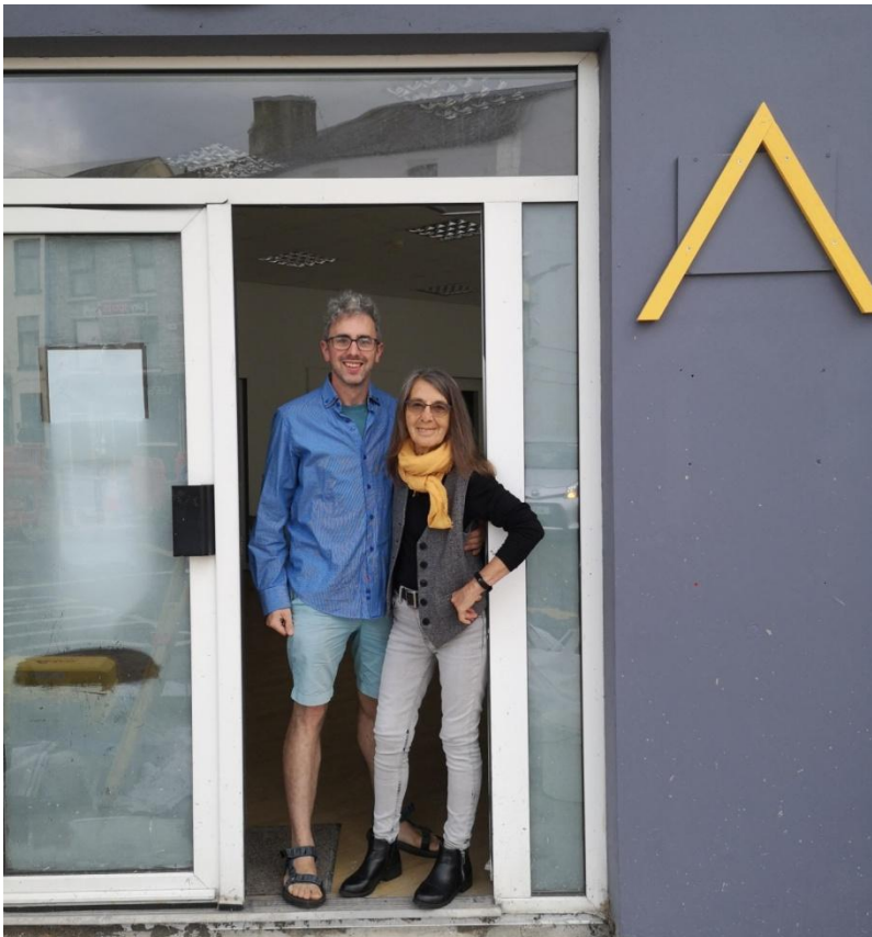
At the entrance to the ^ artist collective on the morning of the workshop.