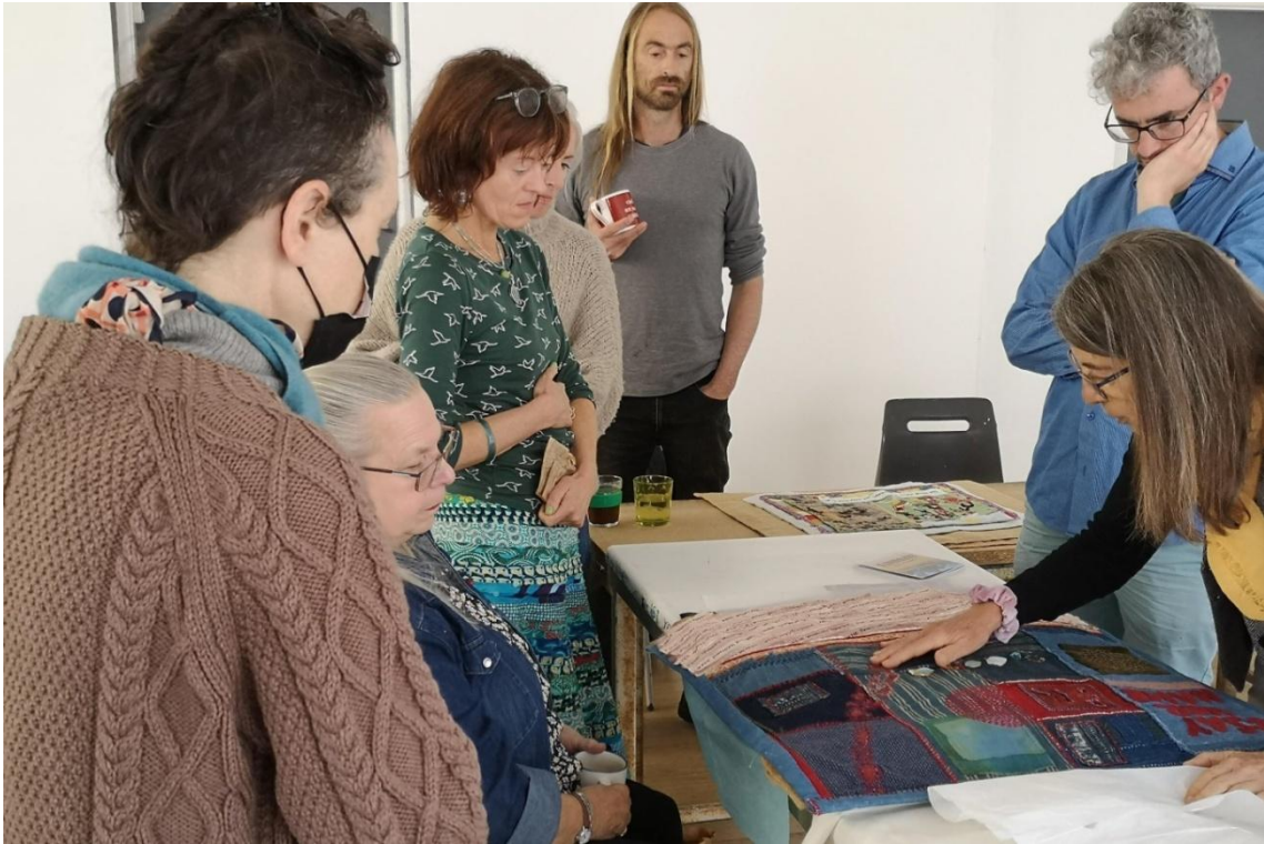
Getting a sense of the layers of meaning within the arpilleras.