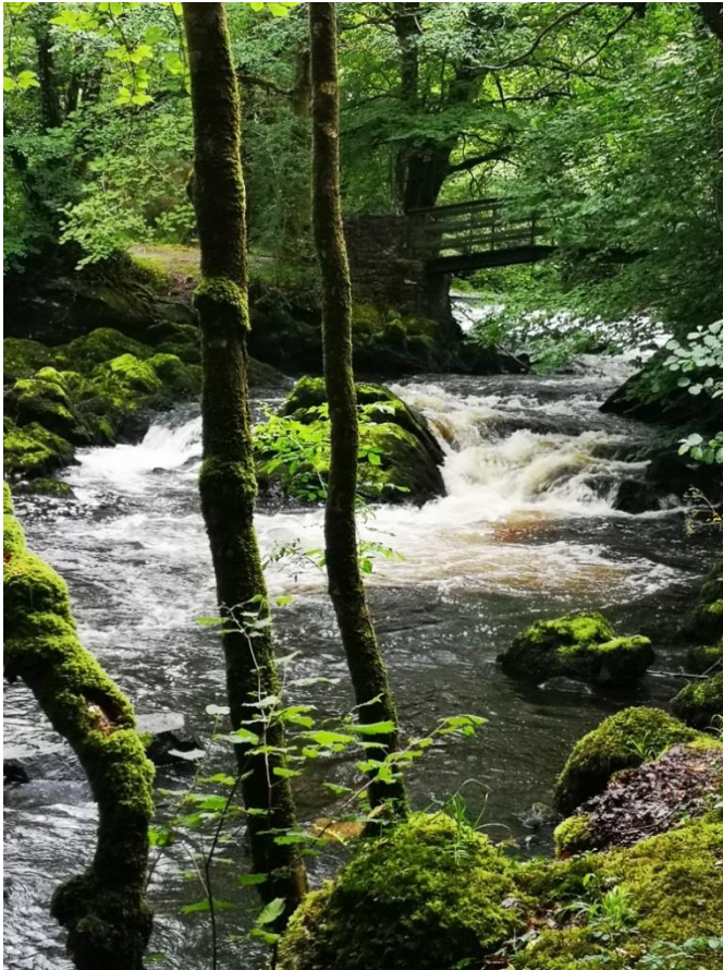
Finding inspiration from walking the land on the evening of arrival.