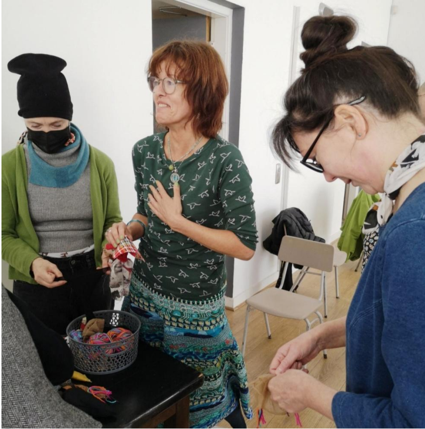
Engaged in the process with fabric in hand.