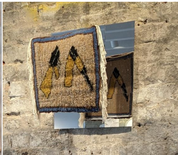
A rug created by Ghafar, inspired by Broken Rifle 2 .