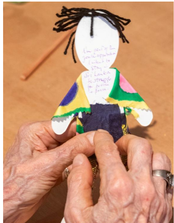
A message on the back of this character.