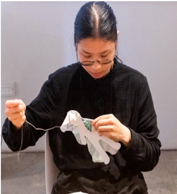
Absorbed in the sewing process