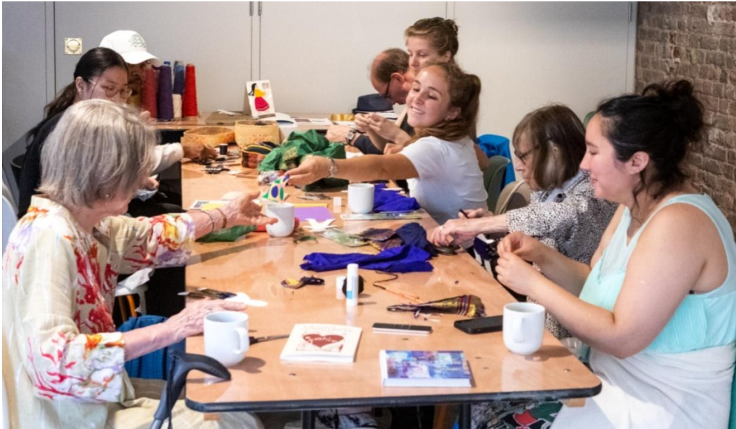
Sharing materials, cutting, shaping and creating.