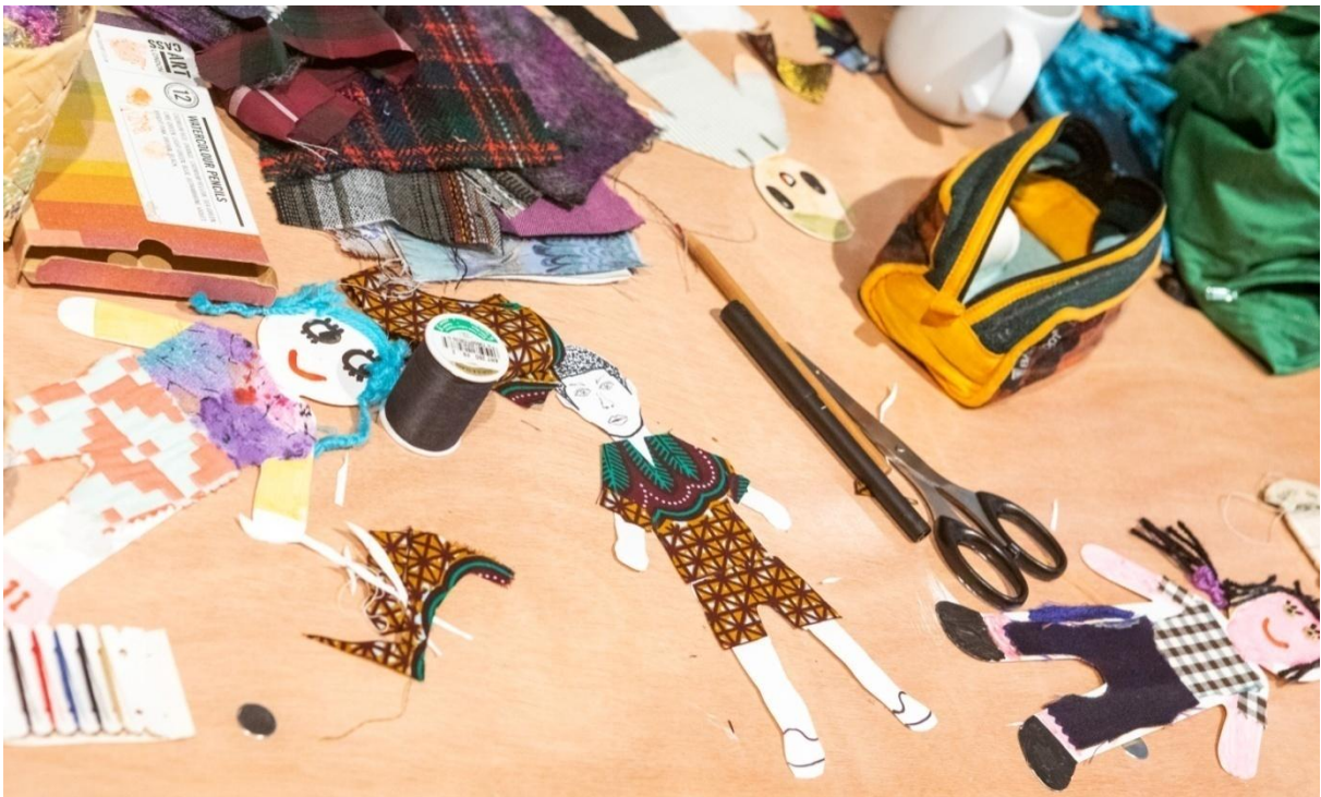
Characters taking shape, surrounded by an array of materials.