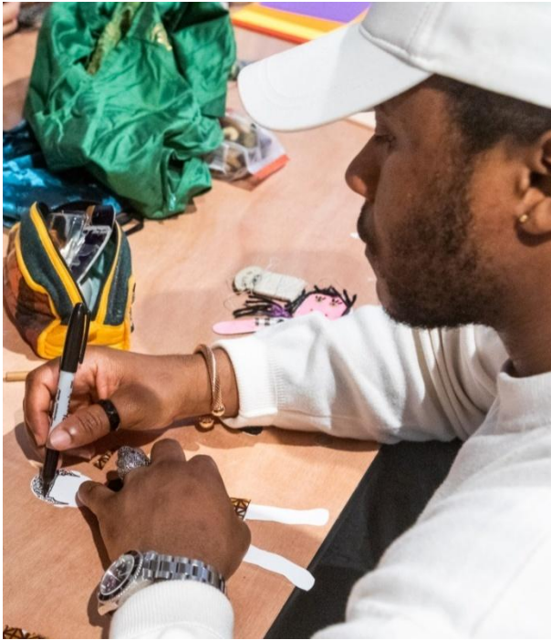
Giving his character some facial features