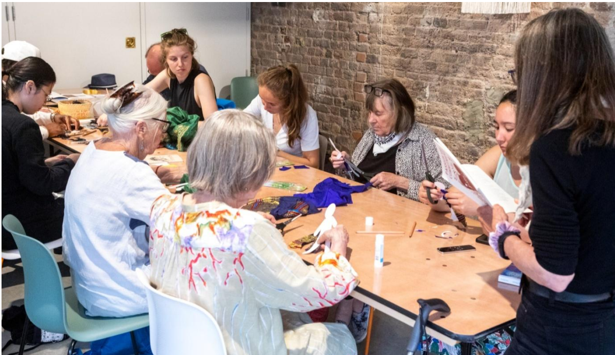
Participants applying themselves to the workshop brief.