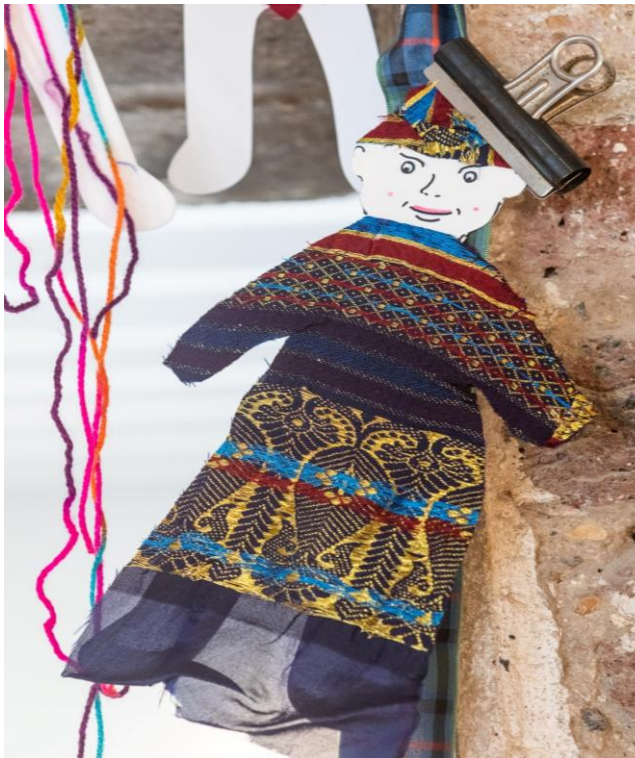
A close up of some of the characters created