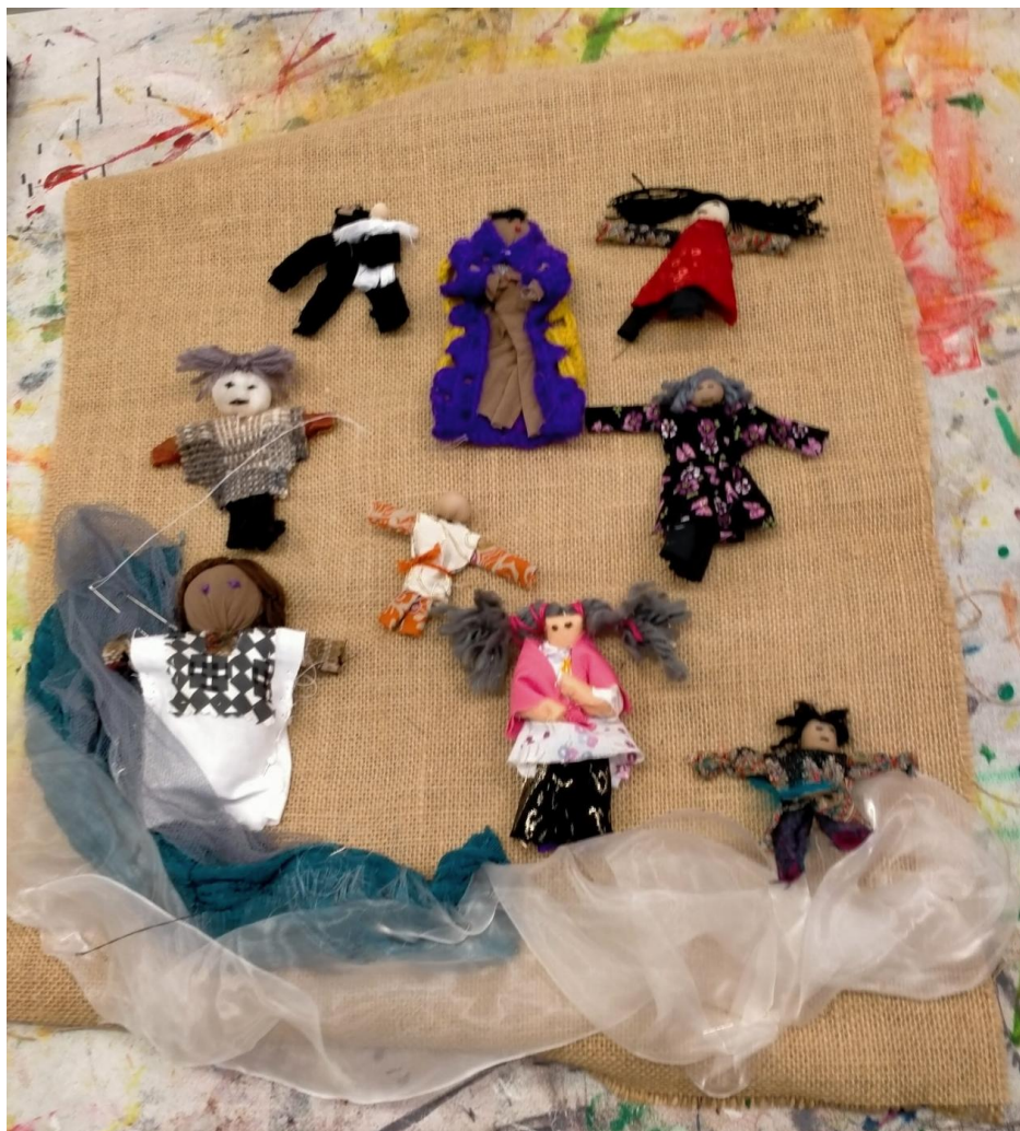
The finished collective piece.