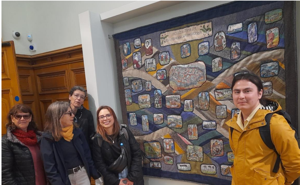
The Plantation: Process, People, Perspectives , by Deborah Stockdale, on display at the Guild Hall, Derry.