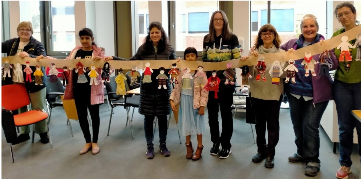
Workshop participants presenting the workshop outcome from the event International Human Rights Day 2022: Embracing Human Rights held on 9 th December 2022, Ulster Museum.