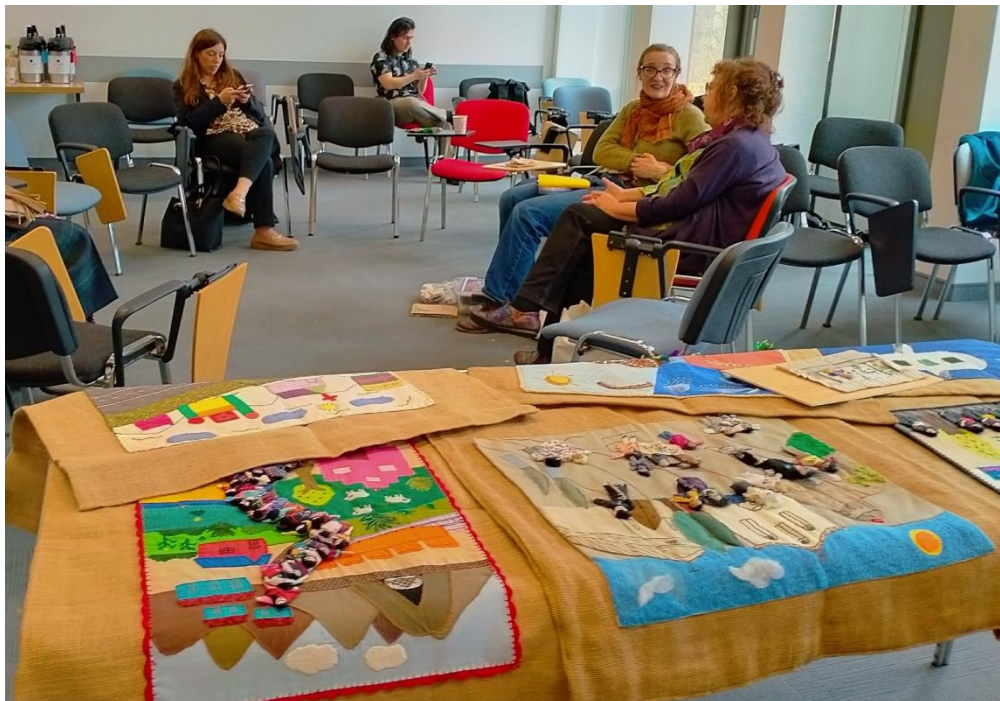
A selection of textiles on display as part of the workshop.