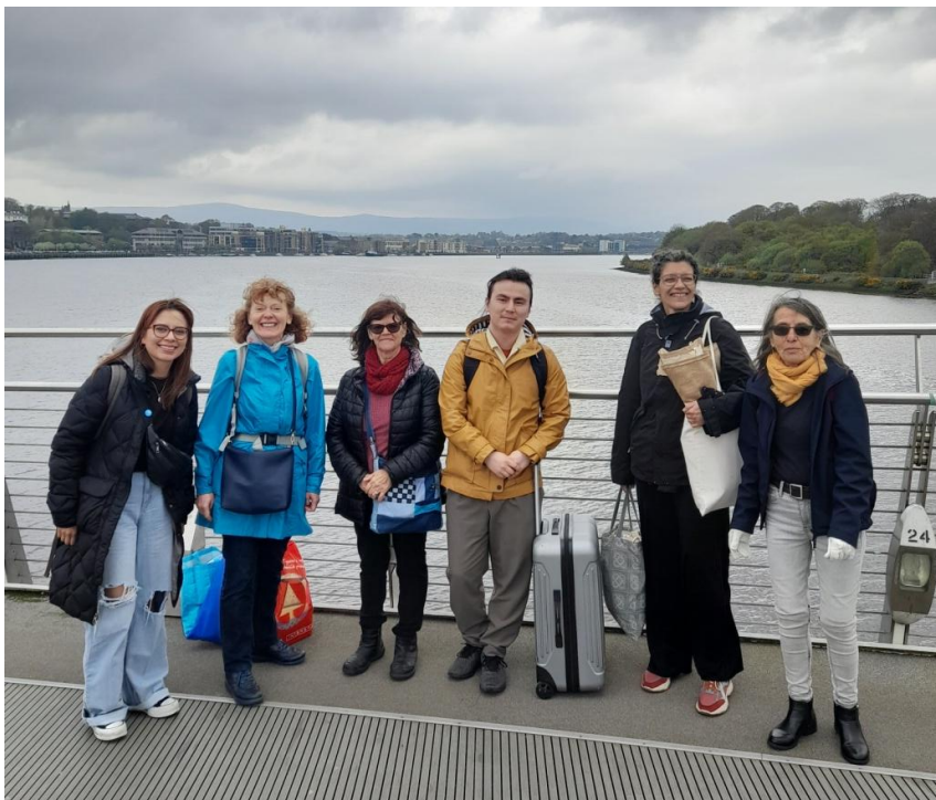
Conflict Textiles and Fundació Ateneu Sant Roc team members with some workshop participants on the Peace Bridge in Derry, making their way to the Void Gallery, having come from the train station.