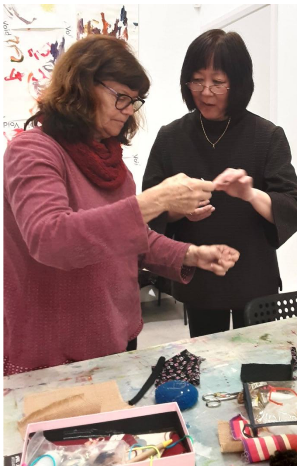
...and giving one-to-one assistance.