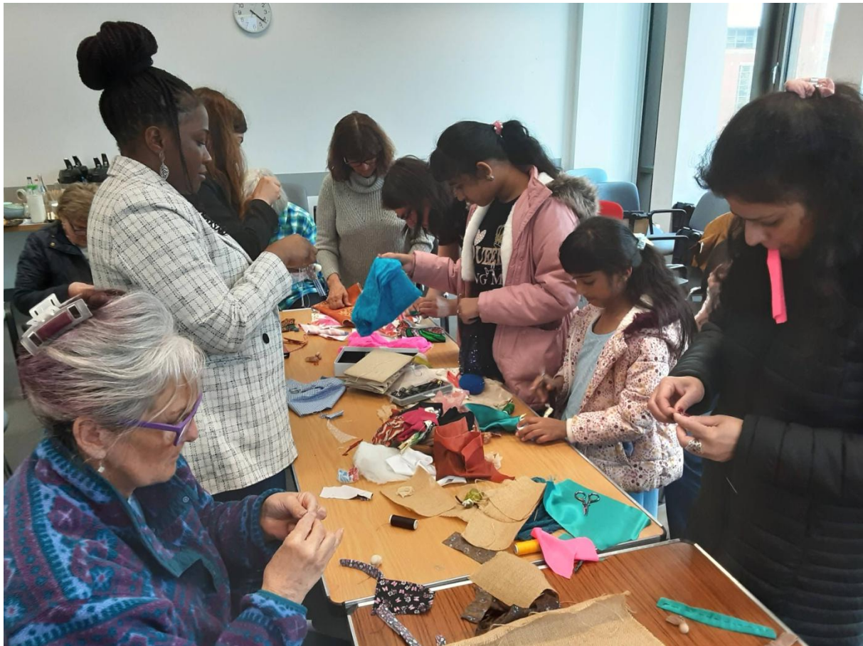
Engrossed in the 'hands on' element.