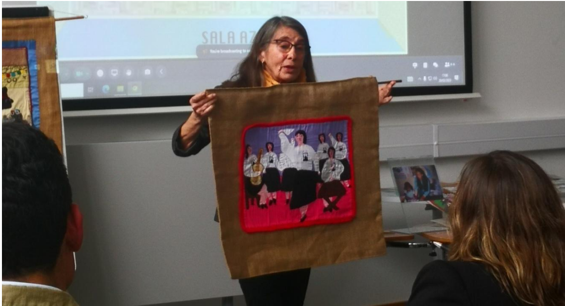
Giving an insight into the arpillera La cueca sola / Dancing cueca alone , (1989, by Violeta Morales).