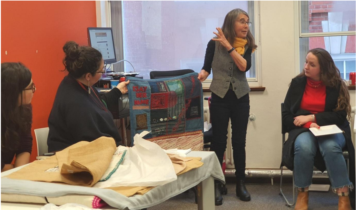
Discussing the arpillera/storycloth #SayHerName .