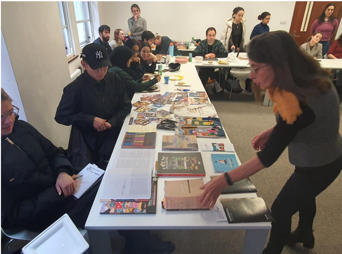
Conflict Textiles materials & publications on display as part of the workshop.