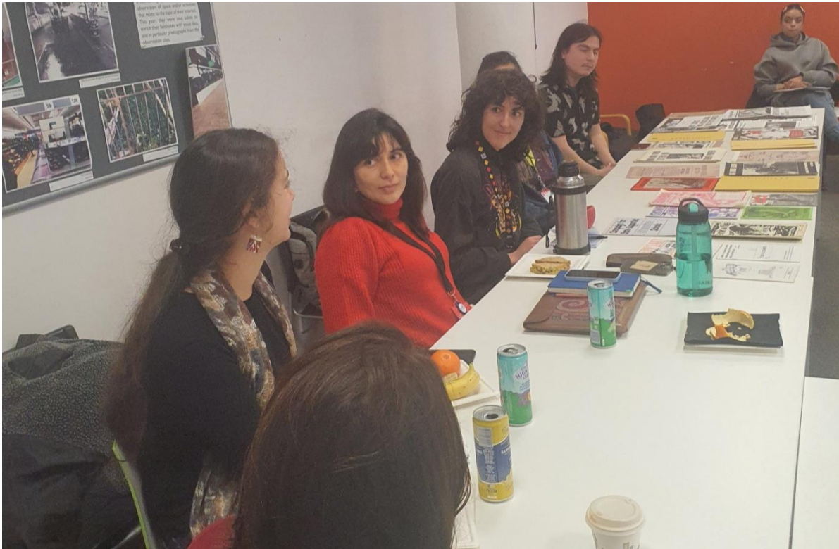
Engaging in the discussion.