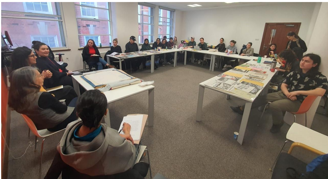
Attendees listening intently to the workshop introduction.

Both speakers focused on working with archives more creatively and what the process itself looks like. Roberta explained in-depth how Conflict Textiles - a live, evolving archive - has approached the archiving process. This was complemented by discussion and a Question & Answer session, framed around a selection of textiles displayed as part of the workshop.