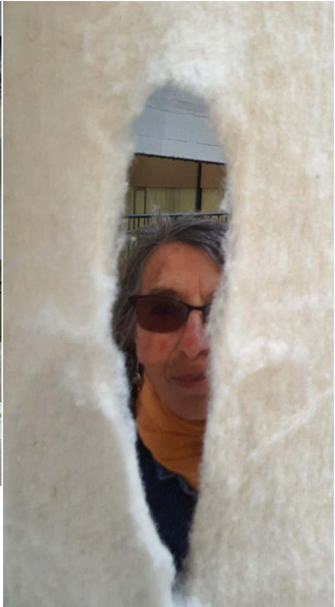
Compiled by Breege Doherty 19 th April 2023