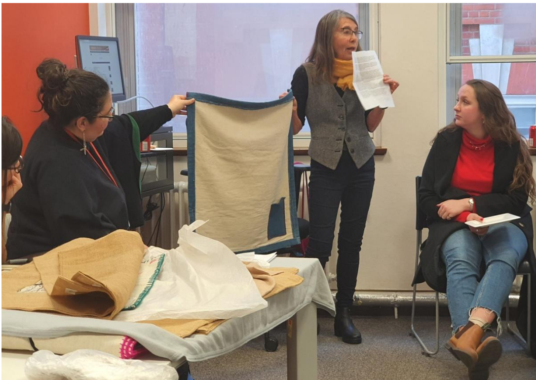
Revealing a letter from the maker, tucked in a pocket on the reverse side of #SayHerName (2021). This follows a practice common amongst the early Chilean arpilleras.