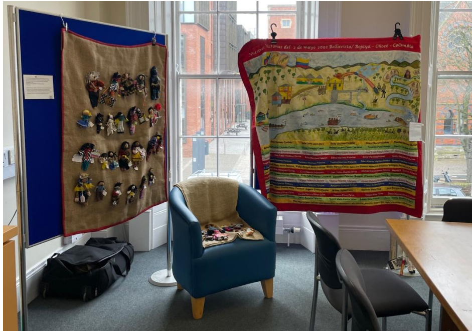
Con-textualizando la memoria / Contextualising memory outcome banner and Nuestras Víctimas 2 de mayo 2002/Our victims of 2nd May 2002; Bellavista/Bojayá/Chocó exhibited as part of the workshop.