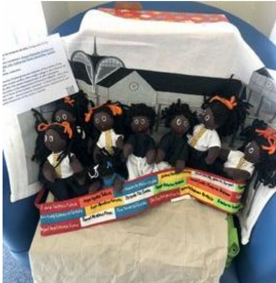
The textile installation La larga espera de las mujeres de luto / Long wait of the mourning women displayed across a chair.