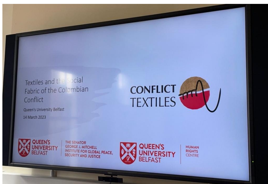
Workshop announcement.