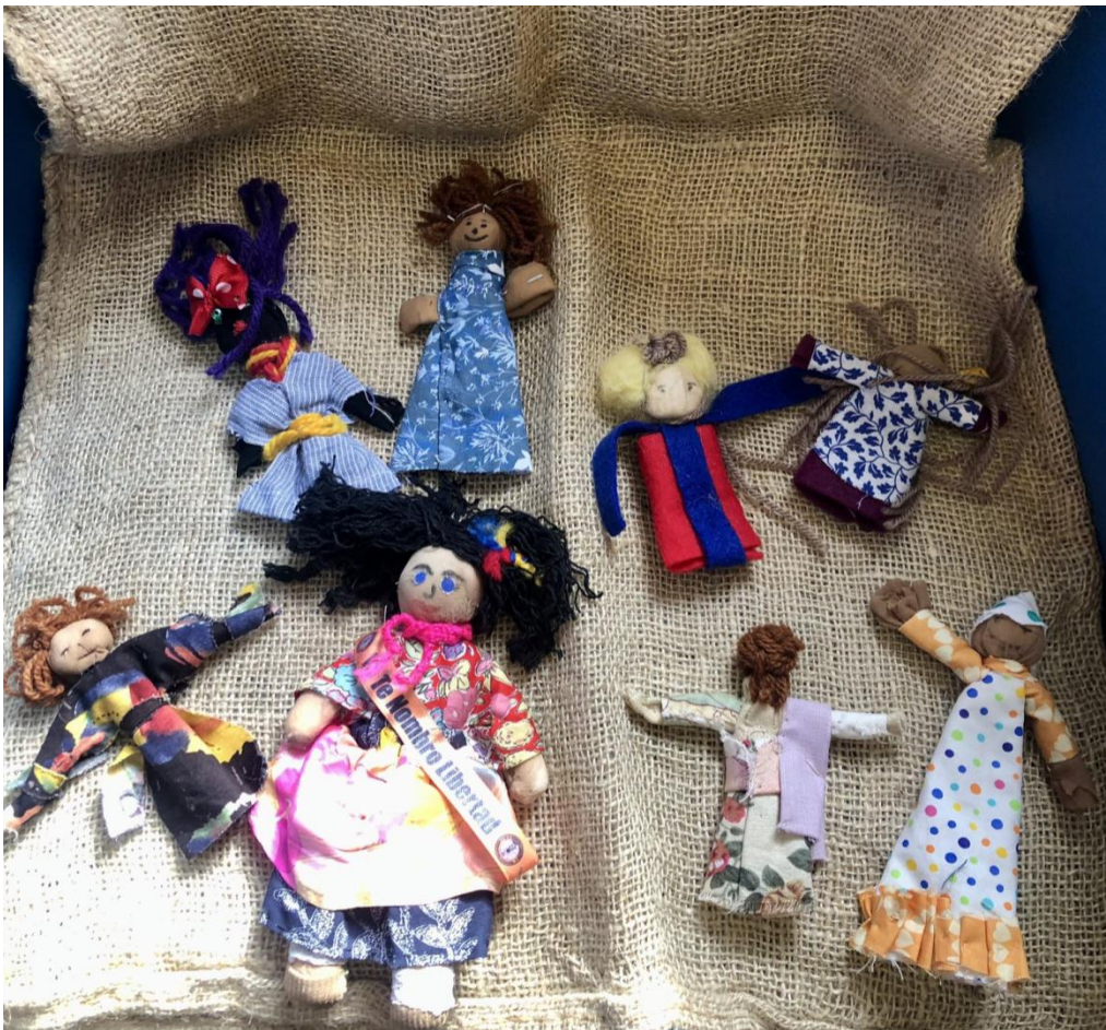
A selection of dolls created in a workshop for International Human Rights Day, 10 th December 2021 Con-textualising Memory / Con-textualizando la memoria .