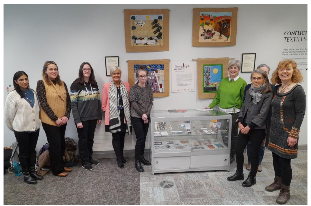
The Conflict Textiles team and colleagues from Ulster University, the Tower Museum, the Void Gallery and Ulster Museum at the opening of the 'Mujeres Disruptivas' exhibition in Magee Campus Library.