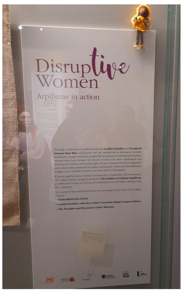
A 'Disruptive doll' occupies her space on the 'Disruptive Women' poster.