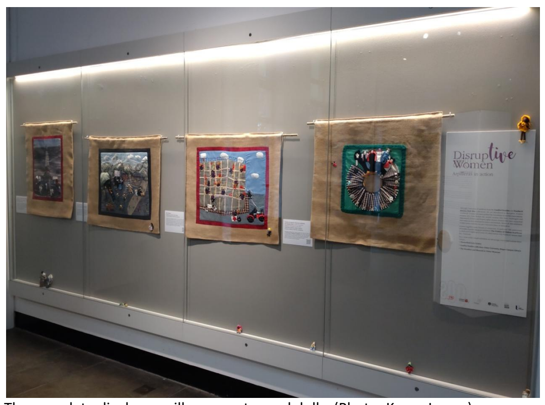
The complete display: arpilleras, poster and dolls.