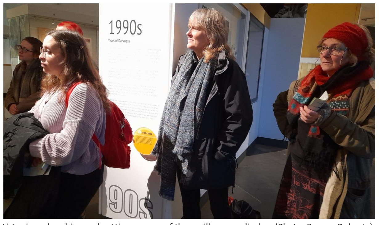
Listening, absorbing and getting a sense of the arpilleras on display.