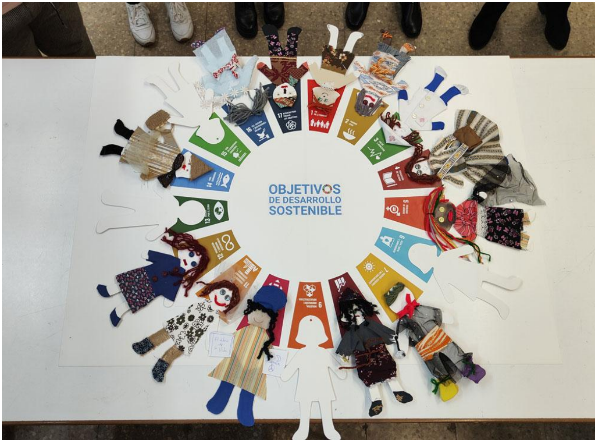
A close up of the dressed cardboard doll silhouettes placed on the SDG wheel.