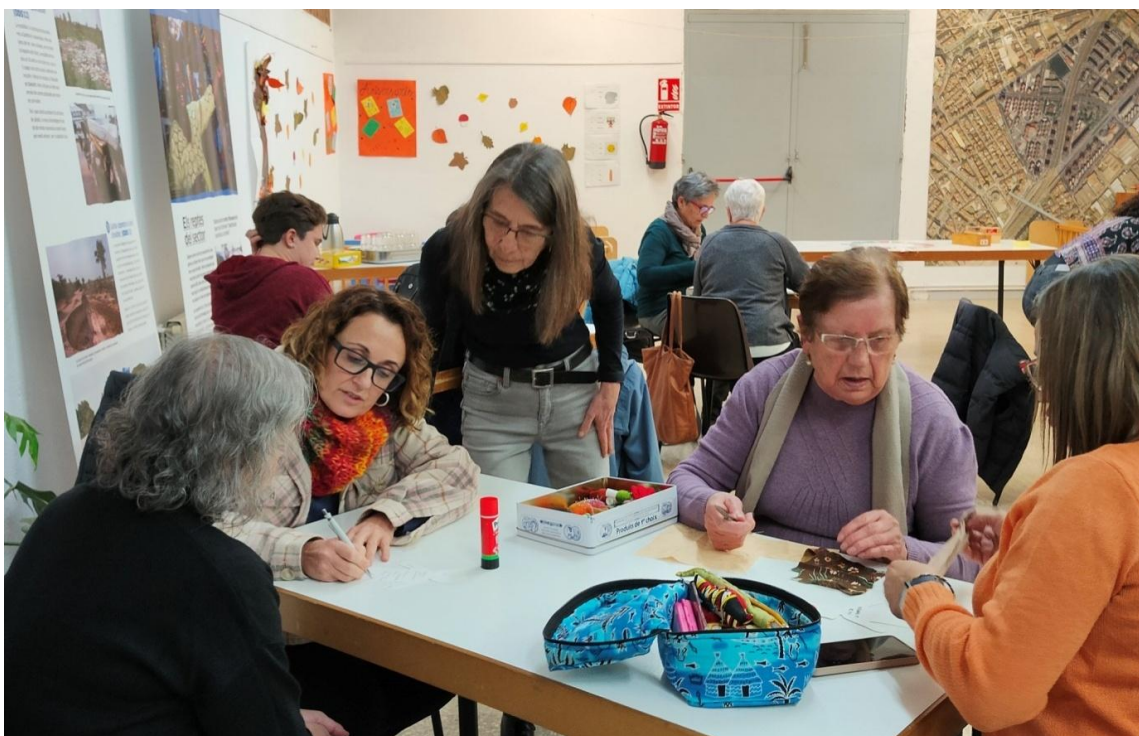
Discussing and working in pairs, with advice from Roberta when needed.