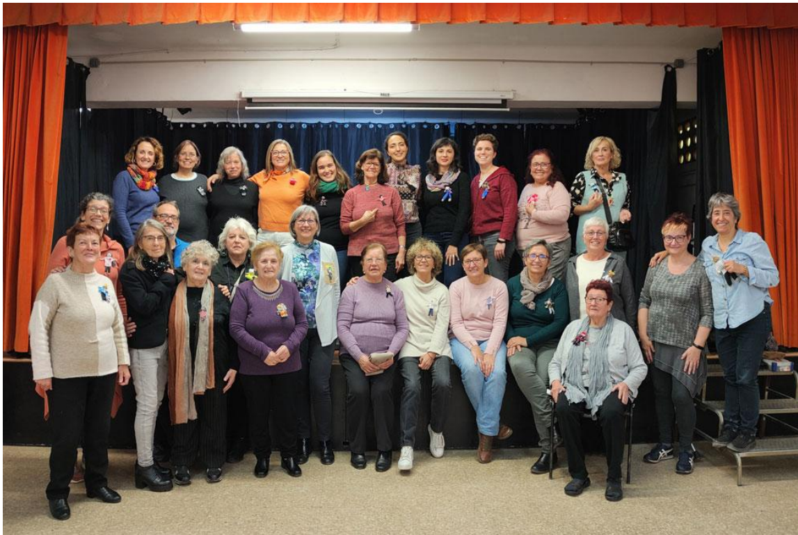
Participants gather at the end of the workshop.

Photo gallery compiled by Breege Doherty 19 th December 2022