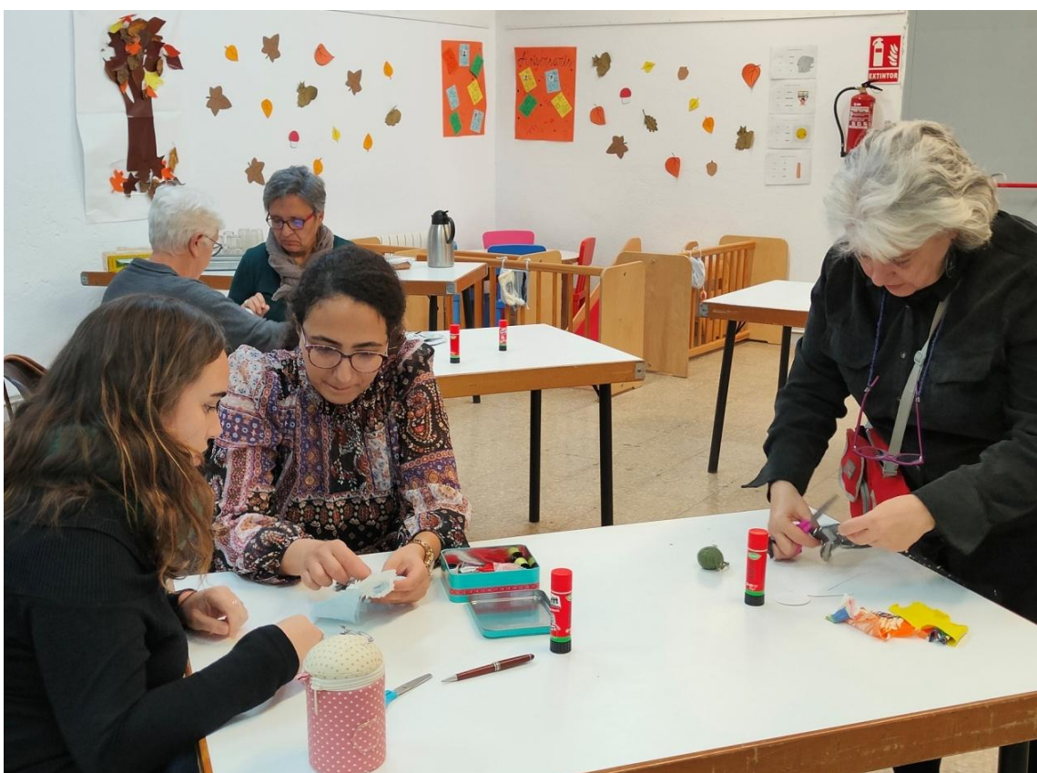
Absorbed in the process.