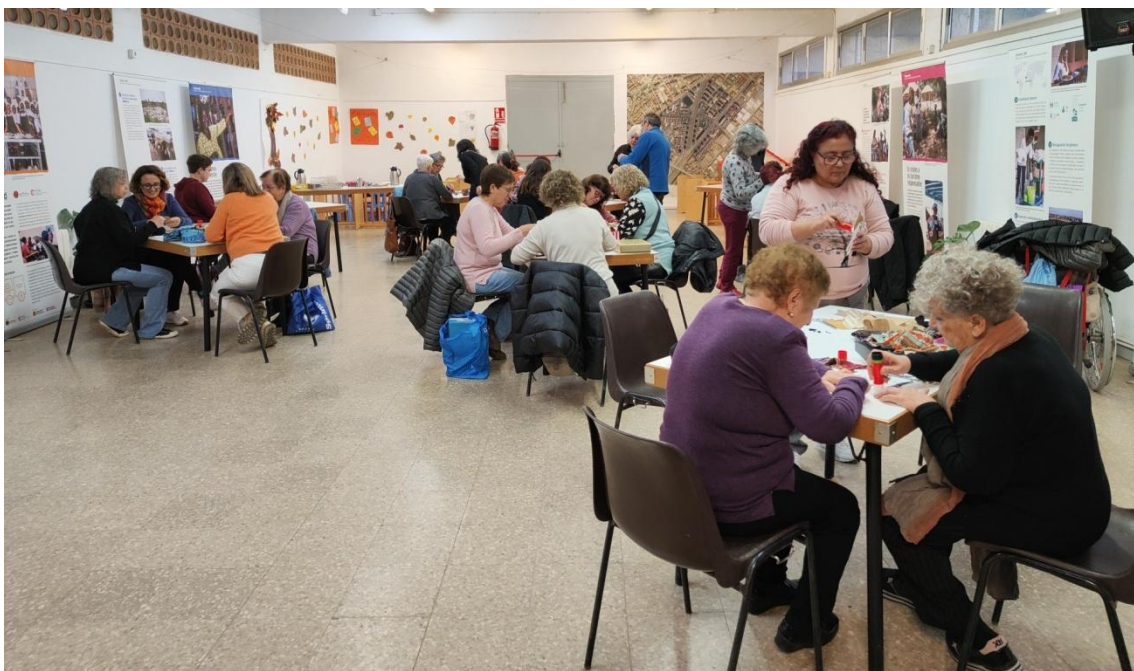
Concentrating on the hands-on activity.