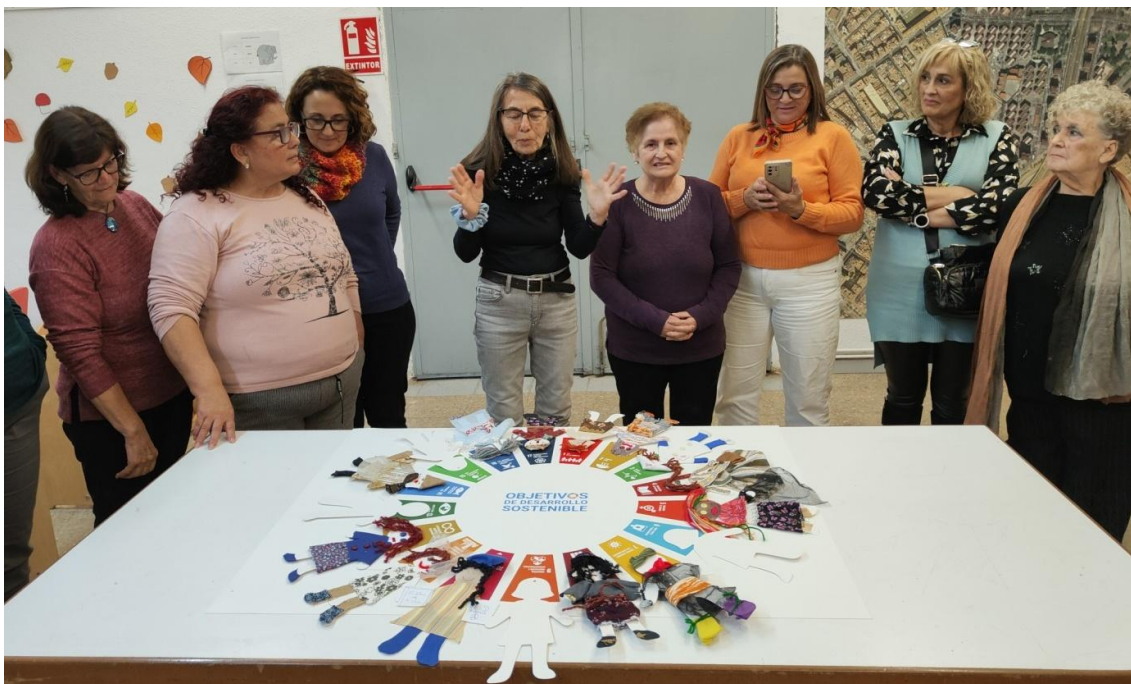
Participants at the end of Section 1 of the workshop with the completed doll figures placed on the relevant SDG.