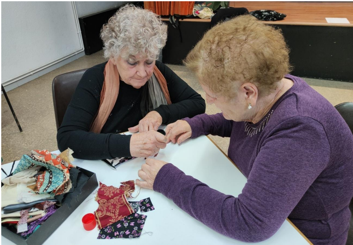
Some fabrics are selected but the finished doll is not yet ready to be revealed.