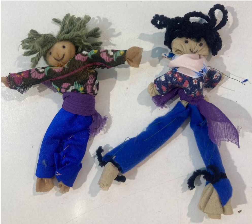
With matching colours this pair is ready to take on their SDG actions.