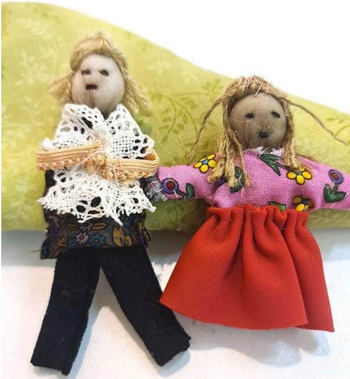
Resolute and determined, these dolls are ready to take on their SDG challenge. (Photo: Monica Moro)