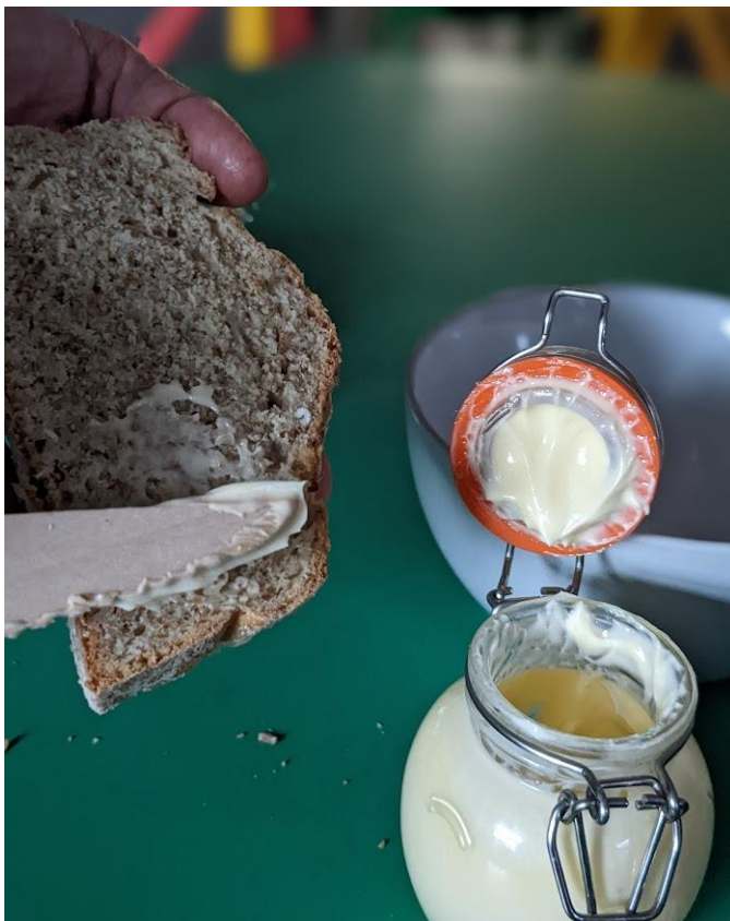
Taste tasting the butter made by the children.