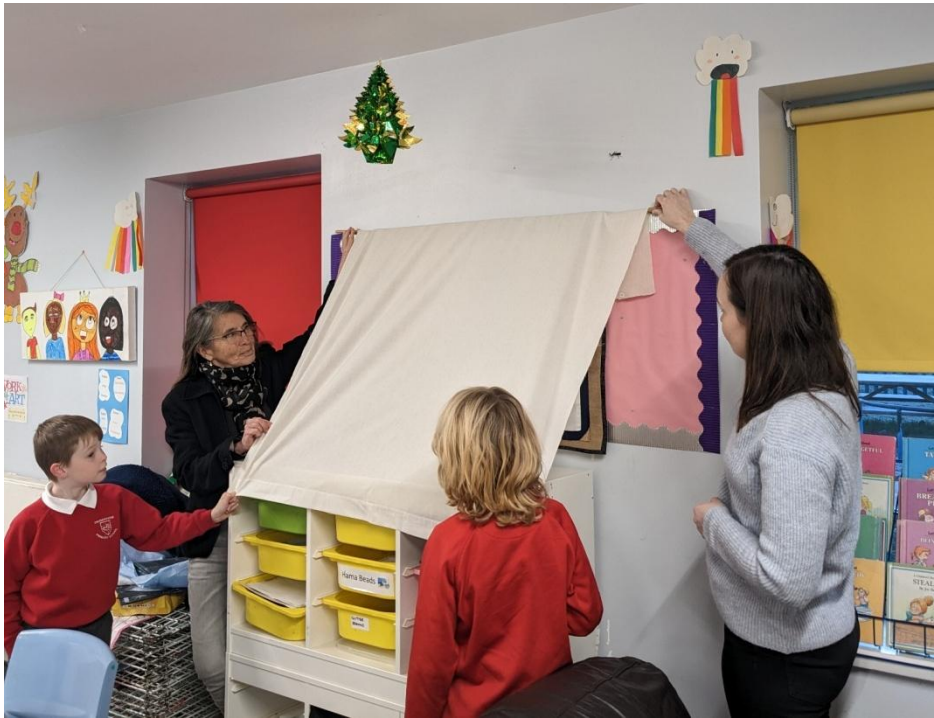
Preparing to unveil! (Photos © BCLLPS).