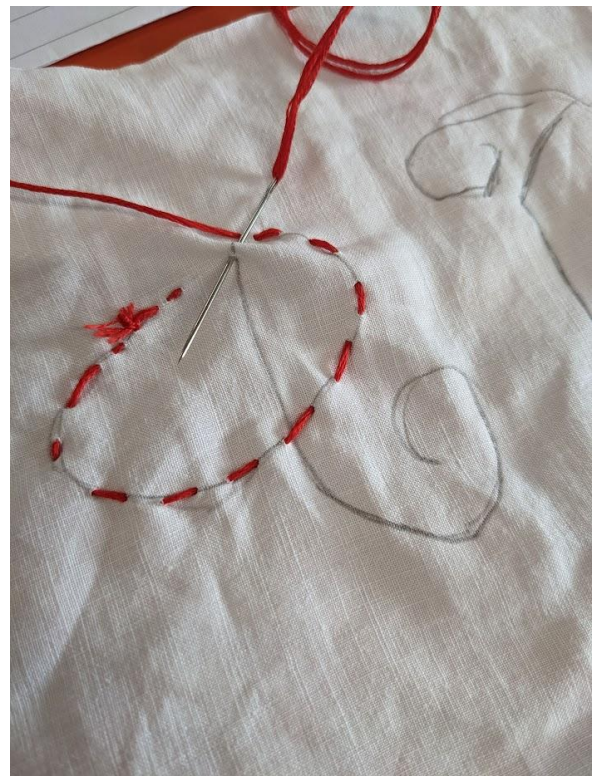
Children embroidering their initials using the Victorian alphabet.