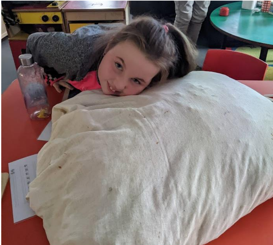
Trying out the straw mattress for size