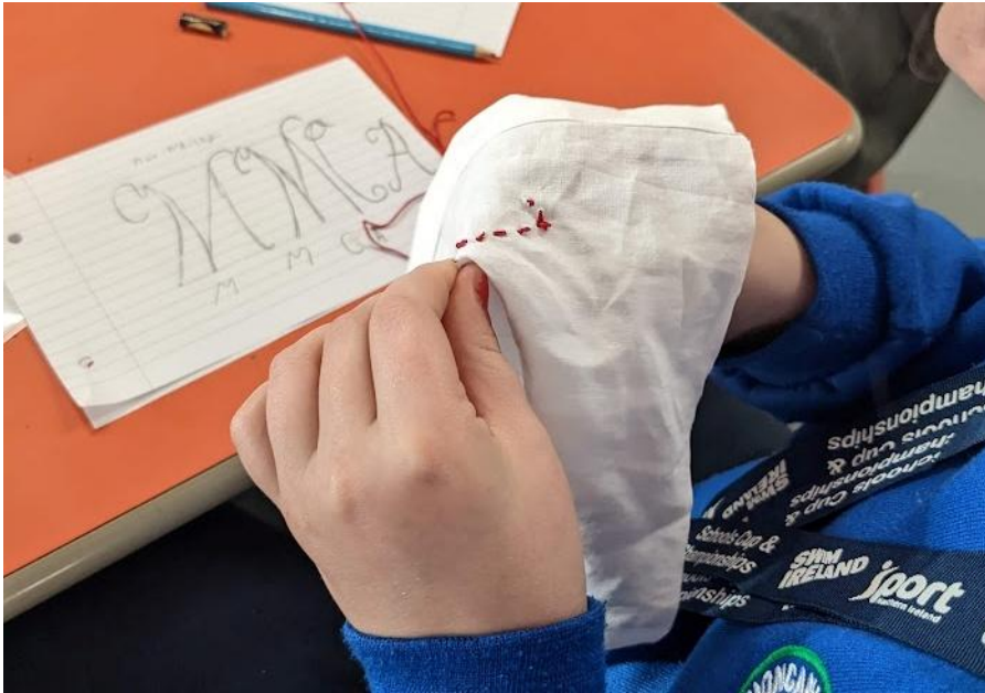
Children embroidering their initials following the Victorian alphabet (Photos © BCLLPs).