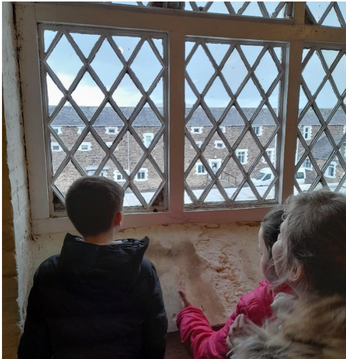
The children look out the window of the former Girls dormitory to the yard below