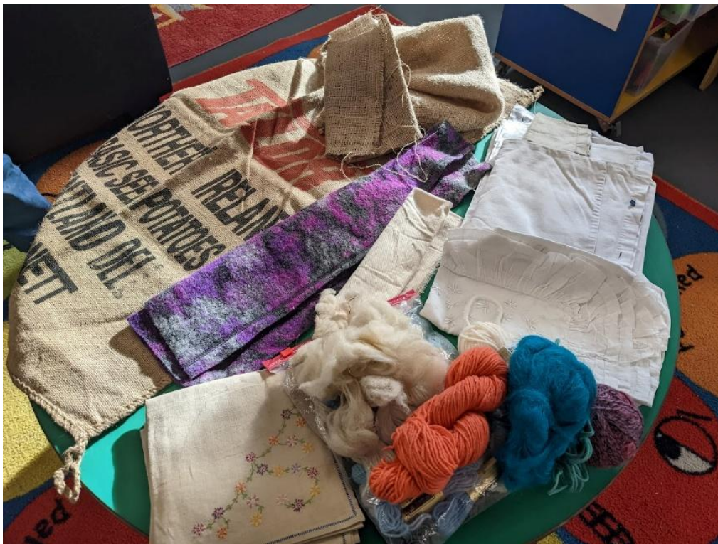
A selections of materials, fabrics and yarns.