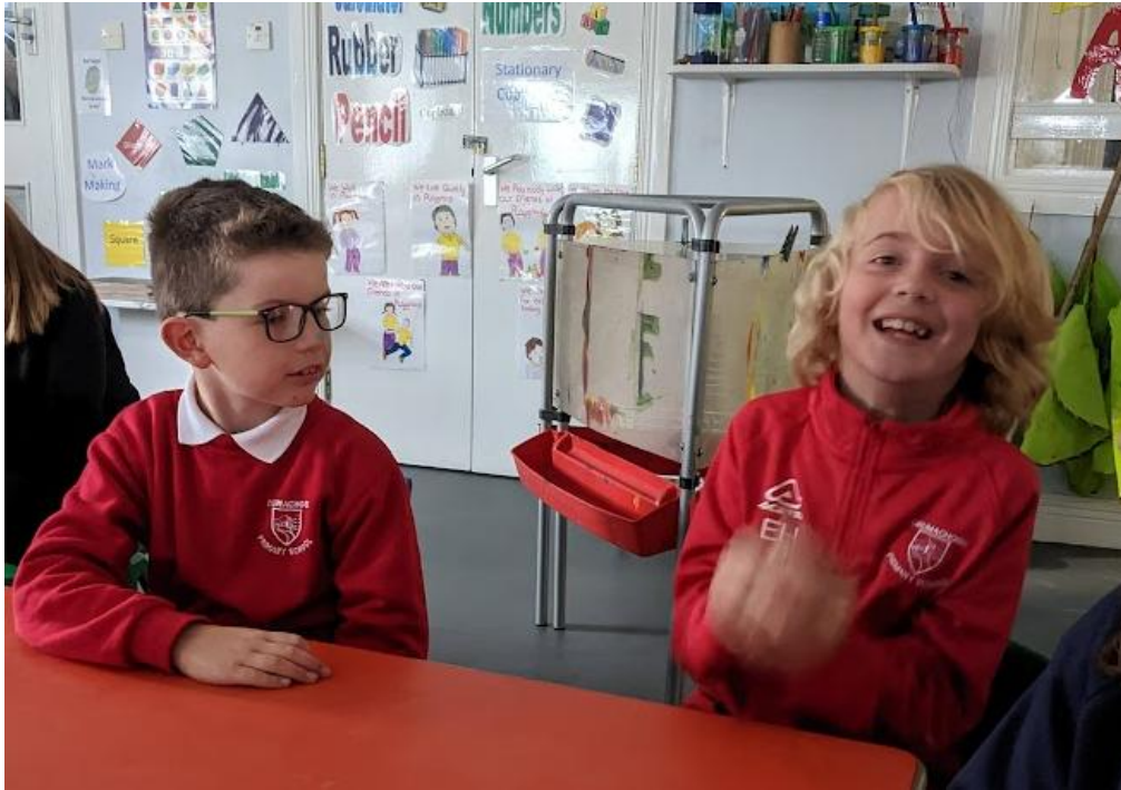
Shaking the milk to make butter.