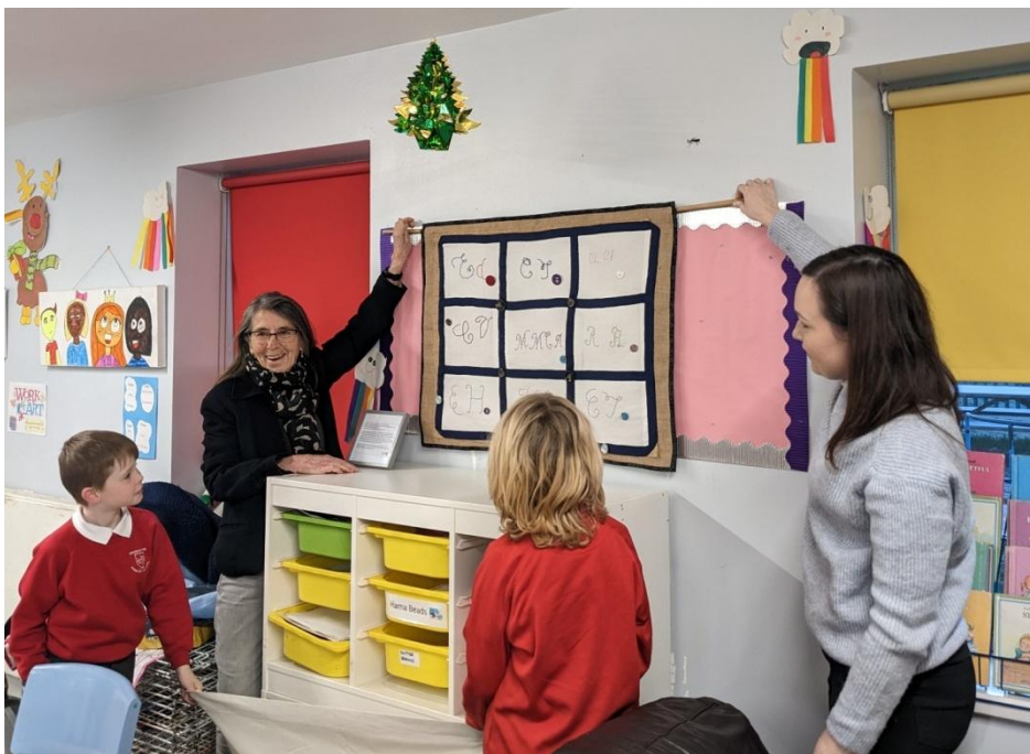
Children see the collective piece for the first time.