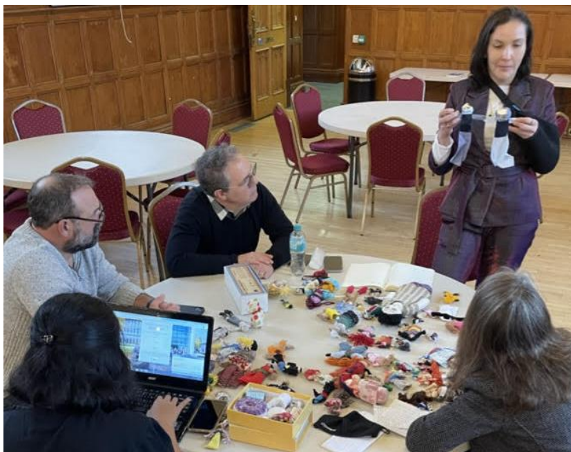
Workshop participants with dolls made in previous workshops reflecting on which dolls they will use to populate the fabric print Nicitu, Lord's Resistance Army base, South Sudan, 1996 - 2001