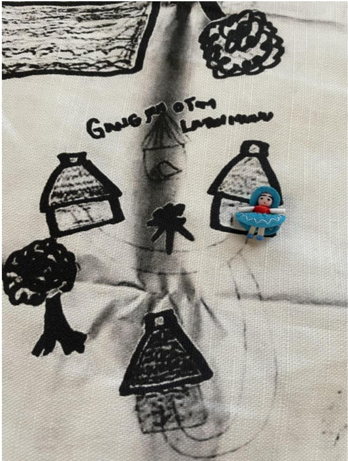
A doll chosen by a participant inhabits the fabric print.