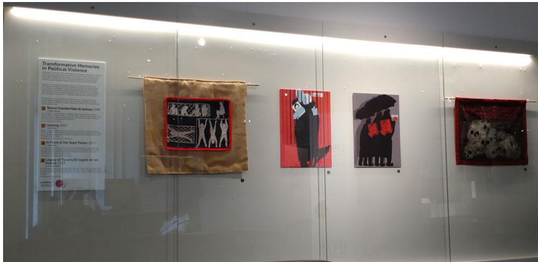
The four piece exhibition specially curated for the TMIN MemoLab programme in Northern Ireland, on display in "The Troubles and Beyond" exhibition space, Ulster Museum.