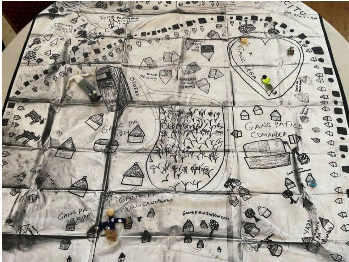
Nicitu, Lord's Resistance Army base, South Sudan, 1996 - 2001 populated with dolls at the close of the workshop.