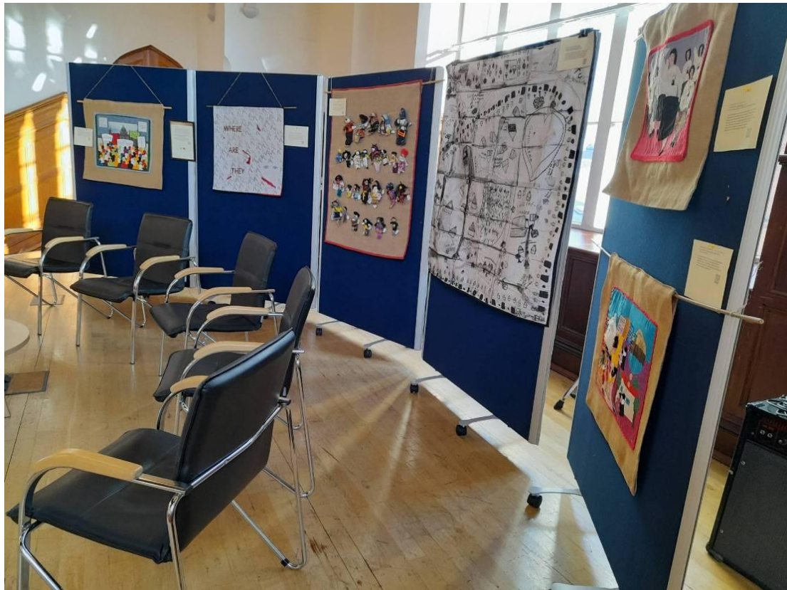
The six-piece Conflict Textiles exhibition on display in The Great Hall, Magee Campus.