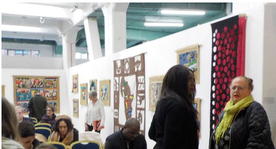
Attendees gather for the launch against the backdrop of the Conflict Textiles exhibition.

The overall exhibition was accompanied by a six-day programme of State of the Art MemoLab activities made up of talks, workshops and performances. Three days took place in Dublin (14–16 October) and five days in Northern Ireland (17-21 October).