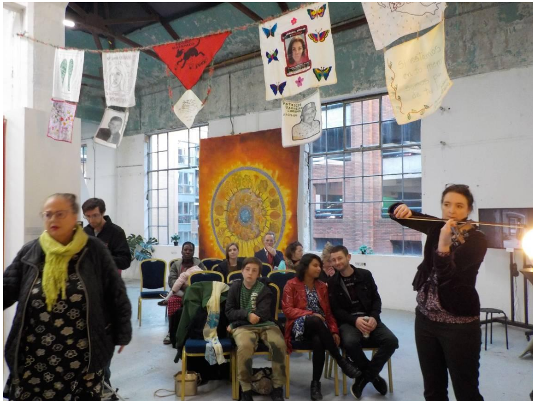
Embroidered & printed Pañuelos / Handkerchiefs - Chile, Colombia and Mexico, made by relatives of the disappeared, prominently displayed as part of Conflict Textiles exhibition.