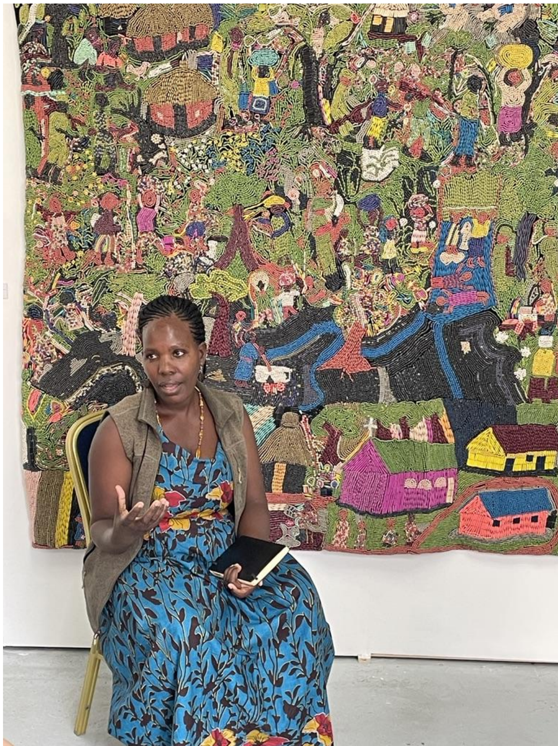
A member of the Women's Advocacy Network (WAN) Uganda explaining "CRSV Survivors' Stories".