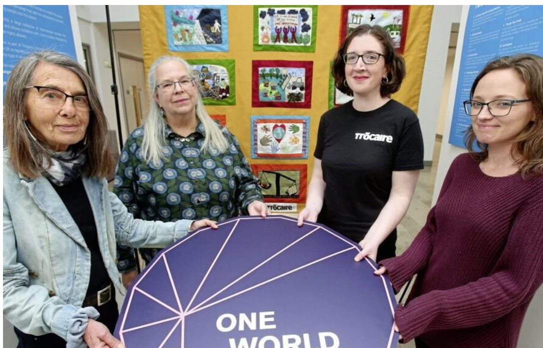
Highlighting the One World Festival 2022, 10-14 October , of which the launch was one event.