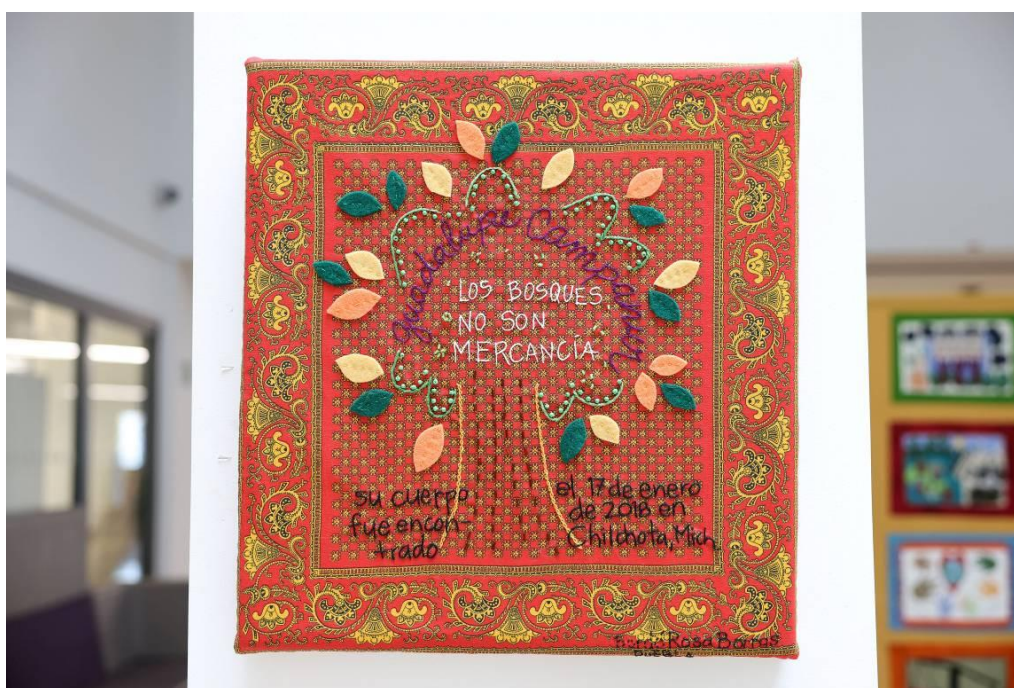
A close up of Los Bosques no son mercancía / The forests are not for sale.