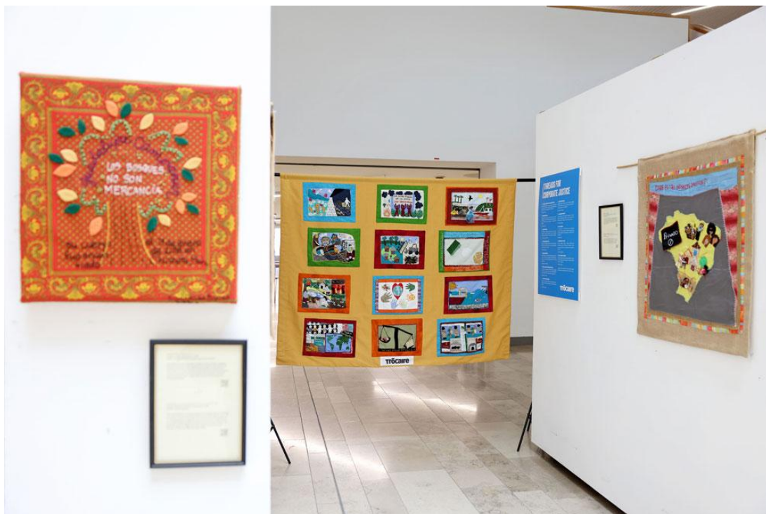
The completed installation.