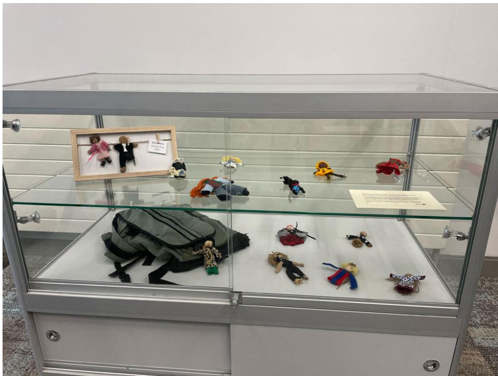
Materials and objects: The rucksack was used in the film and symbolises the layers of journeys undertaken by refugees. The dolls were created in a related workshop Every Action Counts – Making arpillera dolls .