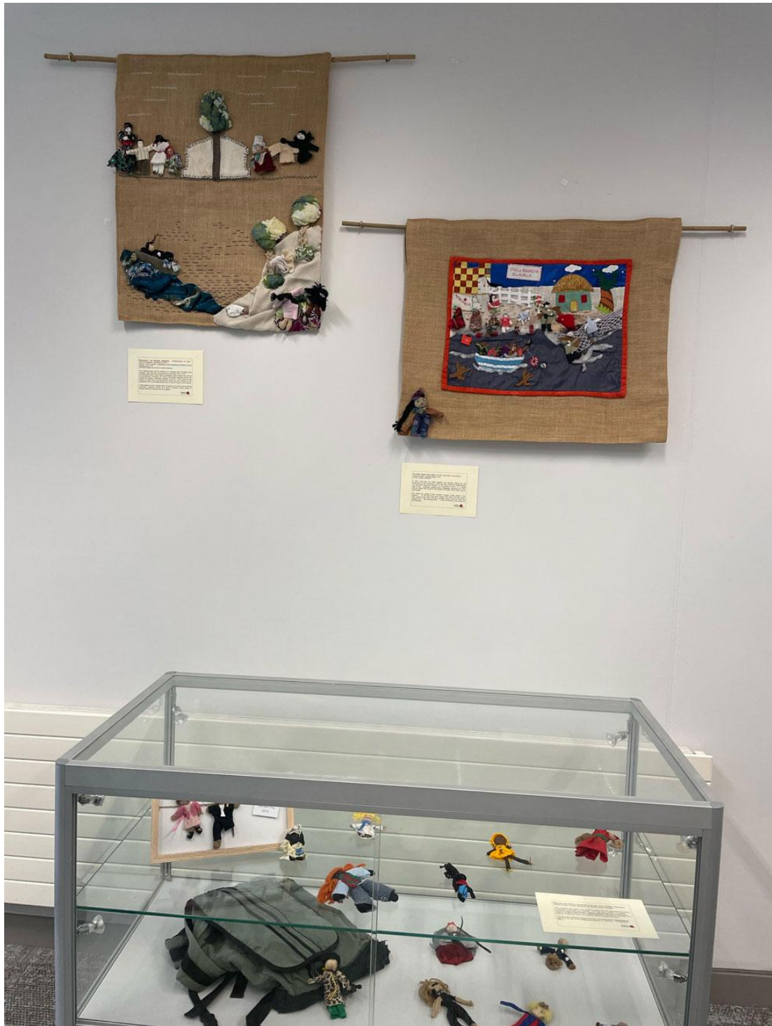
The final installation comprised of two arpilleras - Bienvenida a las personas refugiadas - Identificándose con ellas , En el lado “bueno” de la valla 2 / On the “Good” Side of the Fence 2 – and materials and objects connected to the film and exhibition.