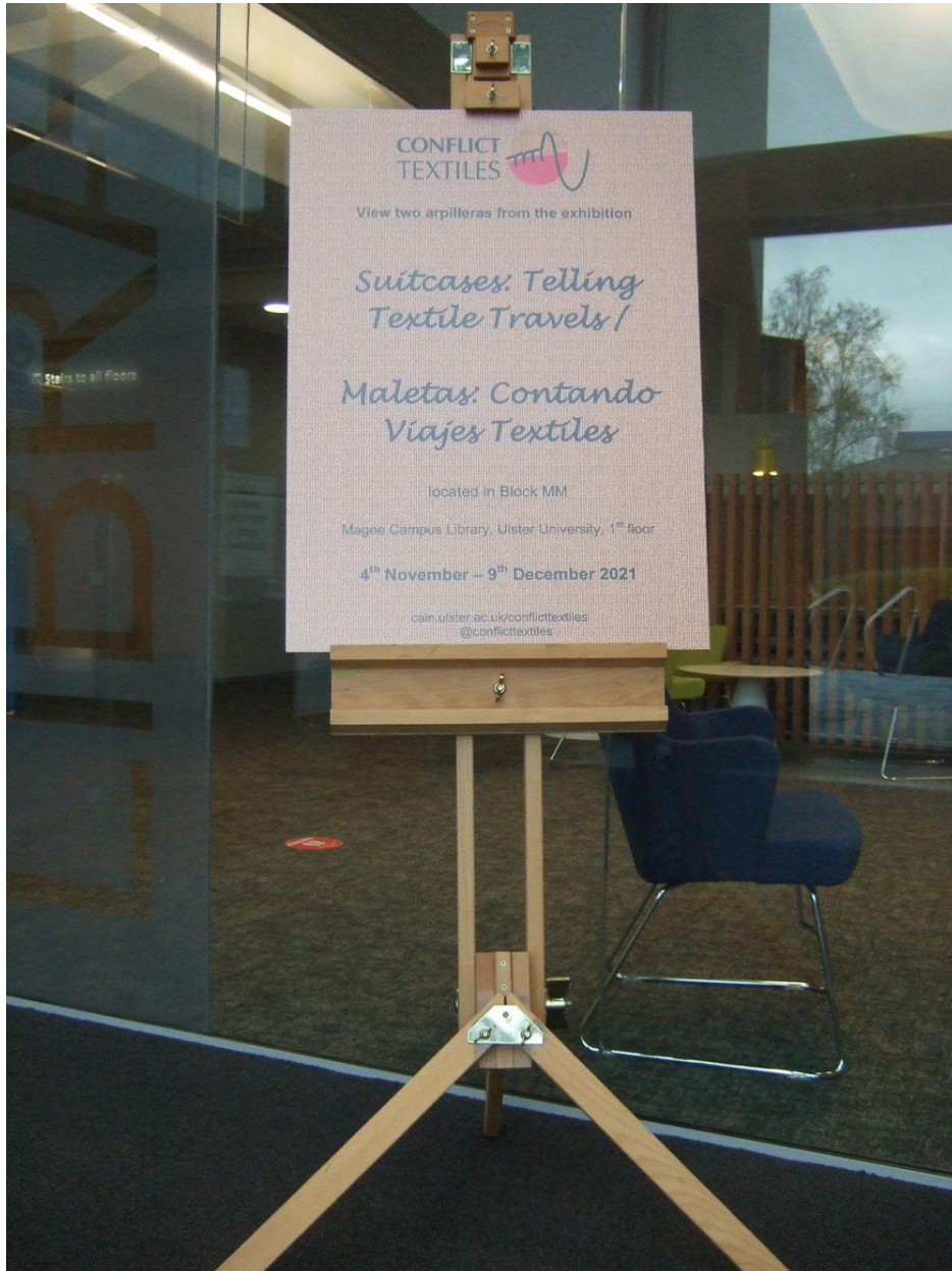
The easel positioned inside the main entrance to the library, directing staff, students and visitors to the installation upstairs.