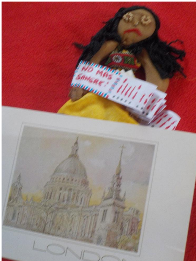
This doll carries a sign "NO MAS SANGRE / No more blood". Her maker has also enclosed a card to the curator on the significance of the workshop process.