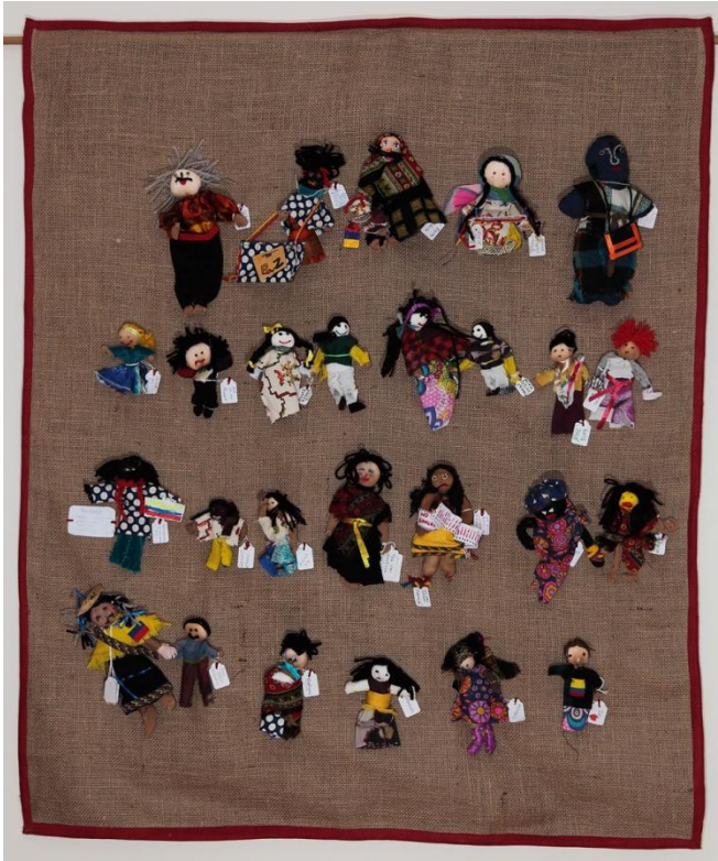
The outcome banner with the 26 dolls made by workshop participants.