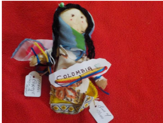
A selection of the dolls created.