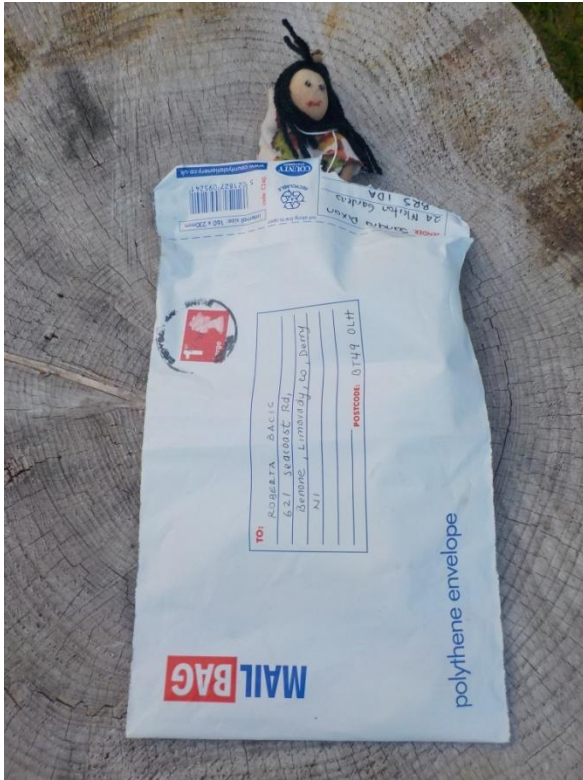
Emerging from the package.