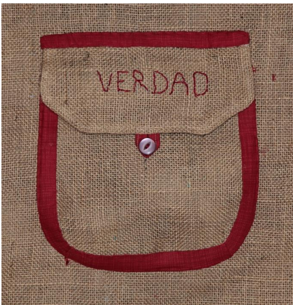
The reverse side of the banner showing a small pocket containing the notes accompanying each doll - a practice common among the early Chilean arpilleristas. (Photo: Martin Melaugh © Conflict Textiles)

All images are snapshots documenting the process, © Conflict Textiles archive. The final two images are by Conflict Textiles photographer Martin Melaugh © Conflict Textiles.