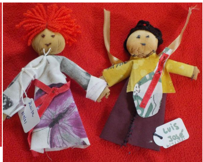
Some dolls in pairs.