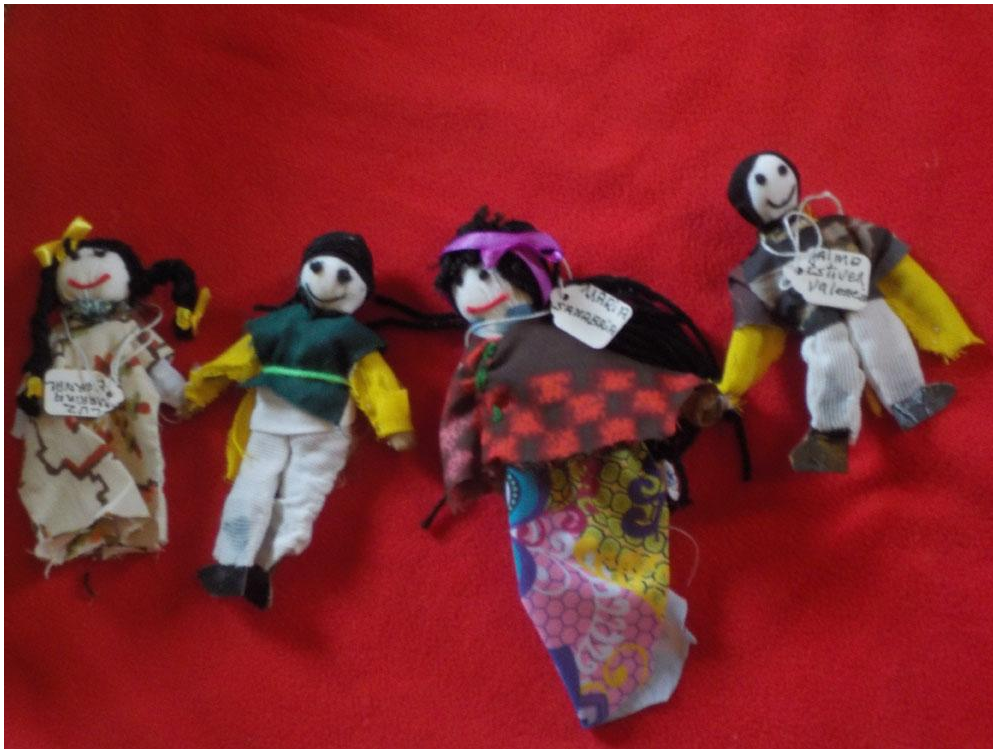
A collection of four dolls bearing their name tags.