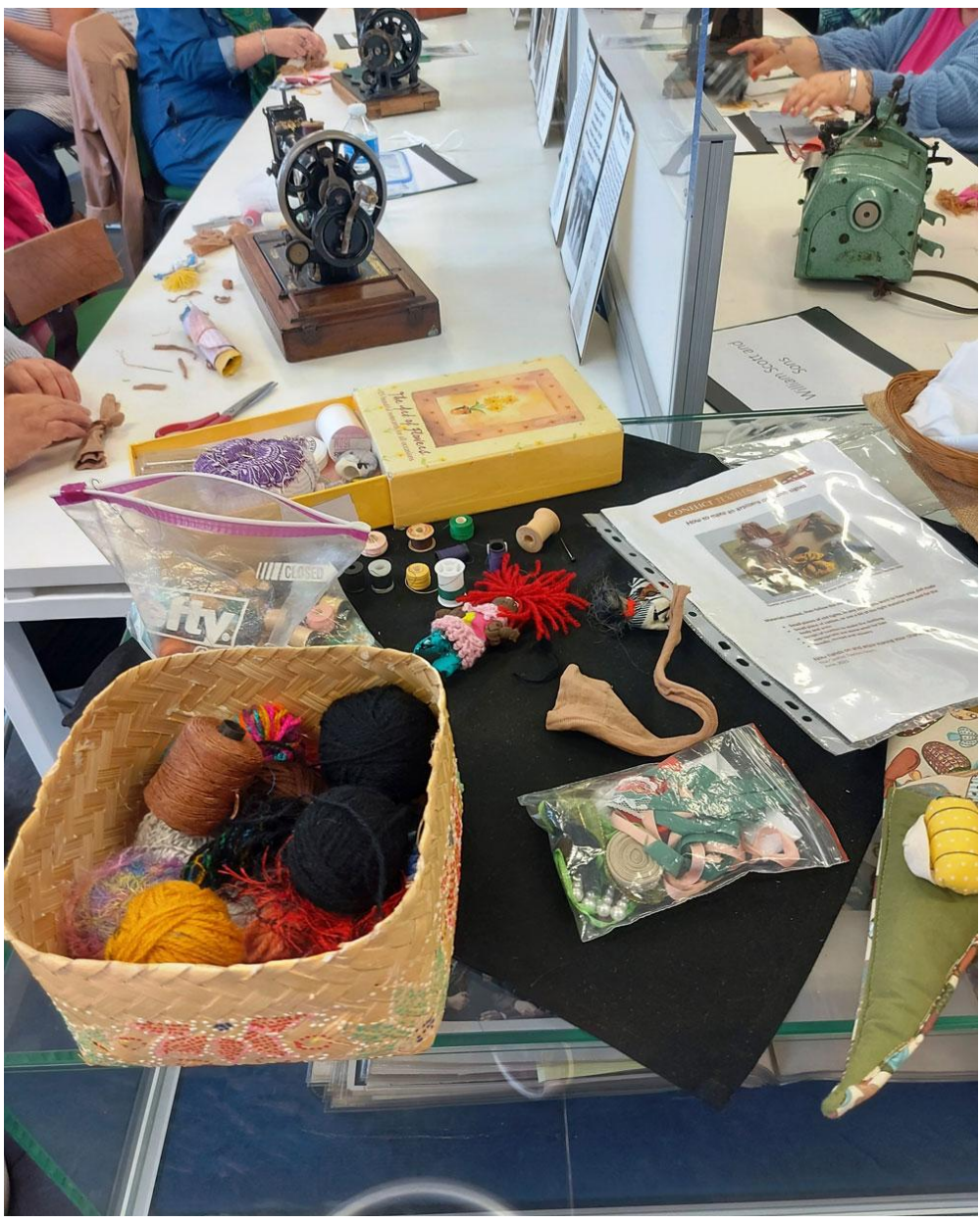
A selection of other materials used in the workshop; tights, thread and wool.