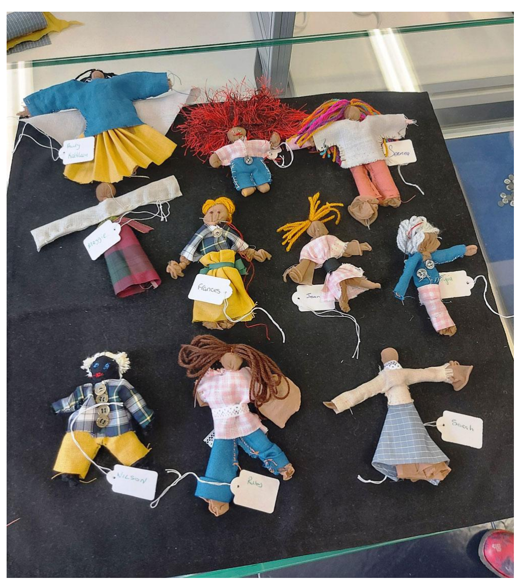
The finished dolls on display. Each doll was named by its maker.