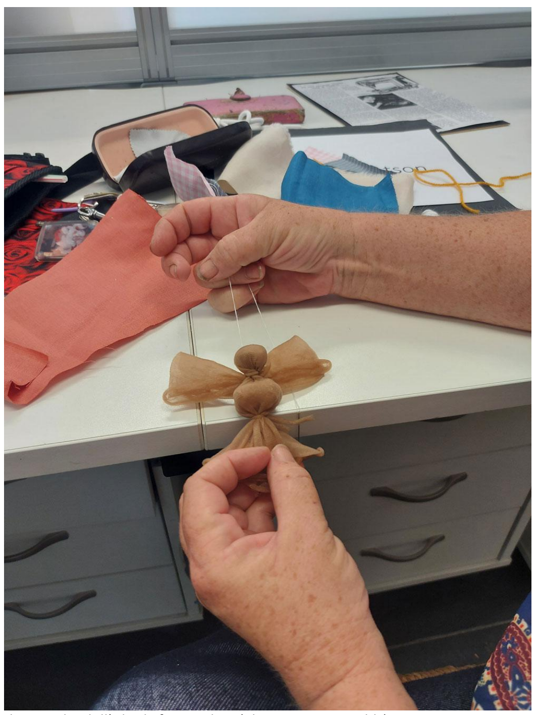
Shaping the doll's body from tights.