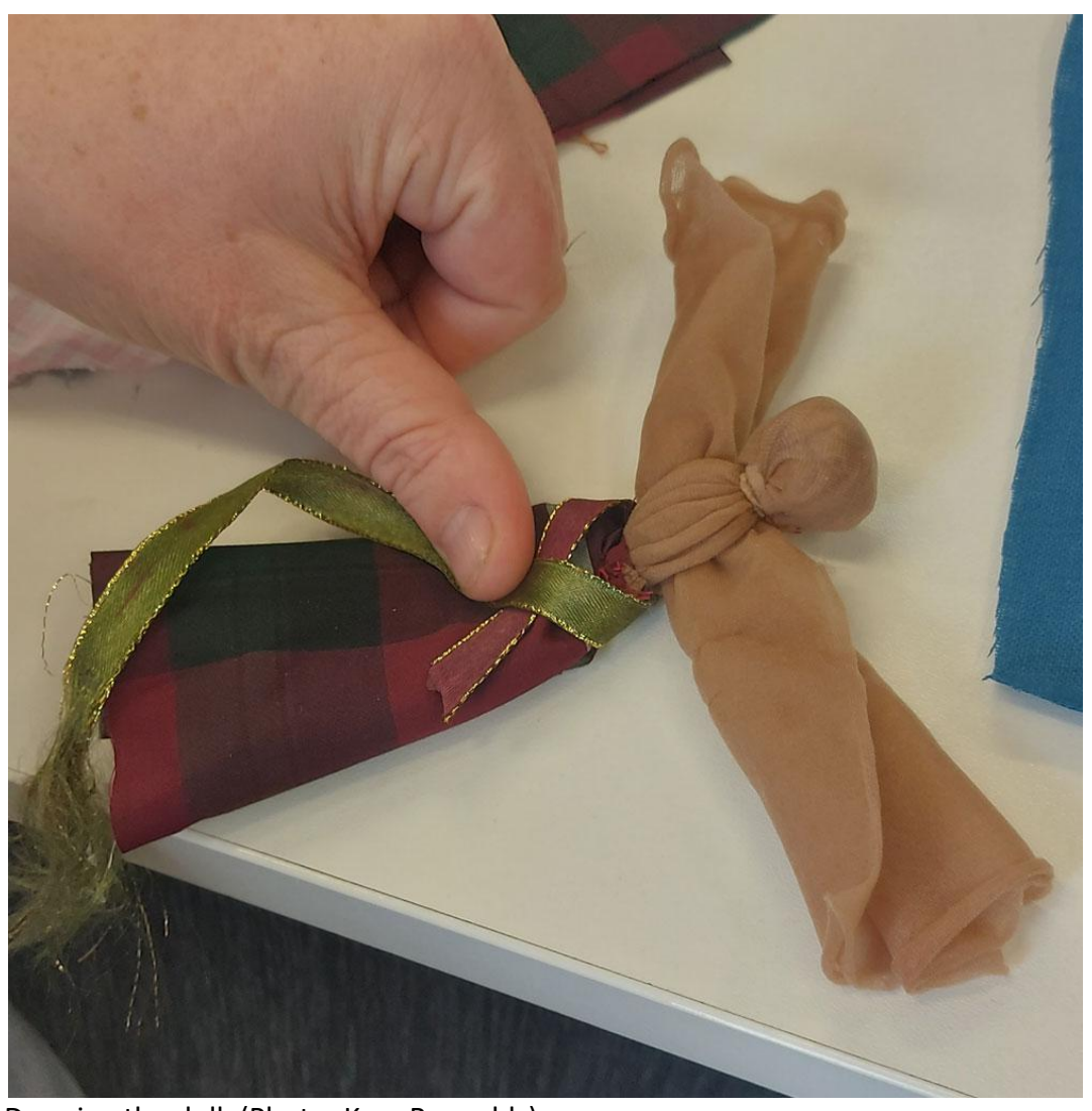
Dressing the doll.