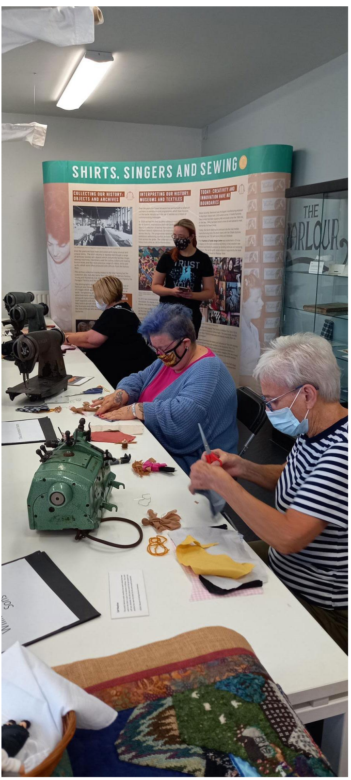
The women engrossed in creating their dolls against the backdrop of the exhibition.