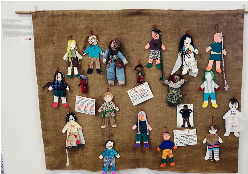
'We cannot walk alone – Refugee week 2021 Young People's banner', made by Children/youth groups in the Limavady area.

Three of the pieces were produced during Conflict Textiles workshops commissioned by CCGBC Good Relations team in response to the theme of Refugee Week 2021 'We Cannot Walk Alone.' A fourth piece, created by Fundació Ateneu Sant Roc arpilleristas in Catalonia for World Refugee Day, 20th June , brings a transnational dimension to the display.