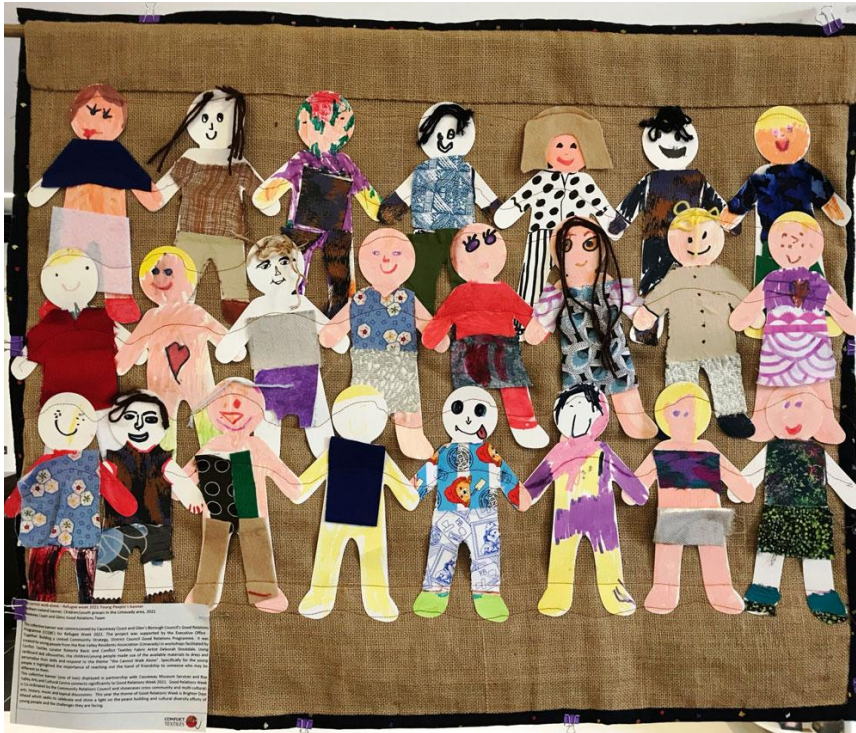
'We cannot walk alone – Refugee week 2021 Young People's banner', the second banner made by Children/youth groups in the Limavady area.