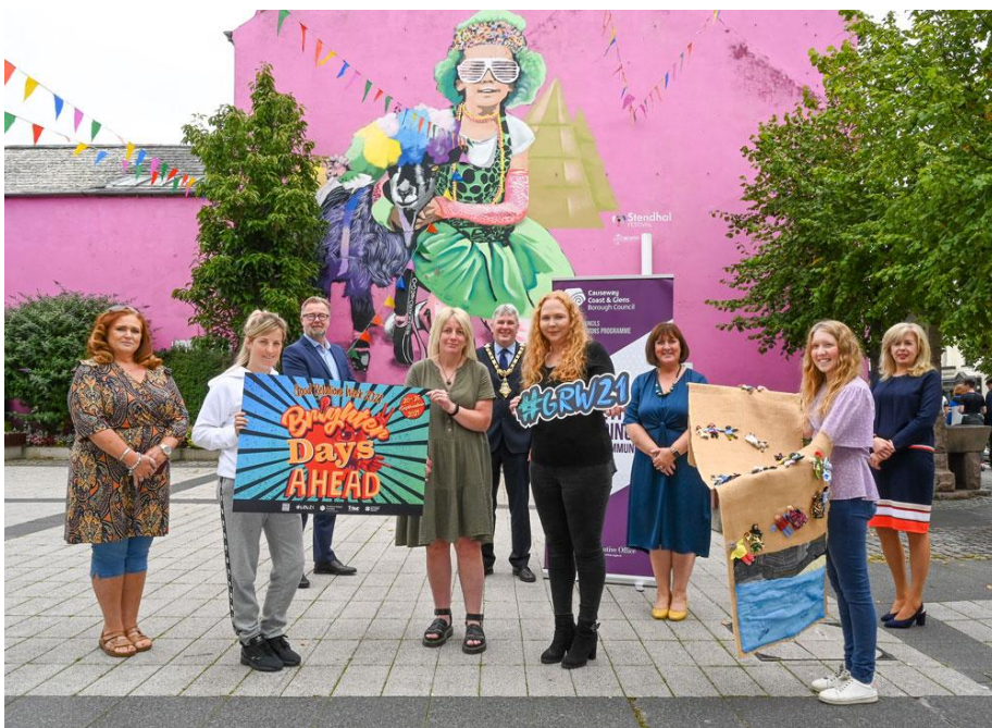
CCGBC Good Relations team and Roe Valley Arts and Cultural Centre staff at the launch of Good Relations week 2021 in the Centre courtyard area.