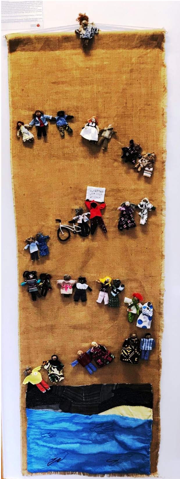
'Caminemos juntos / Let us walk together', by Fundació Ateneu Sant Roc members , (Catalonia/Spain).