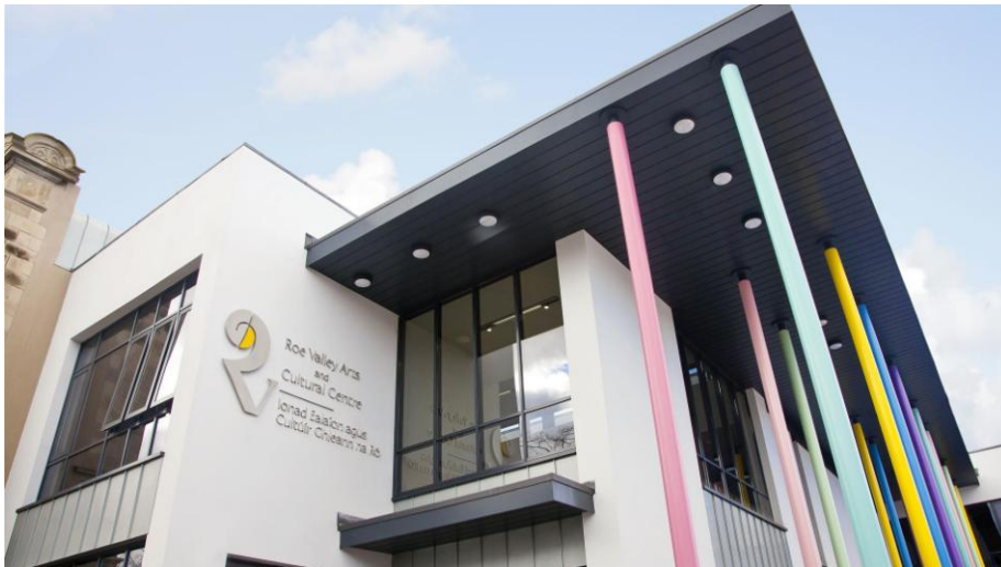
Roe Valley Arts and Cultural Centre, where the four textile pieces are on display.