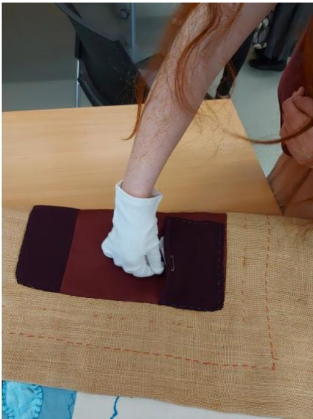
Replacing a letter from the maker in the small pocket on the reverse side of the arpillera.