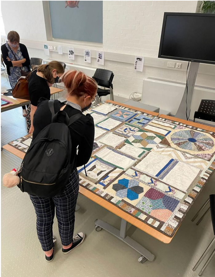
Absorbing the detail of Hilvanando la busqueda / Stitching the search