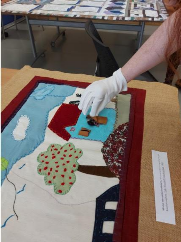
Experiencing the tactile nature of this arpillera Minhas memórias da ditadura / My memories of the dictatorship.