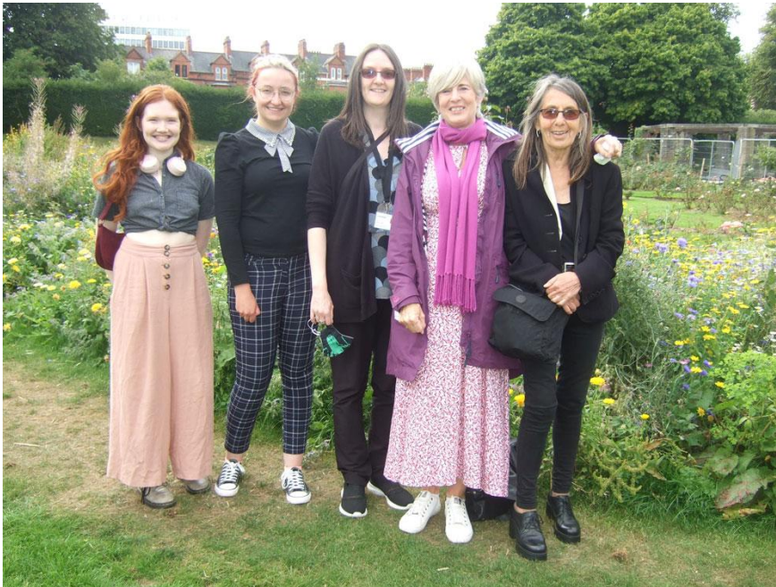
Enjoying a walk in the Botanic Gardens before the afternoon online seminar