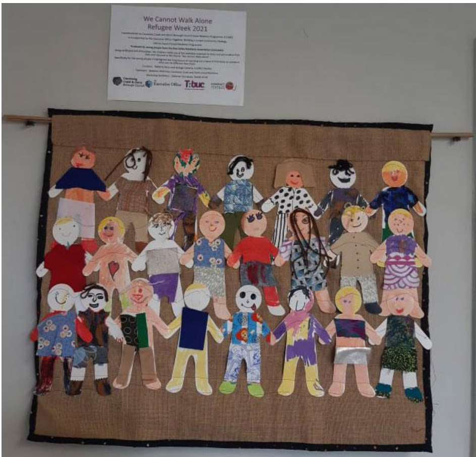
A second display of cardboard dolls made by children/youth groups in Limavady.