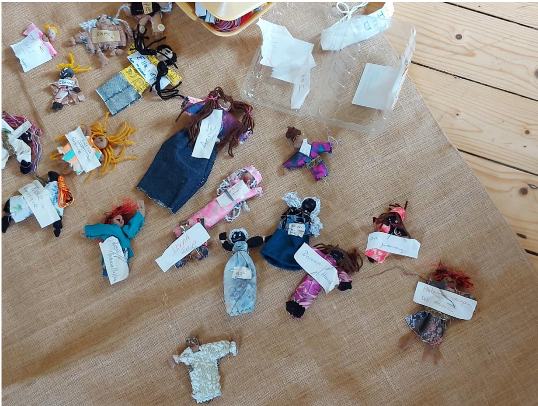
The finished arpillera dolls take their place on the banner.