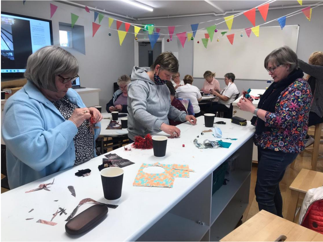
These participants get started on creating their dolls.