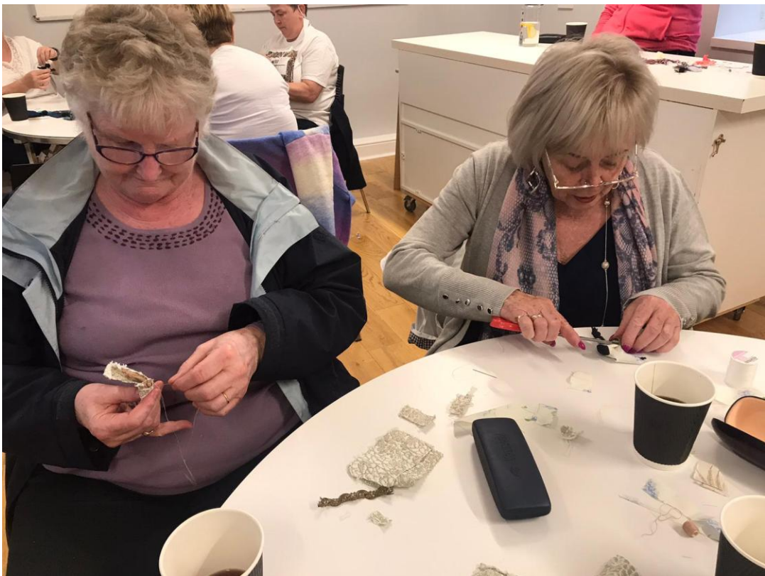
Concentrating on the task.