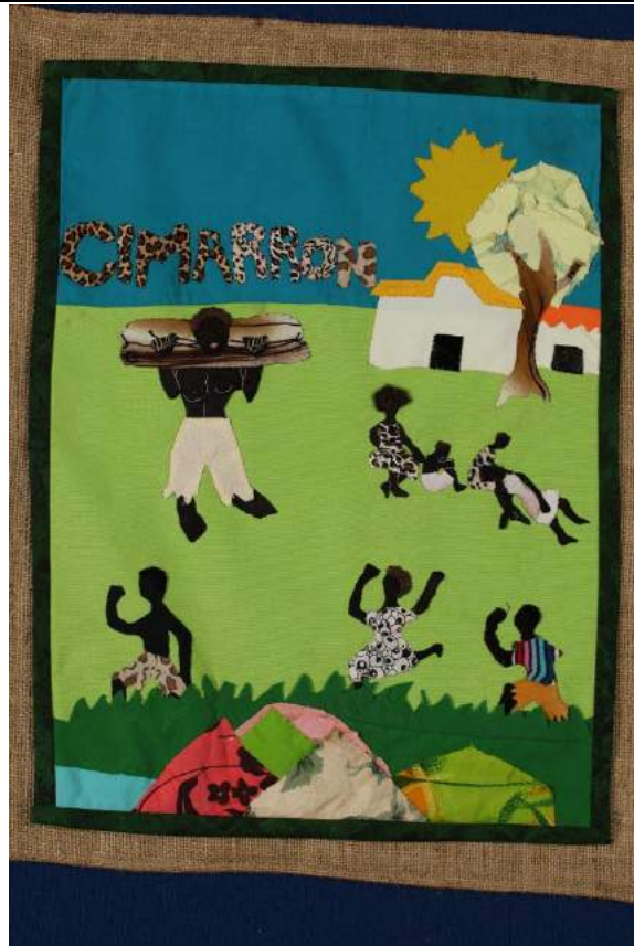
'Cimarrón / Runaway slave', by Mujeres tejiendo sueños y sabores de paz.