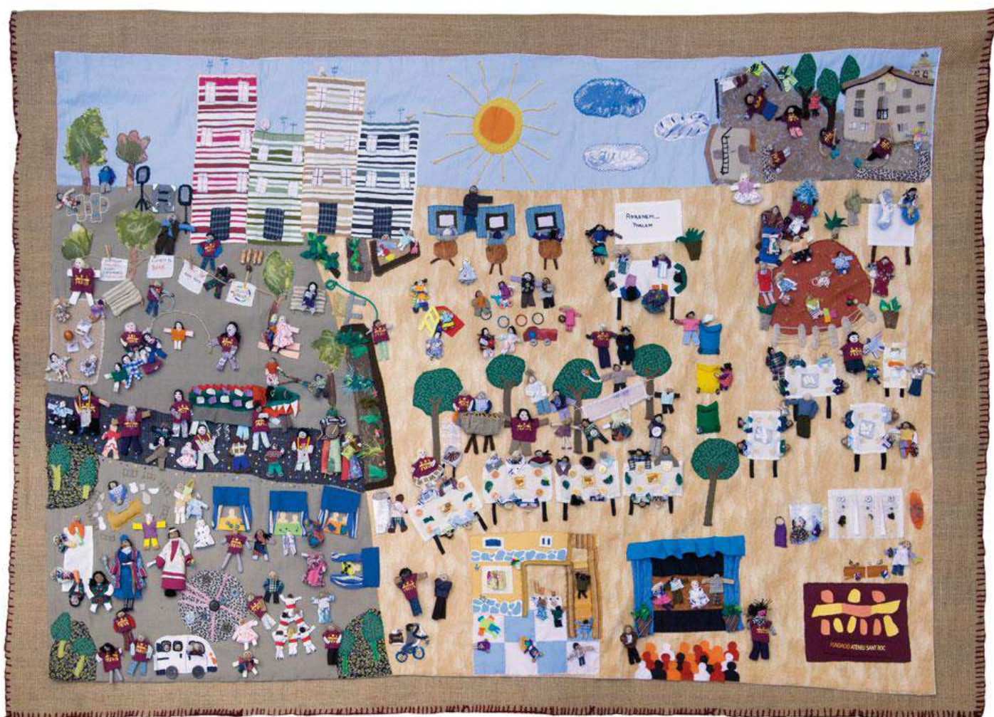
"POSAR FIL A L'AGULLA / Poner manos a la obra / Hands on", by Arpilleras Fundació Ateneu Sant Roc.