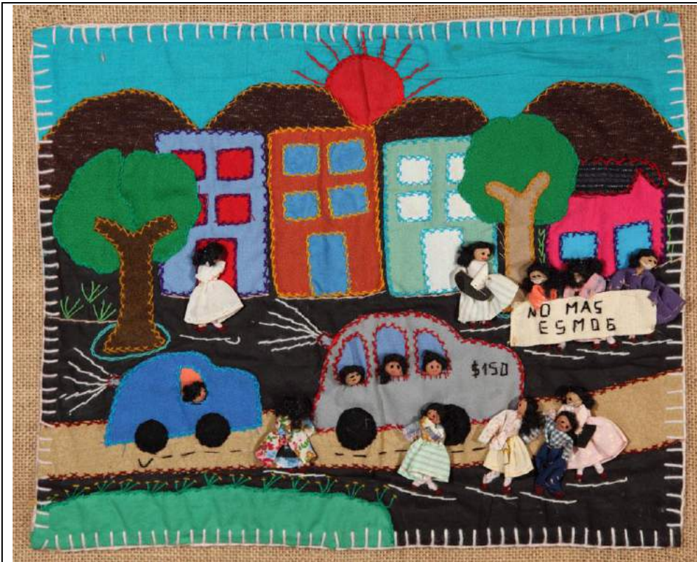
'No más contaminación/ No more pollution', Anonymous.