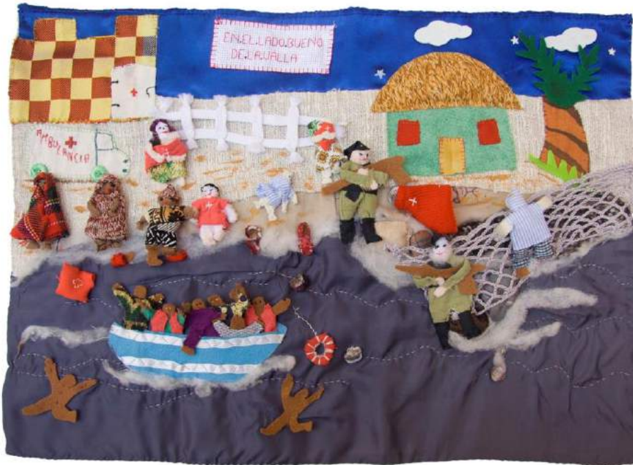
'En el lado “bueno” de la valla 2/ On the “Good” Side of the Fence 2', by Antonia Amador.