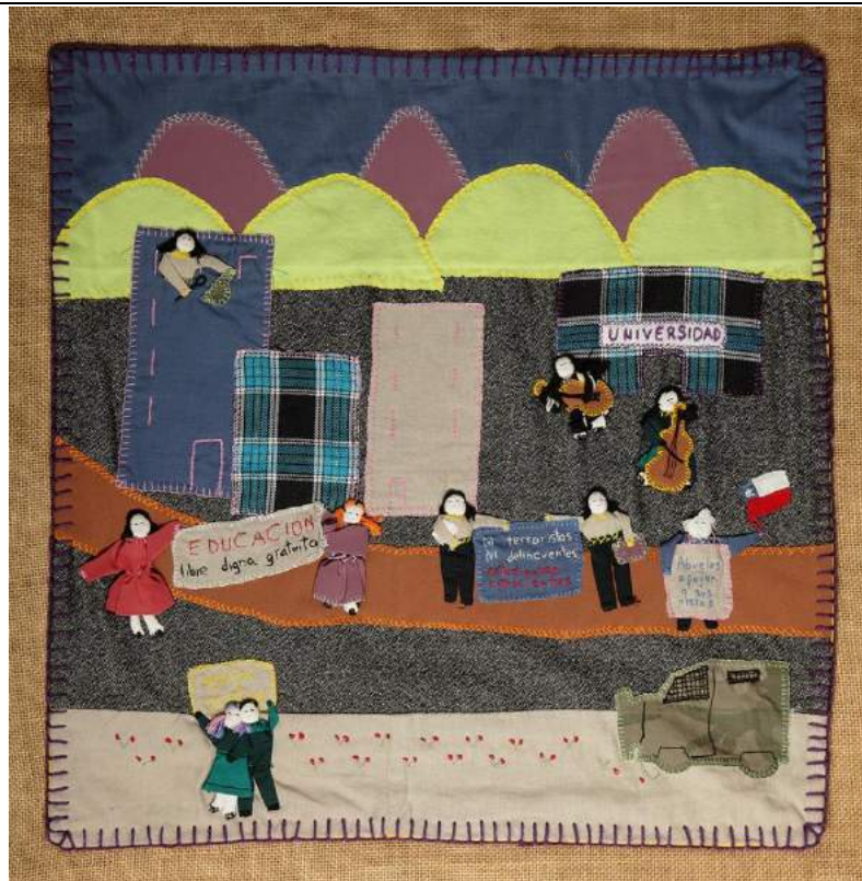
'Paro de los estudiantes' chilenos 2 / Chilean students' strike 2', by Pamela Luque.