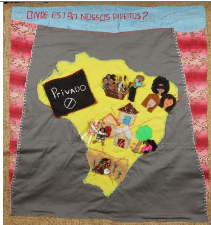
'Onde estão nossos direitos? / Where are our rights?', by Women of the Movement of People Affected by Dams.