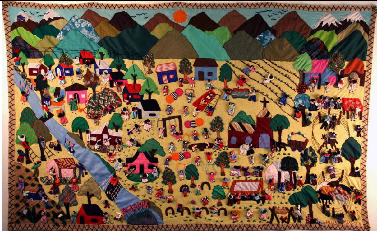
'Vida en Nuestra Población / Life in Our Poor Neighbourhood', Taller Recoleta.