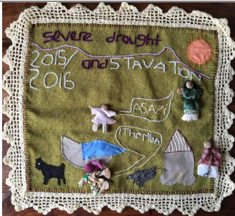
'2016 Starvation in Zimbabwe', by Lakheli Nyanthi.