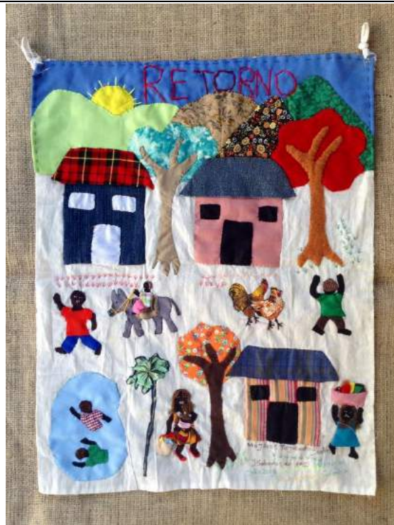
'Retorno/Return', by Mujeres tejiendo sueños y sabores de paz, Mampuján.