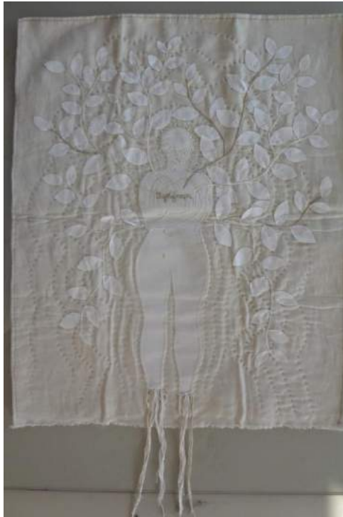
'Nos hacen falta / We miss them', by Rosa Borrás. (Photo: Rosa Borrás)