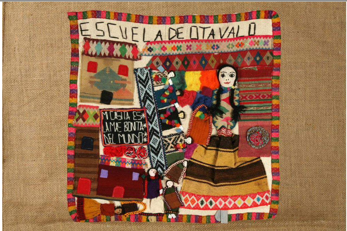
'Escuelita de Otavalo / Otavalo Primary School', Anonymous.