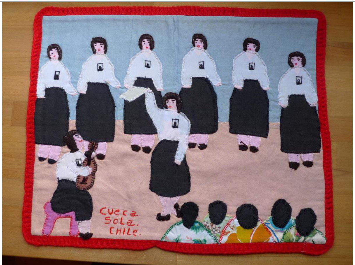
'La Cueca Sola / Dancing Cueca alone', Anonymous.