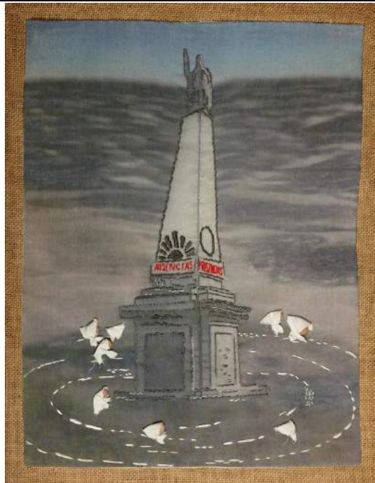
'Ausencias - Presencias 2 / Absences – Presences 2', by Ana Zlatkes.