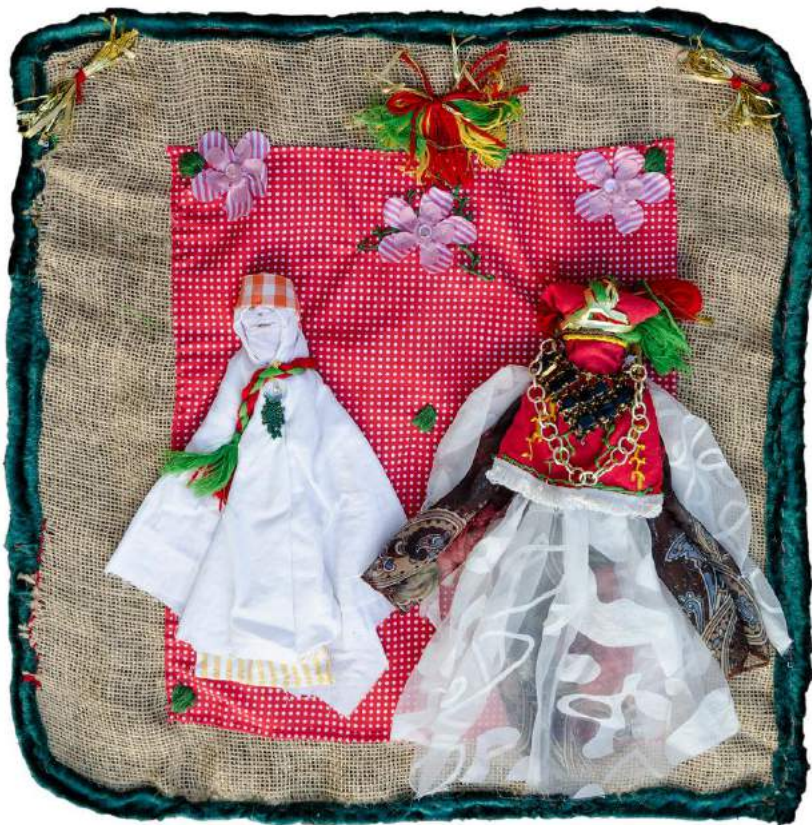
'LA BODA DE MI HIJA / My daughter's wedding', by Fàtima Mansouri.