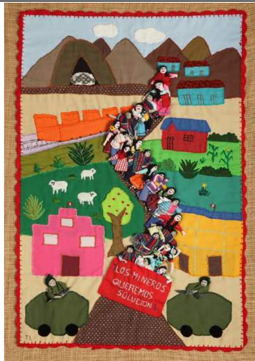
'Marcha de las mujeres de los mineros / March of the miners' wives, daughters and sisters', by TL, Mujeres Creativas workshop.