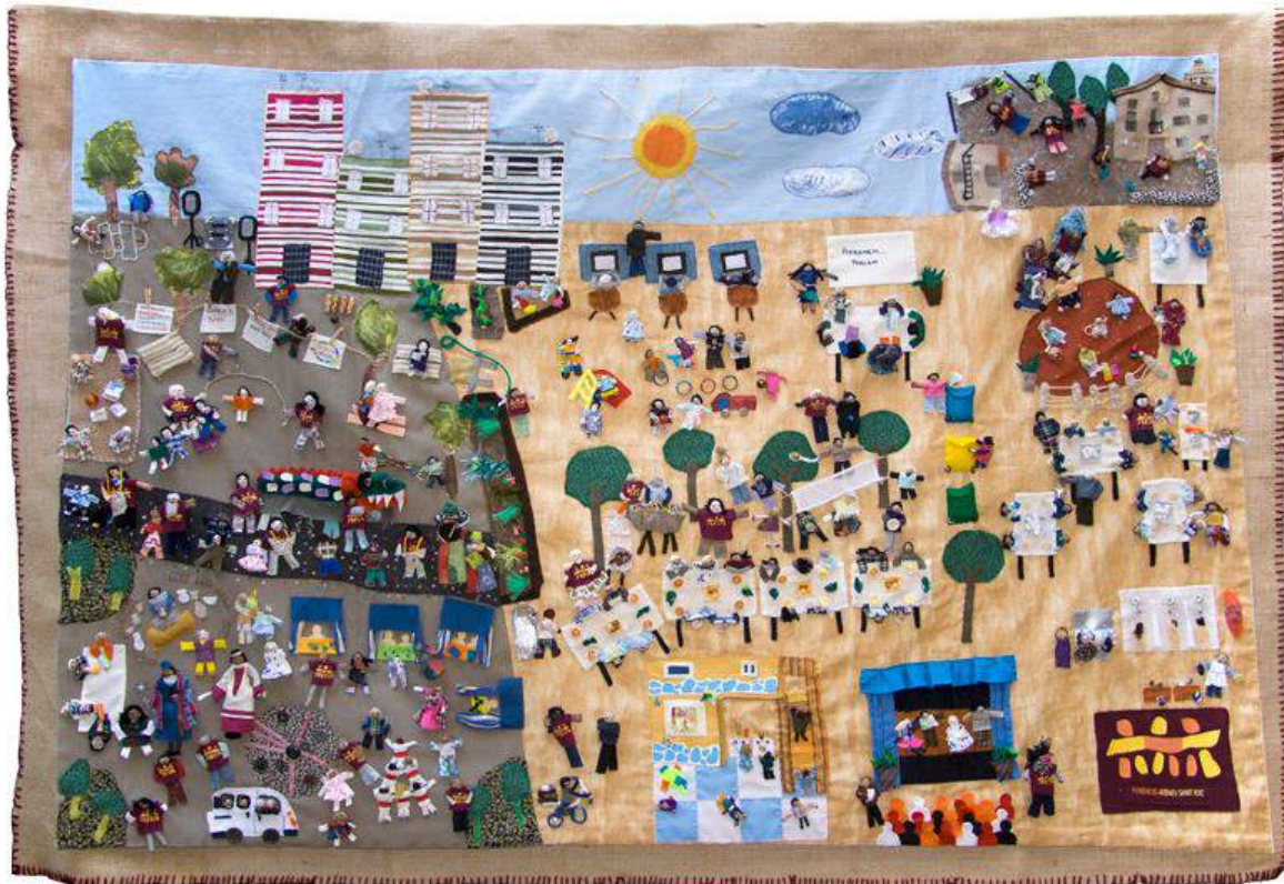
'POSAR FIL A L'AGULLA / Hands On: An arpillera made out of commitment', by Fundació Ateneu Sant Roc arpillерistas group.