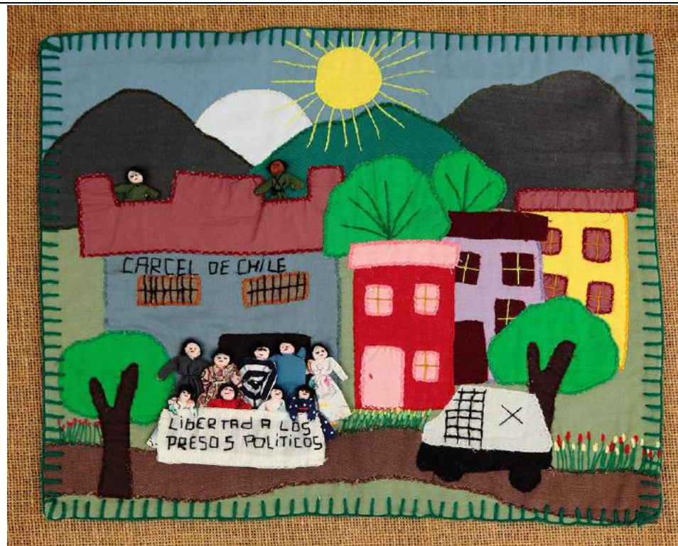
'Libertad a los presos políticos / Freedom for the political prisoners', Anonymous.