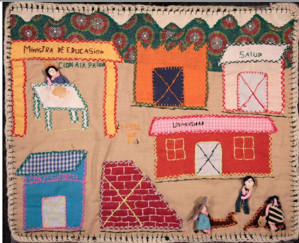
'No tenemos acceso a los servicios públicos / We have no access to public services' Anonymous.