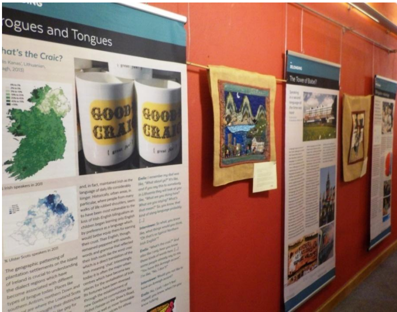
2 nd floor pop ups with 2 of the exhibited international arpilleras