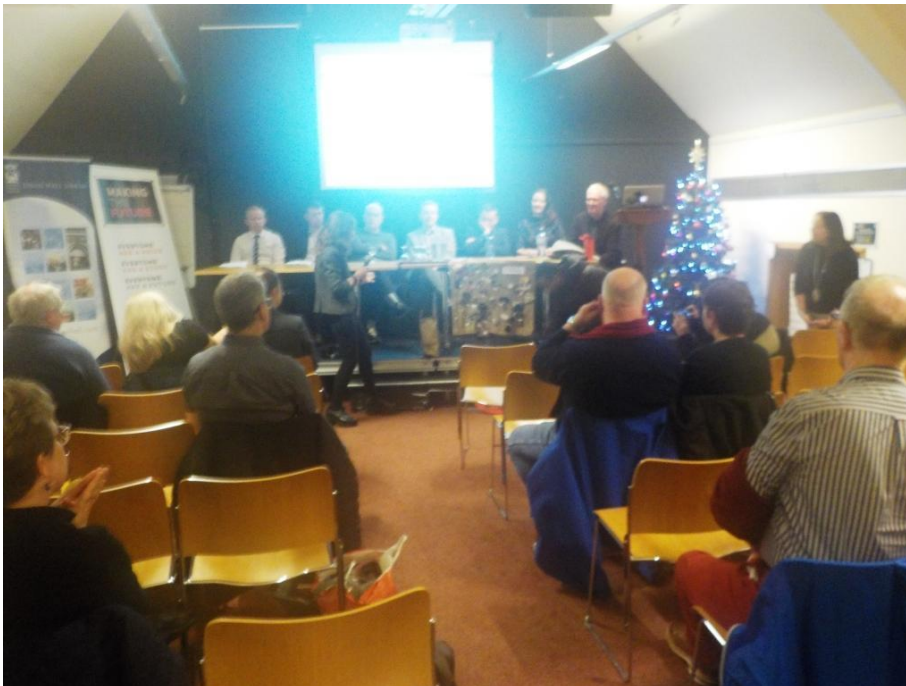
Unveiling of arpillera made by Friendship Club North Belfast and shared outside the group for the 1 st time.

The International Year of Indigenous Languages is a United Nations observance in 2019 that aims to raise awareness of the consequences of the endangerment of Indigenous languages across the world, with an aim to establish a link between language, development, peace, and reconciliation.