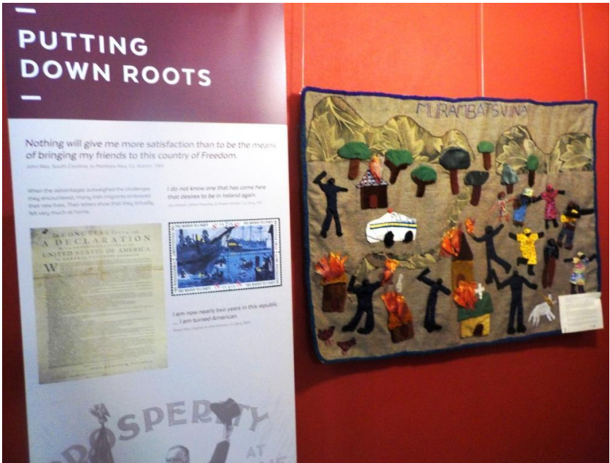
Red Wall gallery, view of pop up and Zimbabwe arpilleras